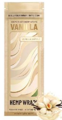
VANILLA SUNSHINE BEAM