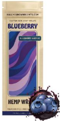
BLUEBERRY MOON MAGIC