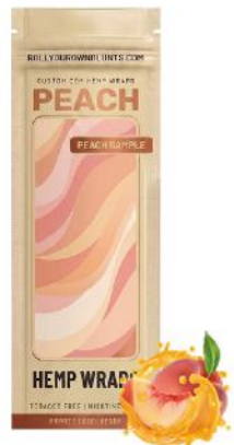
PEACHY PIXIE DUST