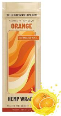
ORANGE ORCHARD BREEZE