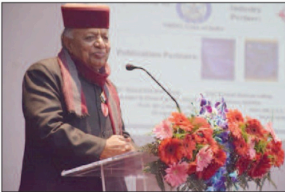
New Delhi . Maharaja Agrasen Institute of Technology (MAIT), in collaboration with NIT Delhi, University of Veracruz Mexico, and IGDТУW Delhi inaugurated the 1st International Conference on Green Technology and