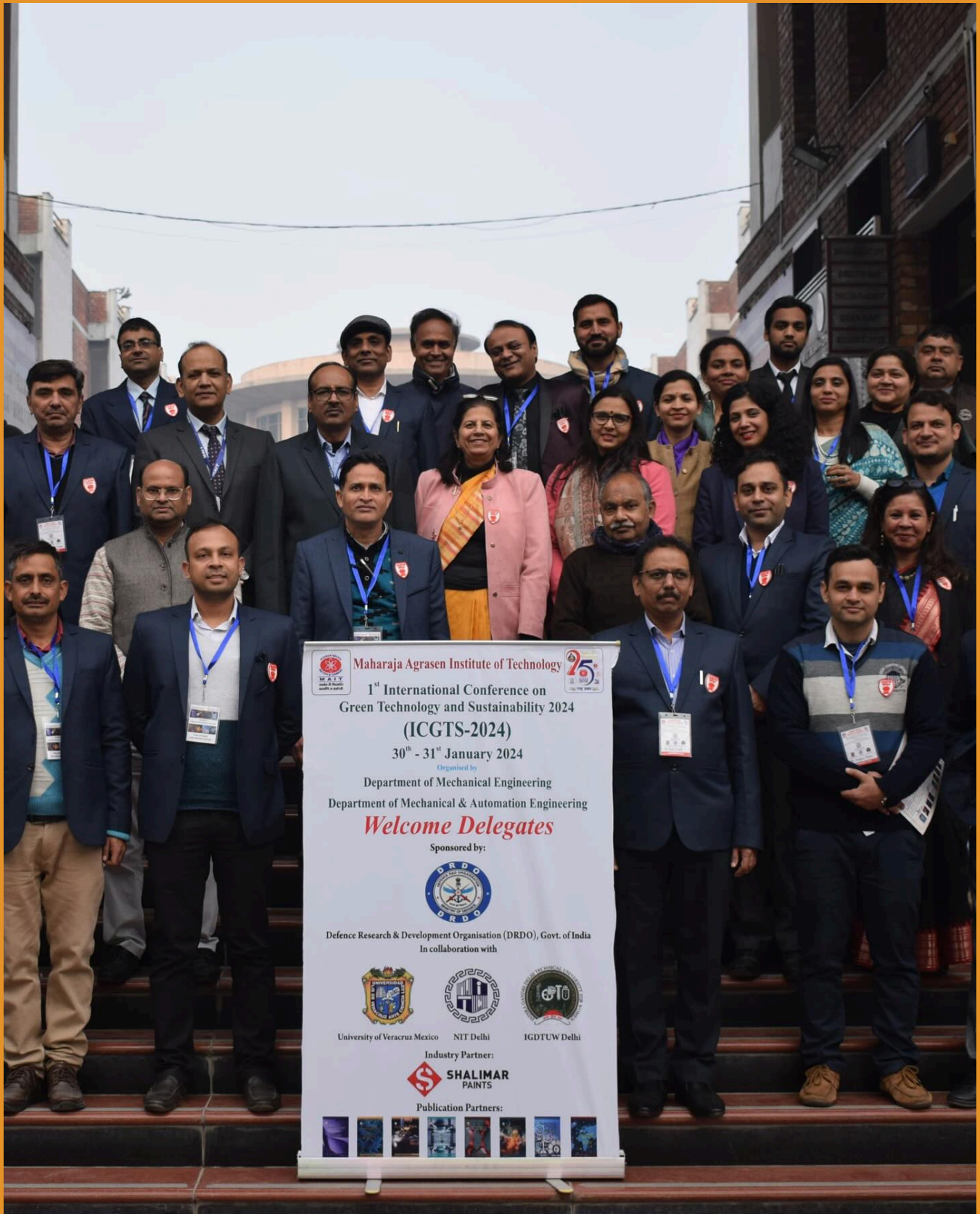
Department of Mechanical Engineering Maharaja Agrasen Institute of Technology