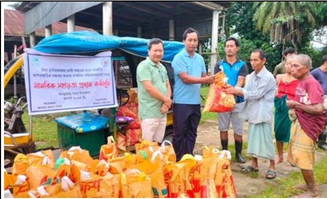
Caritas, along with its local partner Zabarang, is distributing dry food to the affected families in Khagrachari