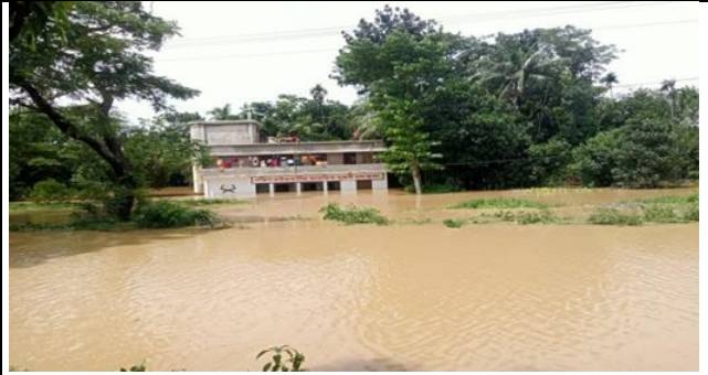
Many cyclone shelters in the Feni Sadar sub-district were partly submerged due to the flooding.