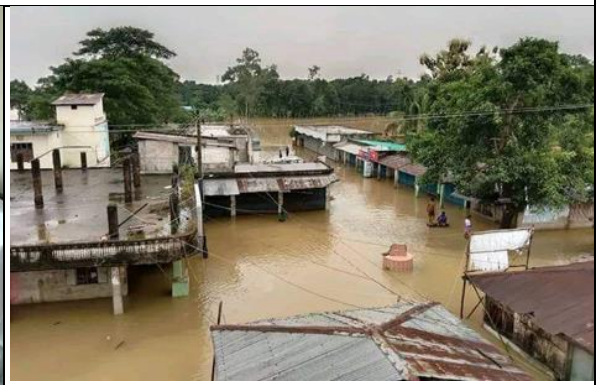
Flood situation in Fatikchari Sub-district of Chattogram