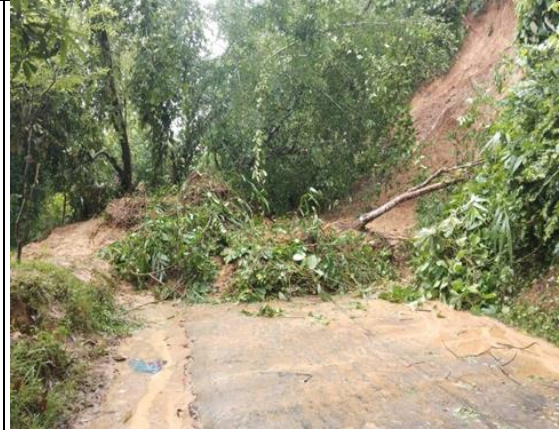
Many roads in Khagrachari have become blocked due to landslides caused by heavy rainfall