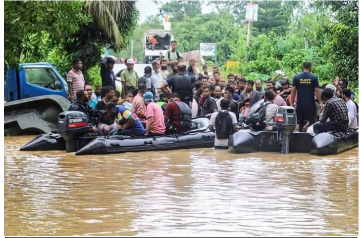
Evacuation of Bangladesh Navy and coast guard in Feni.

More than 50 villages in the Sadar Union, Anandapur, Munshirhat, and Amjadhat Union have been flooded. Similarly, over 50 villages in Parshuram's Mirzanagar, Chithalia, Bakshmahmud, and municipal town areas have been inundated. Several villages in Chagalnaiya's Pathan Nagar, Radhanagar and Shuvopur Unions are waterlogged.