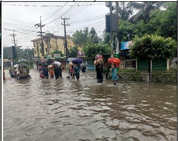
Inundation Situation in Feni City Areas