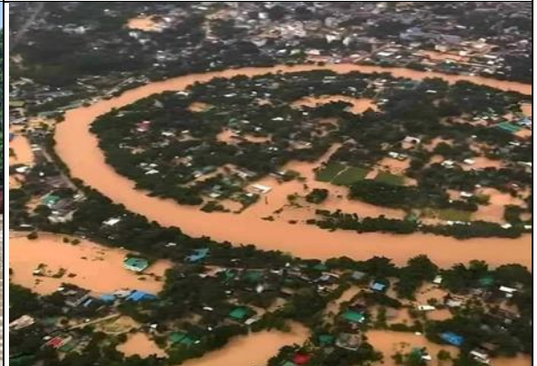
Fire Service Station Also Flooded in Khagrachari District