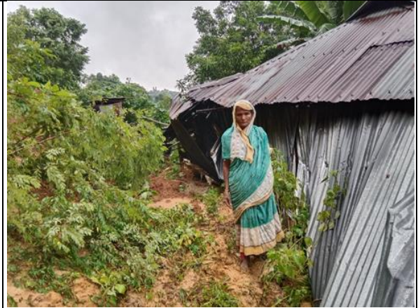
Due to landslides, houses were damaged in Rangunia