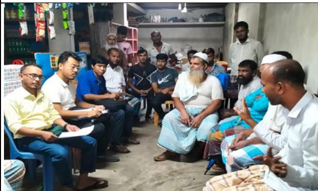
Caritas staff are conducting FGDs with the affected people at Char Poragacha Union in the Ramgoti sub-district