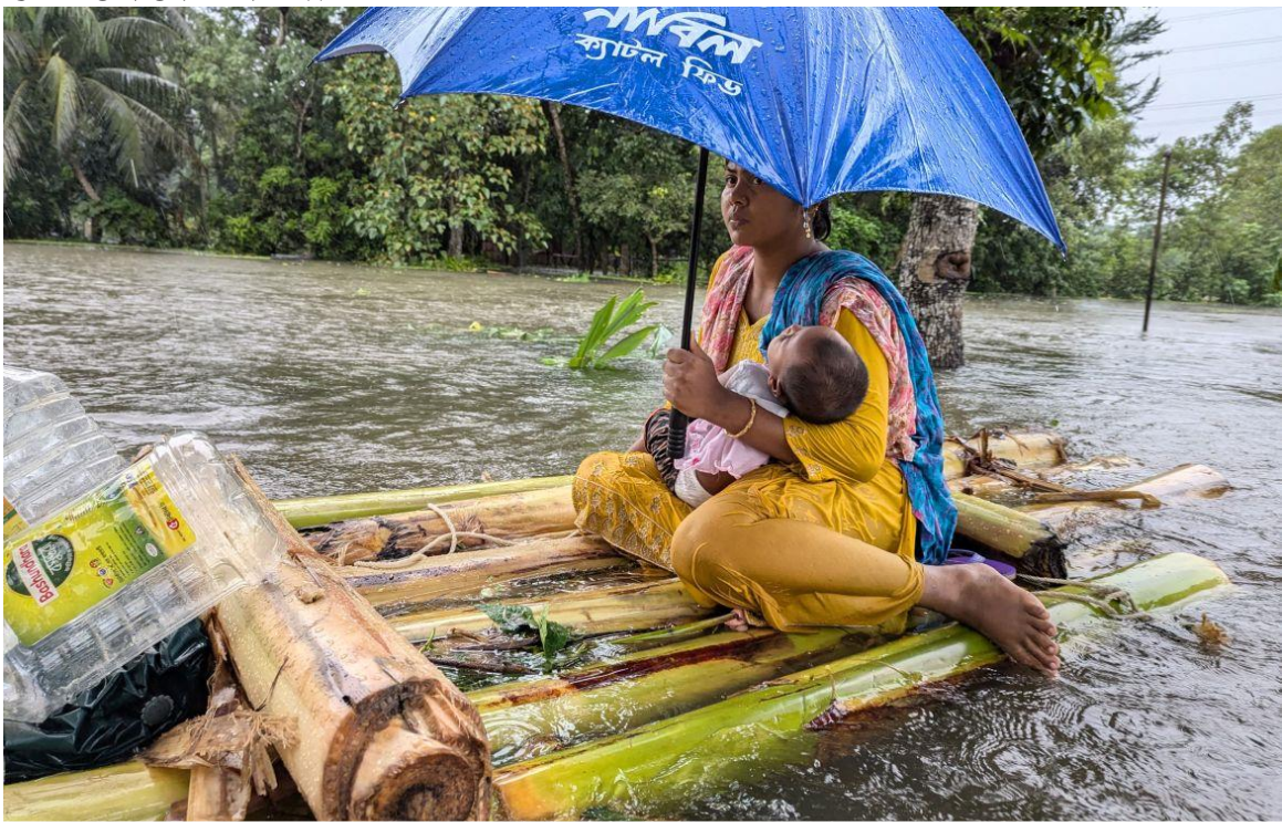
A woman and her child wade through floodwaters in Feni, one of the worst-hit areas.

More than 4.8 million people of 887,000 families under 584 unions and municipalities of 77 upazila in 11 districts of Bangladesh are suffering from the devastating flood triggered by torrential rains, with hundreds of homes under water.