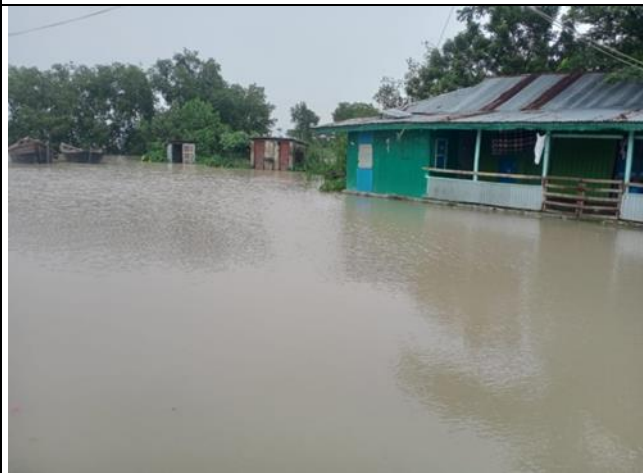
Waterlogging Situation in Char-Abdullah of Kamalnagar Sub-district