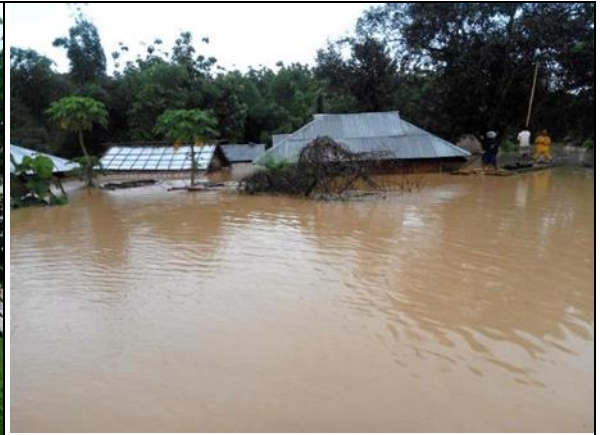
Many Houses Are Completely Submerged in Matiranga Sub-district of Khagrachari District