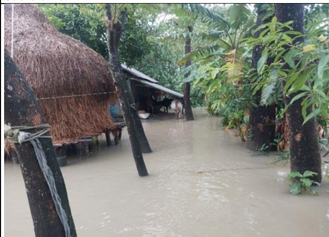
Situation in Shaberhat Union of Kamalnagar Sub-district, Lakshmipur