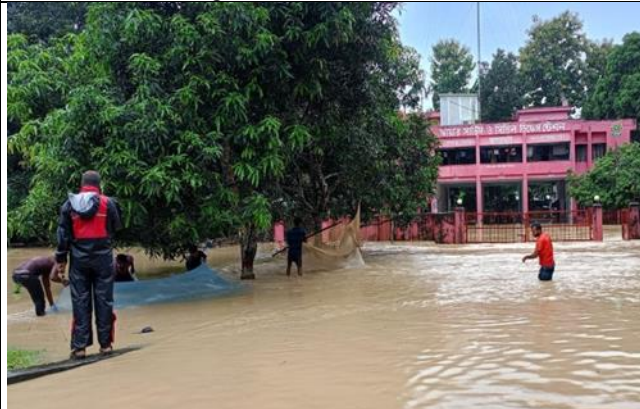
Situation in Avha Para, Matiranga of Khagrachari District