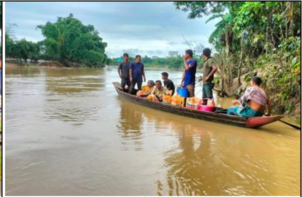
Caritas is delivering dry food by boat to people living in the remote hilly areas of Khagrachari