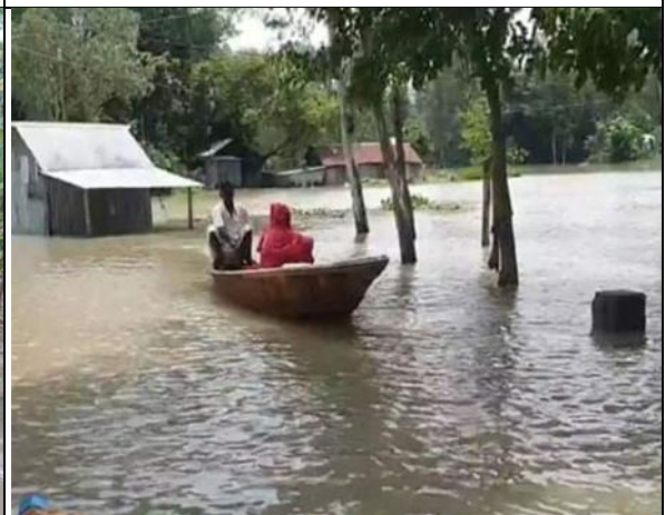
Situation in Nijhumdwip Union of Hatiya Upazila, Noakhali District