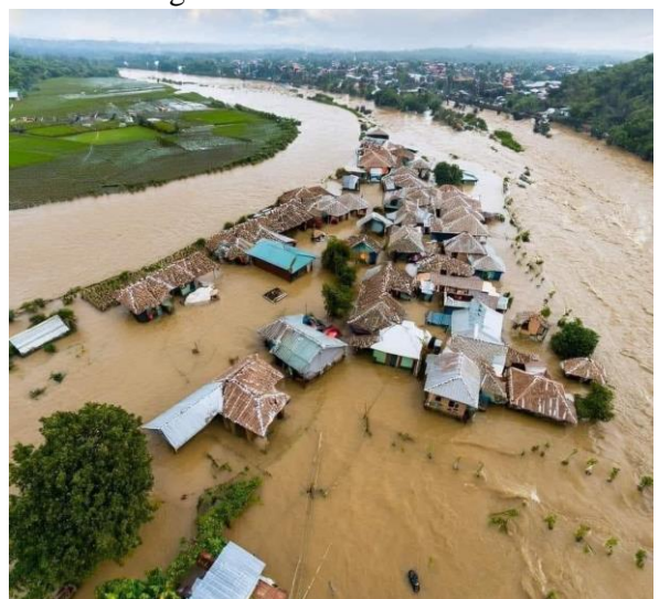
Khagrachari sadar upazila under water

Thousands of families in at least 20 villages along the banks of the Chengi River, such as Ganjapara, Bangalkathi, Bottali, Chakmapara, Muslimpara, Mehedibagh, Kaladaba, Ruykhai Choudhurypara, and Khobong Puriya, are waterlogged. The Bangladesh Army, Fire Service and Civil Defense, Red Crescent Society, and various volunteer organizations have started rescue operations.