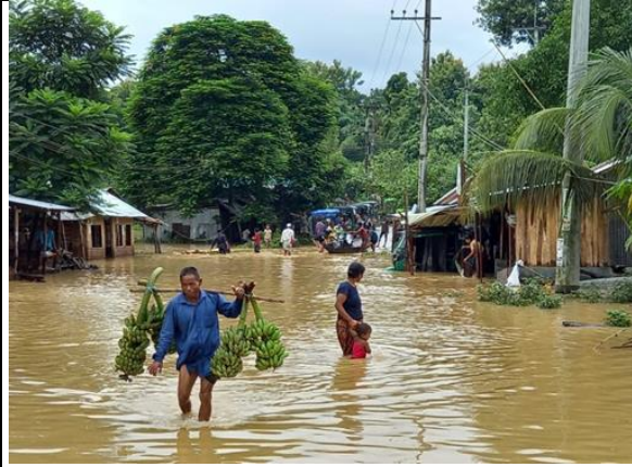
Situation in Nuner Chari Area of Khagrachari District

Photographs of impacts of flood in different districts.