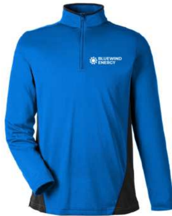
M786 | Harriton Men's Flash Snag Protection Plus IL Colorblock Quarter-Zip