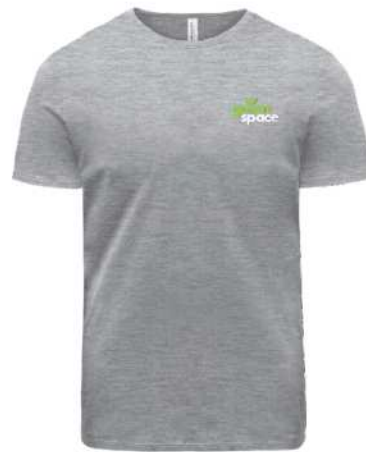
180A | Threadfast Apparel Unisex Ultimate T-Shirt