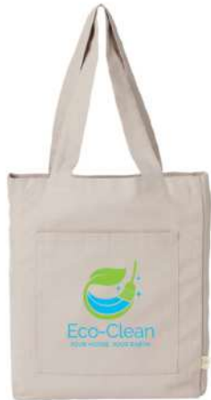
EC8205 | econscious Unisex Reclaimist Everywhere Tote