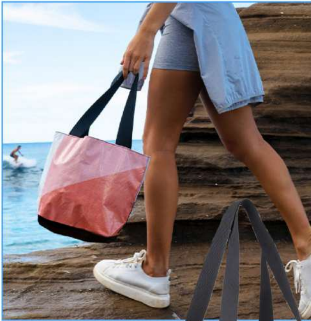
RF011 | Rareform Mini Blake Tote