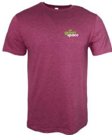
T1001 | Threadfast Apparel Epic Unisex CV C T-Shirt