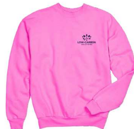
P1607 | Hanes Unisex Ecosmart® 50/50 Crewneck Sweatshirt