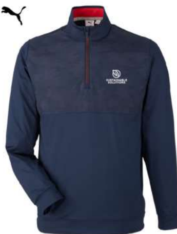
537472 | Puma Golf Men's Volition Camo Cover Quarter-Zip