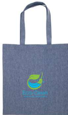
OAD113R | OAD Midweight Recycled Cotton Canvas Tote Bag