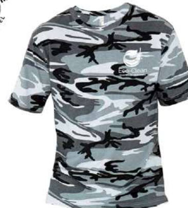
3907 | Code Five Men's Camo T-Shirt