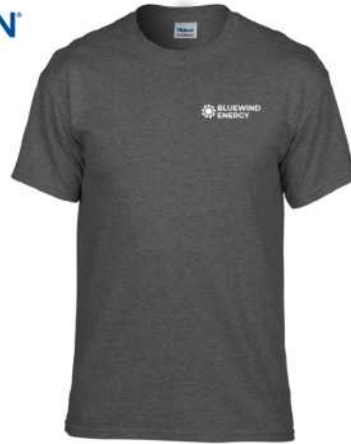
G800 | Gildan Adult 50/50 T-Shirt