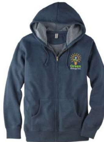
EC5680 | econscious Unisex Heathered Full-Zip Hooded Sweatshirt