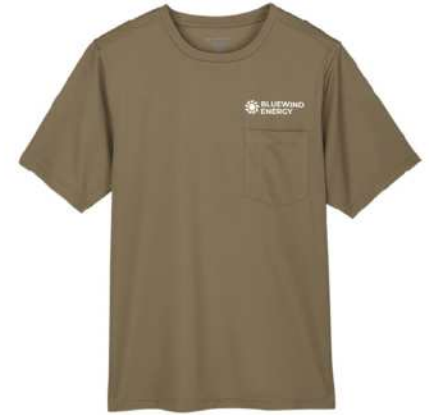
M118 | Harriton Charge Snag And Soil Protect Unisex T-Shirt