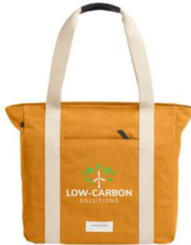
NU007 | Native Union Work From Anywhere Tote Bag