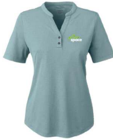
NE102W | North End Ladies' Replay Recycled Polo