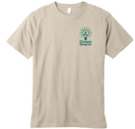
EC1000 | econscious Unisex Classic Short-Sleeve T-Shirt