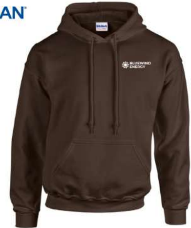
G185 | Gildan Adult Heavy Blend™ Hooded Sweatshirt