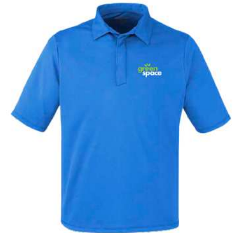
NE110 | North End Men's Revive Coolcore® Polo