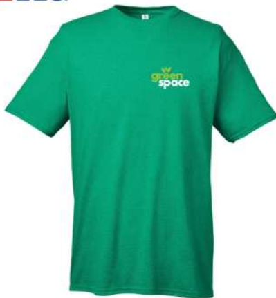
29M | Jerzees Adult DRI-POWER® ACTIVE T-Shirt