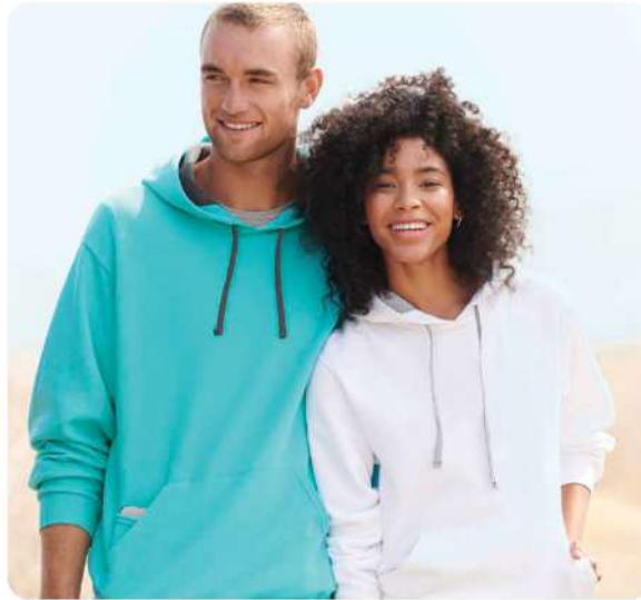
SF76R | Fruit of the Loom Adult SofSpun® Hooded Sweatshirt