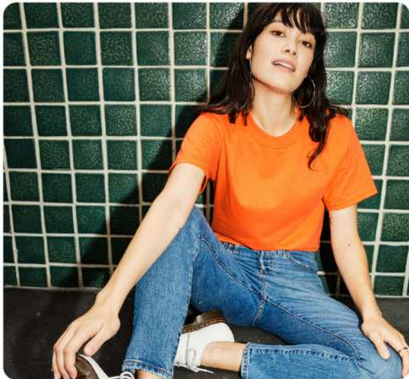
5180 | Hanes Unisex Beefy-T® T-Shirt