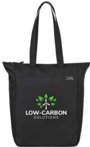
100804 | Gemline Renew rPET Zipper Tote