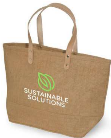
LT-4248 | Prime Line Hamptons Jute Tote