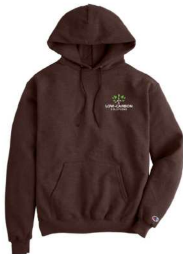
S700 | Champion Adult Powerblend® Pullover Hooded Sweatshirt