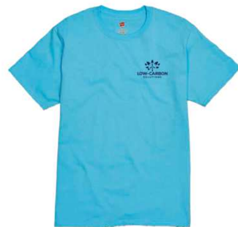
5250T | Hanes Men's Authentic-T T-Shirt