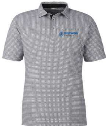
SW2200 | Swannies Golf Men's Tanner Printed Polo