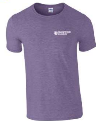
G640 | Gildan Adult Softstyle® T-Shirt