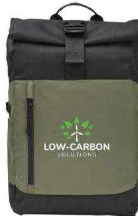
EC9901 | econscious Grove Rolltop Backpack