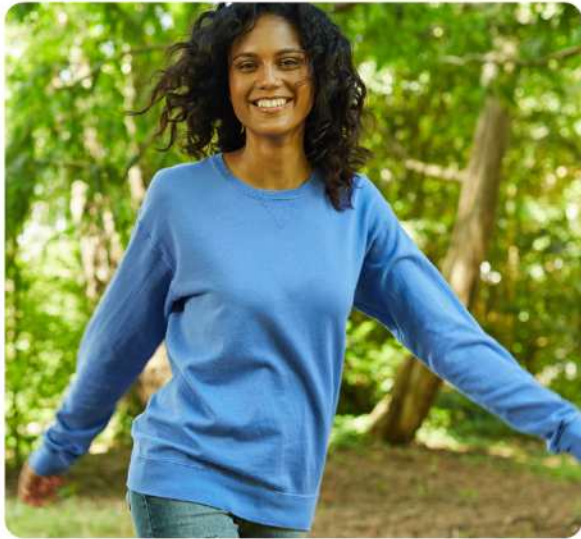
GDH400 | ComfortWash by Hanes Unisex Crew Sweatshirt