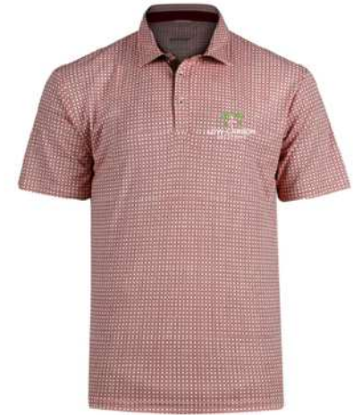
SW2200 | Swannies Golf Men's Tanner Printed Polo