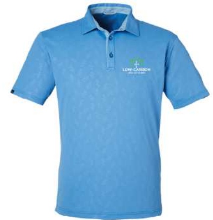
SW2100 | Swannies Golf Men's Barrett Embossed Polo