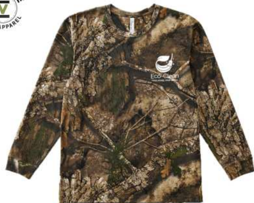
3981 | Code Five Men's Realtree Camo Long-Sleeve T-Shirt