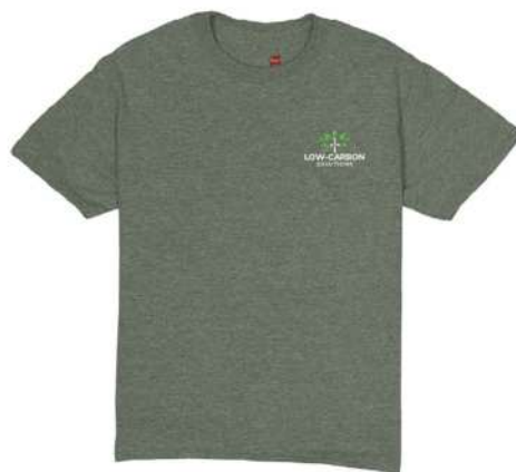
5170 | Hanes Unisex Ecosmart® T-Shirt