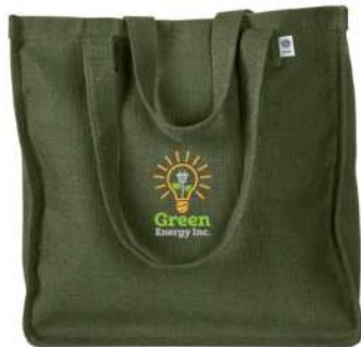
EC8015 | econscious Hemp Blend Market Tote