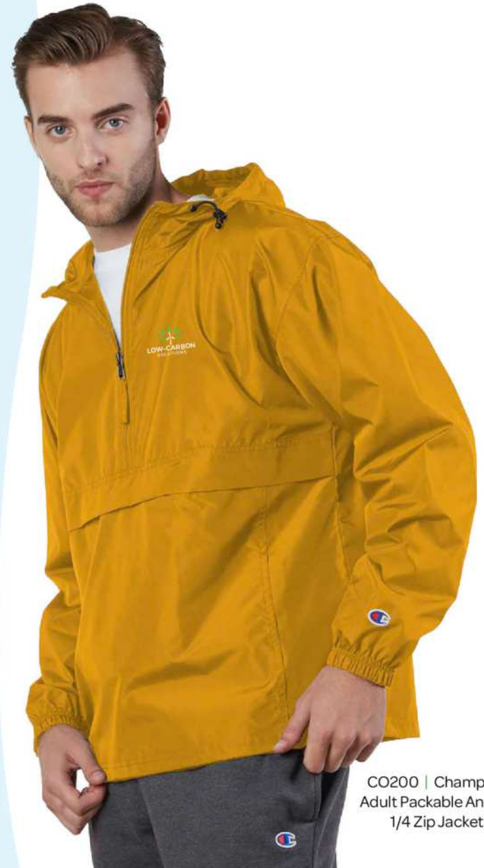
CO200 | Champion Adult Packable Anorak 1/4 Zip Jacket

Shop all Sustainable Manufacturing Products