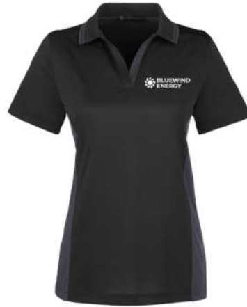
M386W | Harriton Ladies' Flash Snag Protection Plus IL Colorblock Polo