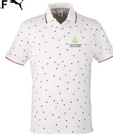
537477 | Puma Golf Men's Volition Skylight Polo