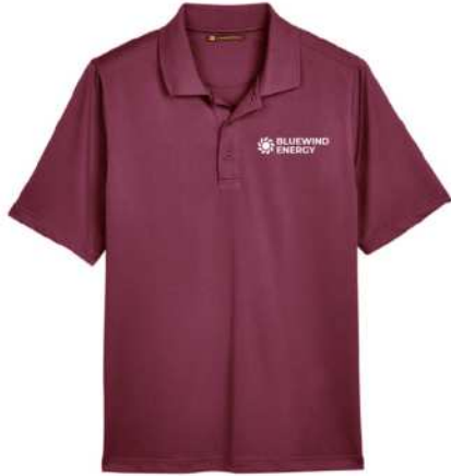
M348 | Harriton Men's Advantage Snag Protection Plus Polo