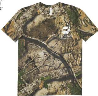
3980 | Code Five Men's Realtree Camo T-Shirt