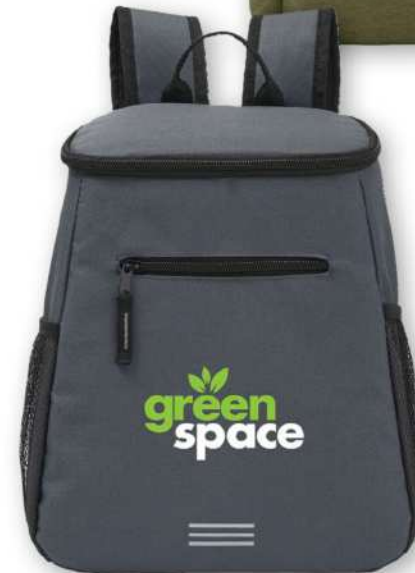
CE056 | CORE365 Backpack Cooler