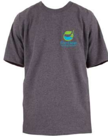
360A | Threadfast Apparel Titan Heavyweight Reclaimed CVC T-Shirt