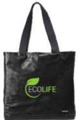
RF010 | Rareform Blake Tote