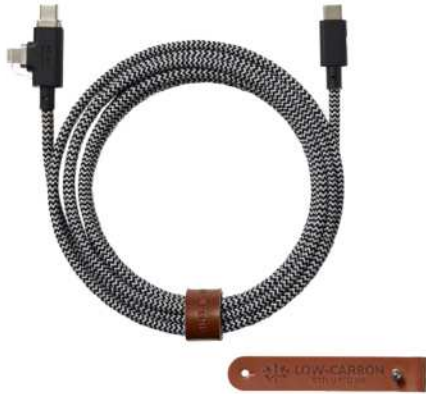
NU002 | Native Union Belt Duo Pro, 240w