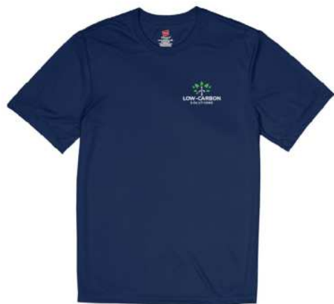
4820 | Hanes Adult Cool DRI® with FreshIQ T-Shirt