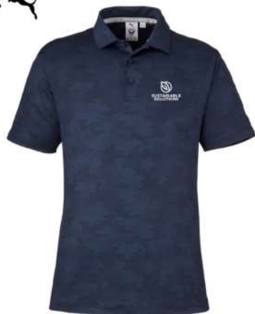
537471 | Puma Golf Men's Volition Camo Cover Polo