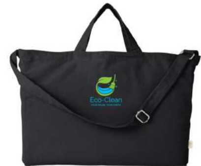
EC8207 | econscious Unisex Reclaimist G2G Bag