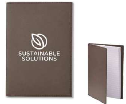
EC9801 | econscious Coffee Refillable Journal