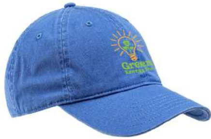
EC7000 | econscious Unstructured Eco Baseball Cap