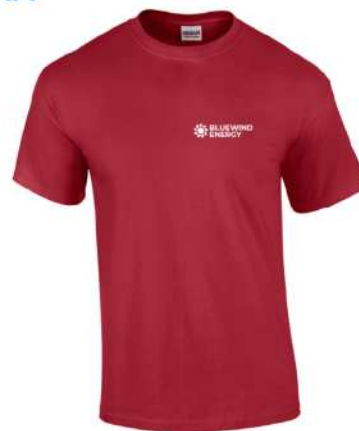
G200 | Gildan Adult Ultra Cotton® T-Shirt