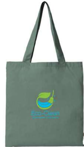
EC8200 | econscious Unisex Reclaimist Elemental Tote