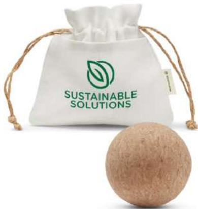
EC9982 | econscious Cork Massage Ball