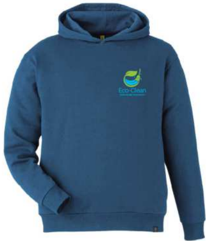
EC5300 | econscious Unisex Reclaimist Pullover Hooded Sweatshirt