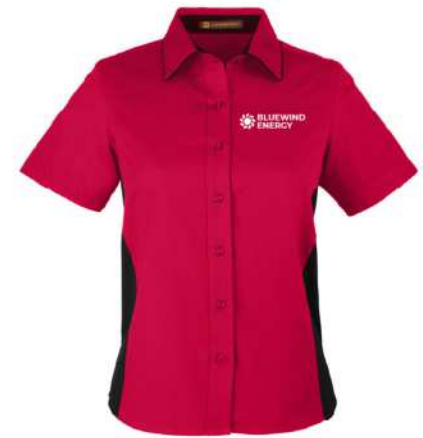
M586 | Harriton Men's Flash IL Colorblock Short Sleeve Shirt