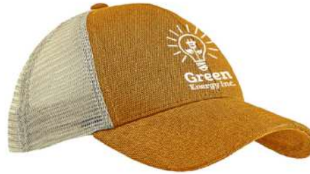
EC7093 | econscious Hemp Blend Trucker Cap