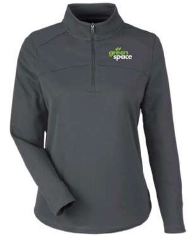
NE412 | North End Men's Express Tech Performance Quarter-Zip