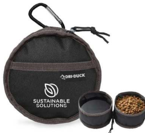
2921DD | Dri-Duck Packable Duo Pet Dish