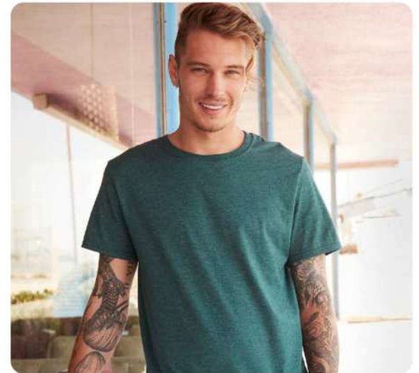
560MR | Jerzees Adult Premium Blend Ring-Spun T-Shirt