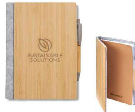
EC9802 | econscious Grove Refillable Bamboo Notebook & Pen