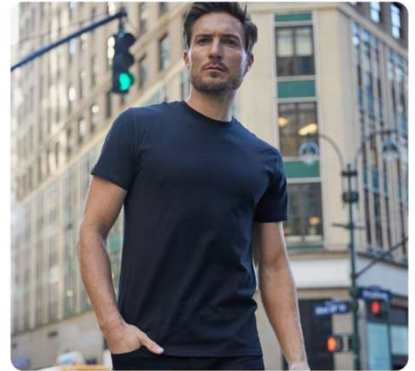
T1000 | Threadfast Apparel Epic Unisex T-Shirt