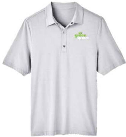
NE100 | North End Men's JAQ Snap-Up Stretch Performance Polo