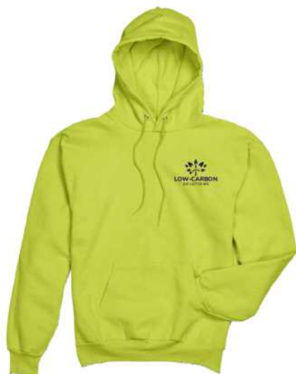
P170 | Hanes Unisex Ecosmart® 50/50 Pullover Hooded Sweatshirt