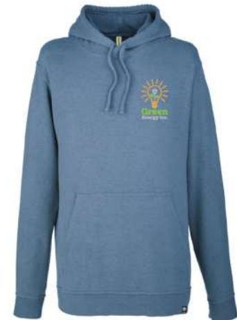
EC5950 | econscious Unisex Hemp Hero Pullover Hooded Sweatshirt