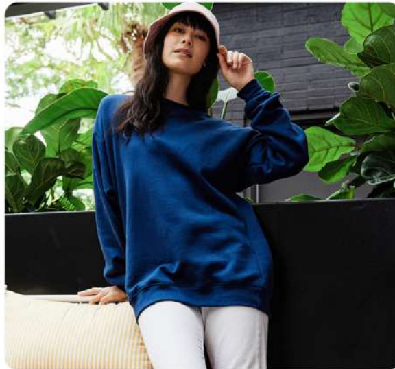
RS160 | Hanes Perfect Sweats Crew Sweatshirt