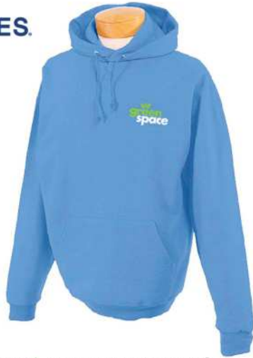
996 | Jerzees Adult NuBlend® Fleece Pullover Hooded Sweatshirt