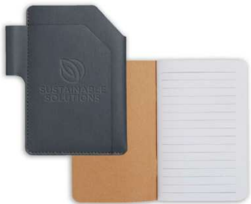
M006 | Harriton Ground Notes Jotter