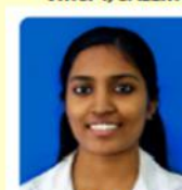
K.JEBA SRBS, PONDY