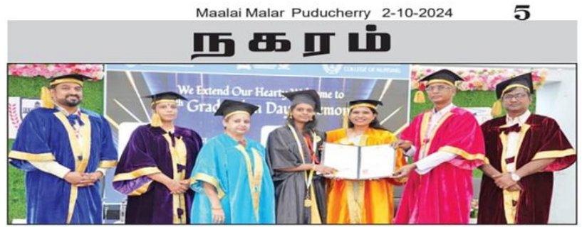
Maalai Malar Puducherry 2-10-2024