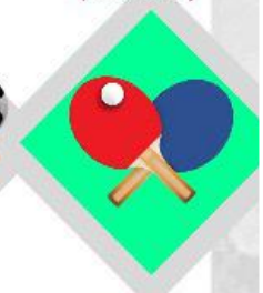
TABLE TENNIS (M&W)