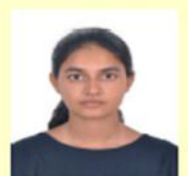
LINTA BIJU VMKVMC&H, SALEM