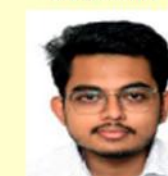
DEBUNGSHU NASCAR VMMC, KARAIKAL