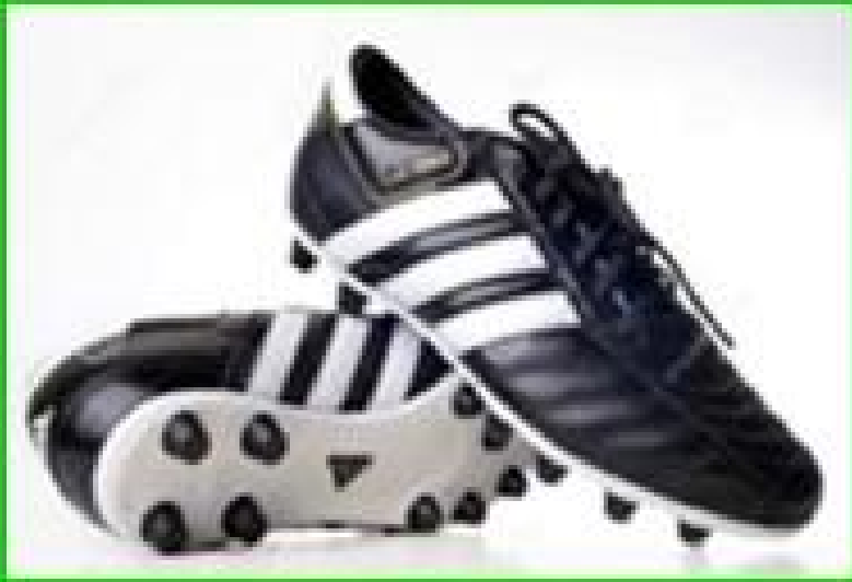
Football Boot—Moulded Stud