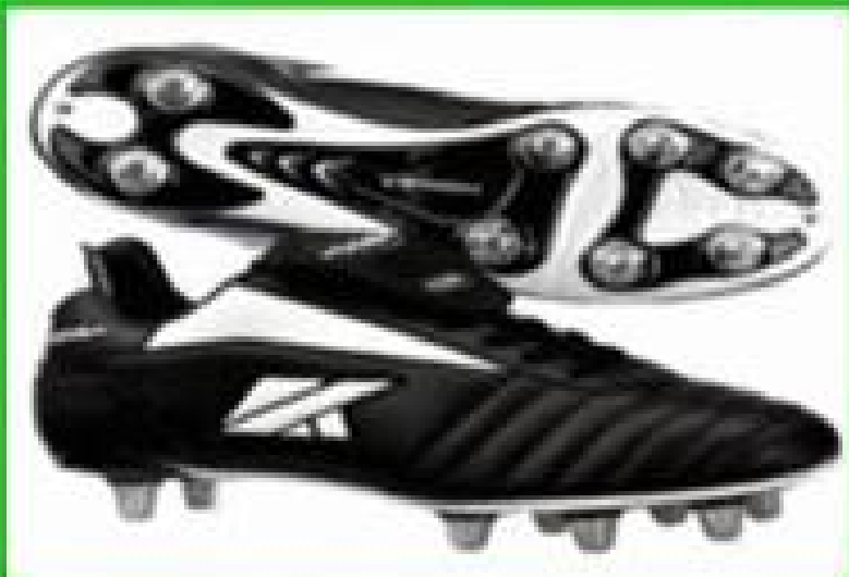
Rugby Boot—Metal Studs