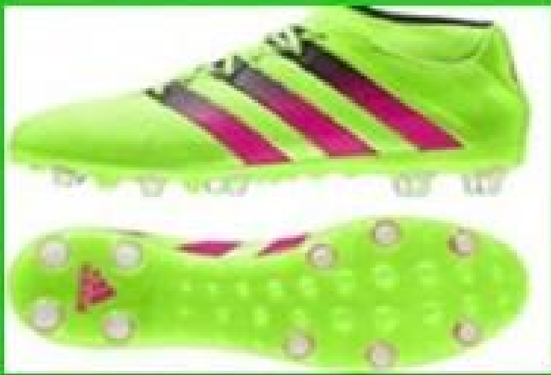
Football / Rugby Boot— Screw In Plastic Stud