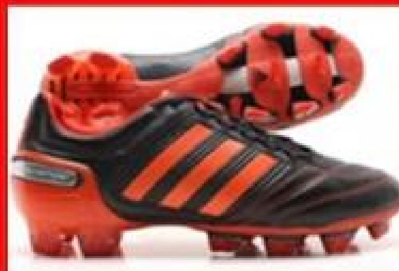
Football Boot (Blade)

All boots must be clean before entering the 3G pitch If you are unsure on your footwear please ask a member of staff