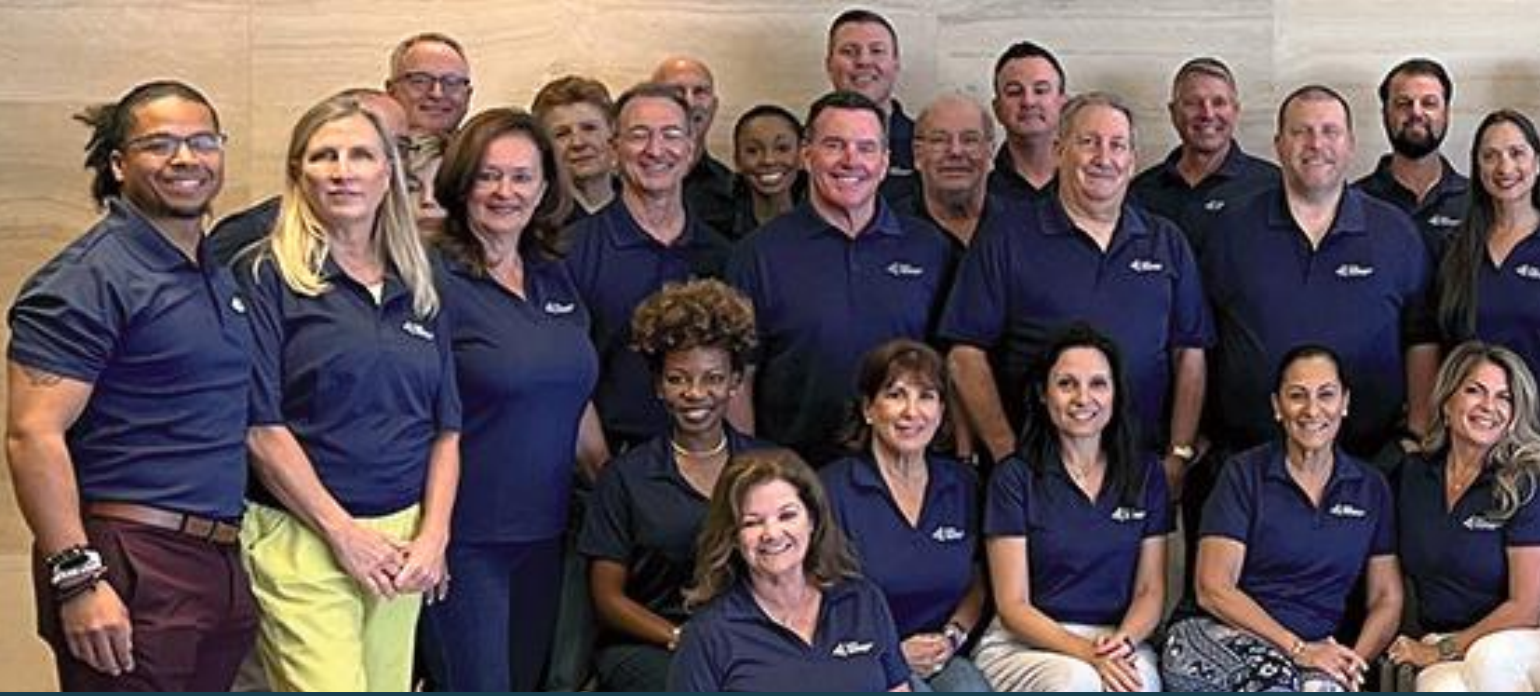
Junior Achievement of South Florida's Board of Directors attend a leadership retreat.