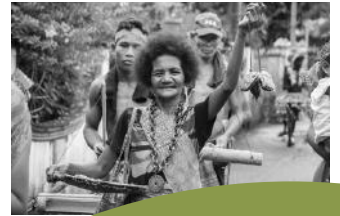
TUMANDOK. For the first time in history, the aboriginal Man-up Ati Community joined the Altavas Ati-Atihan Festival this year, showcasing their traditional attire on Wednesday, Jan. 22.