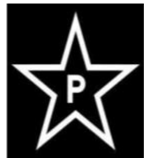
Figure 2: Rouvikonas logo/symbol.

Rouvikonas, founded in 2013, employs direct action tactics, including interventions against drug trafficking, attacks on symbols of state power, and assistance to migrants. They also participate in community-based initiatives, including food distribution and cultural events. Their latest action targeted the Hellenic Train company, whose train crash occurred in Tempi in February 2025; members broke into the company's offices and displayed a banner labelling them 'Murderers'. Rouvikonas's X (formerly Twitter) account is filled with