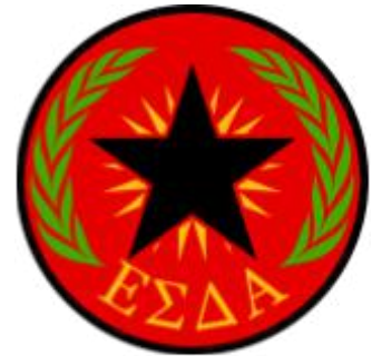
Figure 6: The Revolutionary Union for Internationalist Solidarity logo/symbol.

The Revolutionary Union for Internationalist Solidarity is an anarchist military unit founded in 2015 and was involved in the Syrian civil war. They are part of the International Freedom Battalion, a collective of foreign anarchist groups that fight for the Syrian Democratic Forces. They have fought against the Islamic State and Turkish forces, alongside the Kurdish People's Protection Units (YPG). In May 2017, they announced that they would spill blood 'from Rojava to Athens', which raised the alarms for the Greek authorities. After Haukur Hilmarrsson, one of RUIS's fighters, was killed by Turkish armed forces , the group called for attacks on Turkish sites in Greece. This led to the attacks on the Turkish consulate in Thessaloniki and the burning of a Turkish diplomat's vehicle.