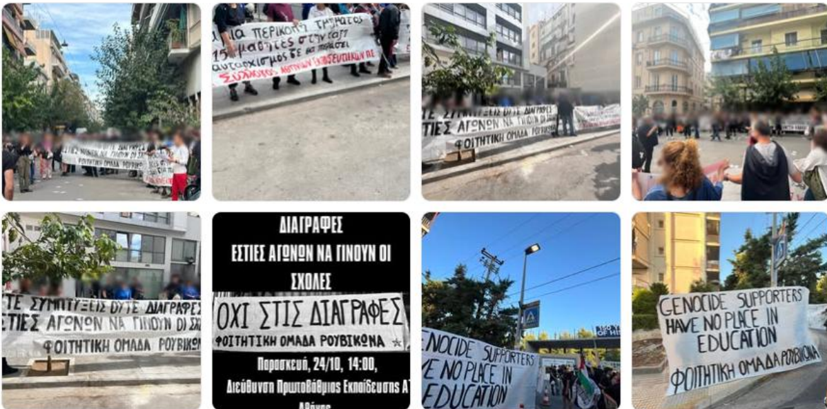
Figure 7: Anarchist action organised and promoted via the Rubicon Student Group at the Athens School of Philosophy.