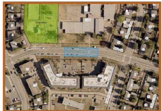
Part of main street will be closed during the event (shown above in blue)

Please check Facebook and GCA emails for the most up to date information.