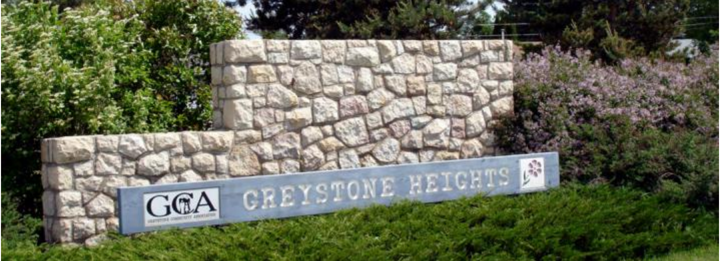
Photo Credit: Daryl Mitchell (2008) . Photo Modifications: scaled to fit. License: https://creativecommons.org/licenses/by-sa/3.0/