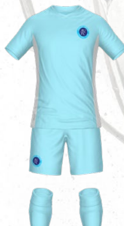
All light blue.