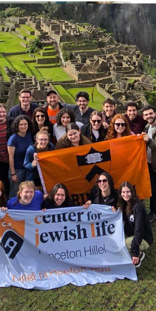
Peru Leadership Trip