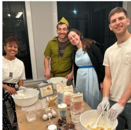
Bayit - Purim