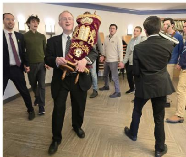
Yavneh Sefer Torah Dedication