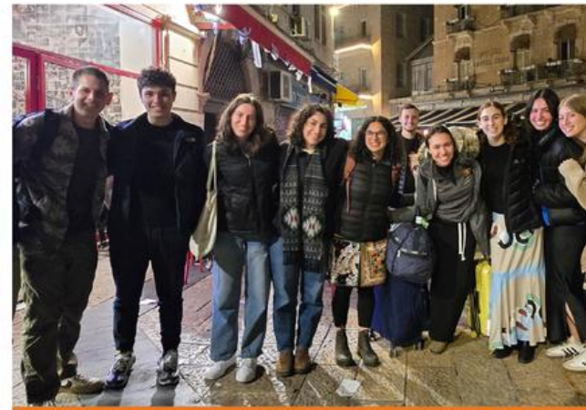
Shalom Hartman Israel Trip