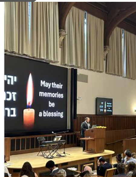
Oct. 7 th Memorial