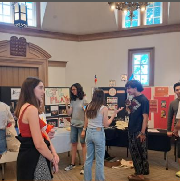
Welcome Back Fair