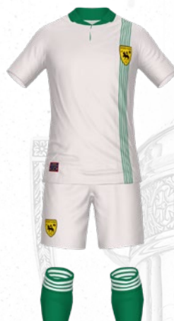
Cream shirts, cream shorts, green socks.