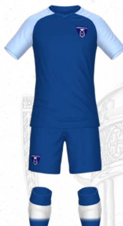
All royal blue and white.