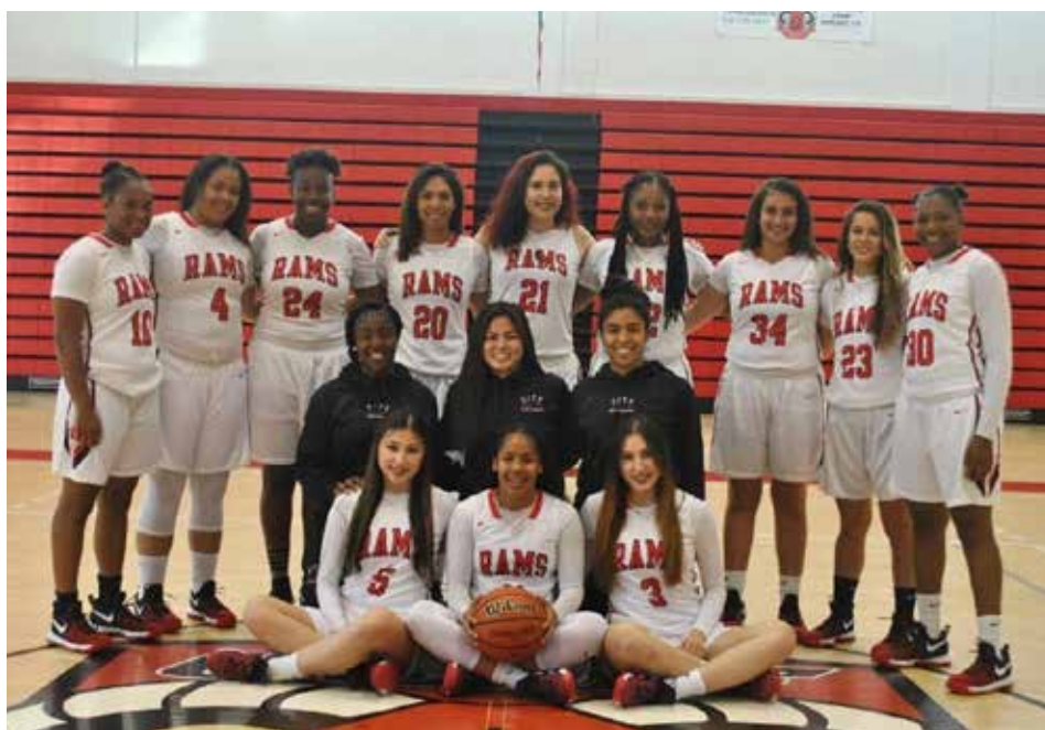
2017–2018 TEAM PHOTO