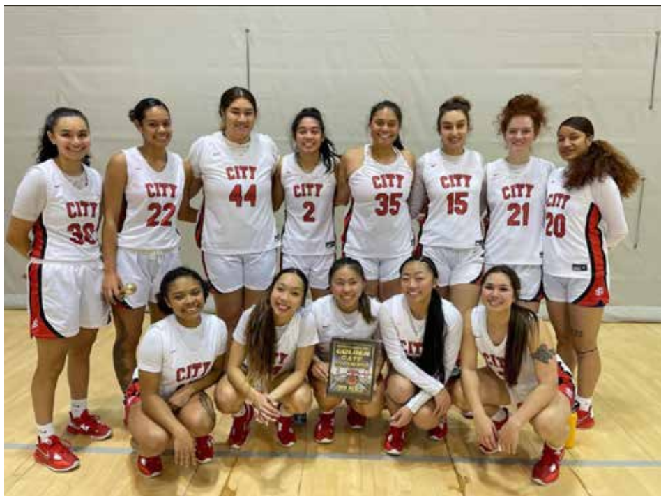
2021–2022 TEAM PHOTO