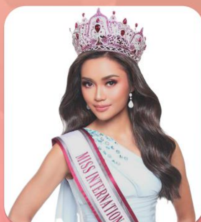
Farhana Nariswari Ambassador of the Indonesian Ministry of Youth and Sports & Puteri Indonesia 2023