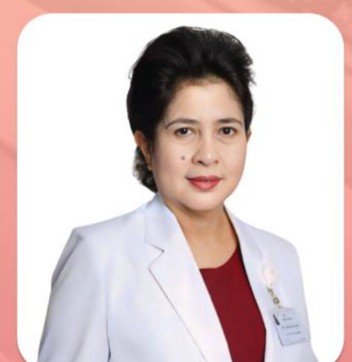
Prof. Dr. dr. Nila Djuwita Faried Anfasa Moeloek, Sp. M(K). Former Minister of Health of Indonesia