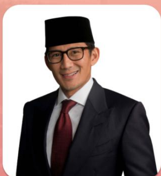
Dr. H. Sandiaga Salahuddin Uno, B.B.A., M.B.A Minister of Tourism and Creative Economy of Indonesia