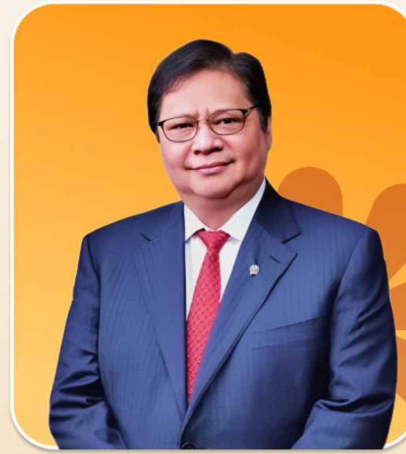
Dr. (HC) Ir. Airlangga Hartarto, MBA, MMT Coordinating Minister for Economic Affairs of Indonesia