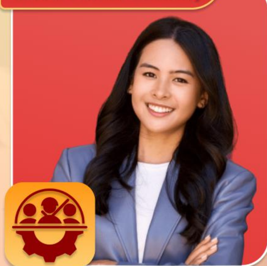
Maudy Ayunda Education activist, Government spokesperson for G20 Presidency