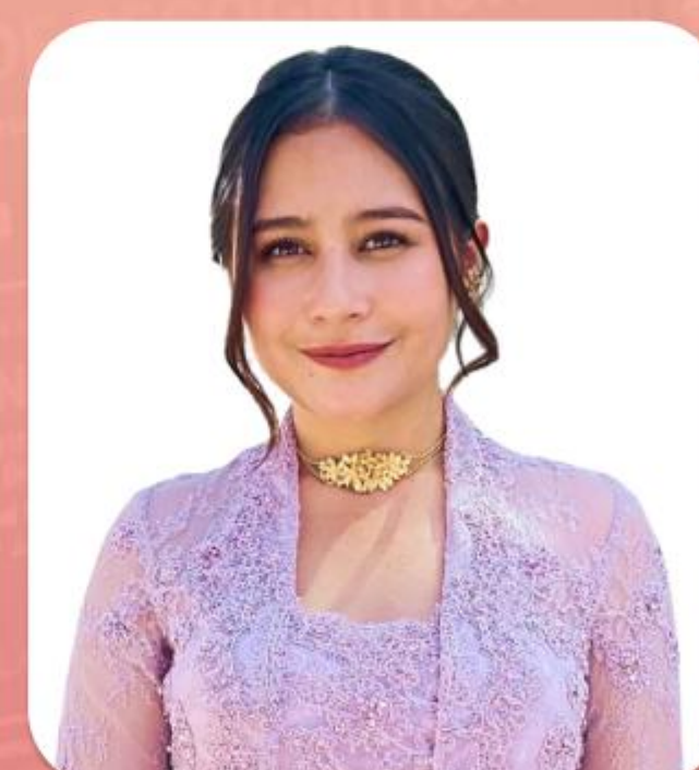
Prilly Latuconsina Founder of Sinemaku Pictures, Actress & Activist