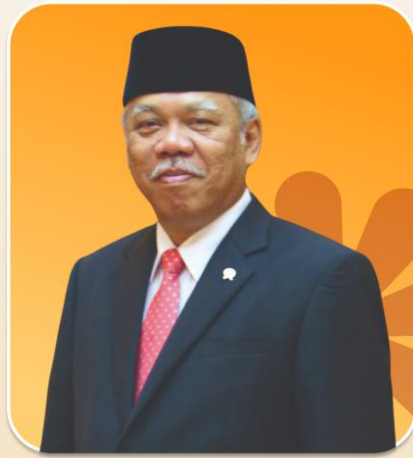
DR. Ir. M. Basuki Hadimuljono, M.Sc Minister of Public Works and Public Housing