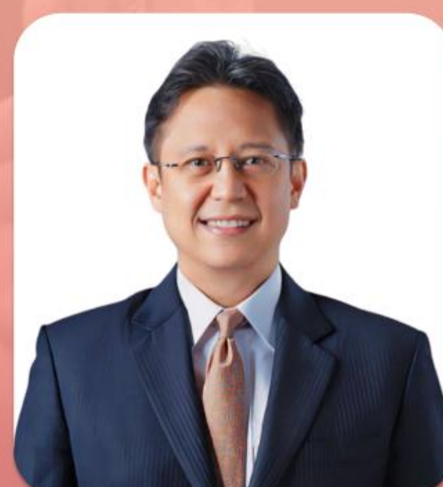
Ir. Budi Gunadi Sadikin, CHFC, CLU. Minister of Health of Indonesia