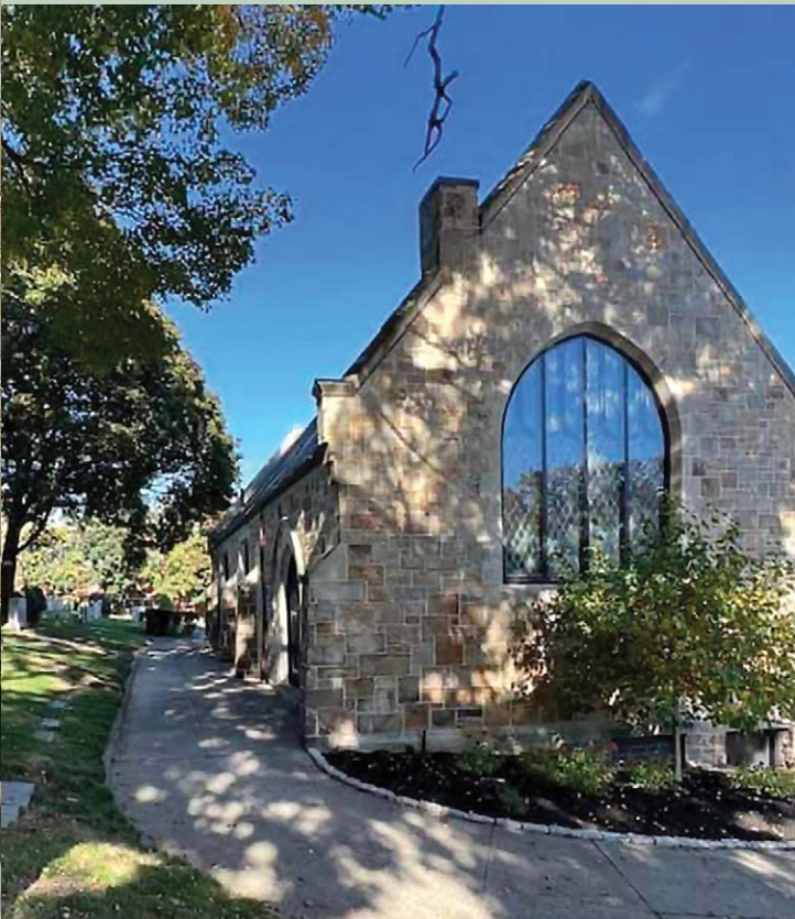
The Ohabei Shalom Cemetery & Chapel – East Boston. Built in 1903, the Chapel sits at the entrance to the first Jewish cemetery in Massachusetts, est. 1844. It is the oldest surviving Jewish mortuary chapel in Massachusetts.

HIGHLIGHT HISTORIC CEMETERY CHAPEL REHABILITATION The first phase of the interior restoration of the Ohabei Shalom Cemetery chapel is now complete, due to a generous matching grant from the Massachusetts Historical Commission. This initiative ensures the preservation of our rich historical presence in East Boston.