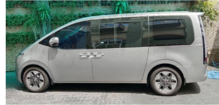
Van type #1 (Private/Hyundai)