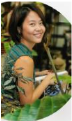
Ng Yang Ce Singapore @synceramic