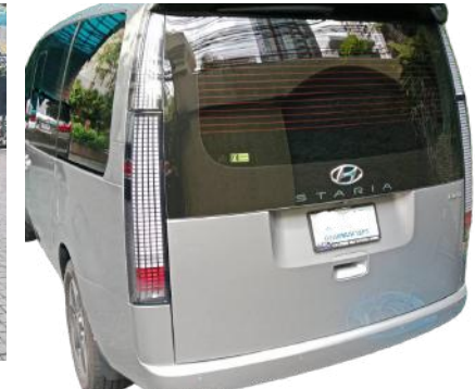
Van type #2