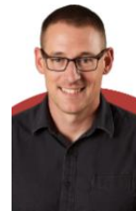
Brian Kakas USA @briankakasceramics