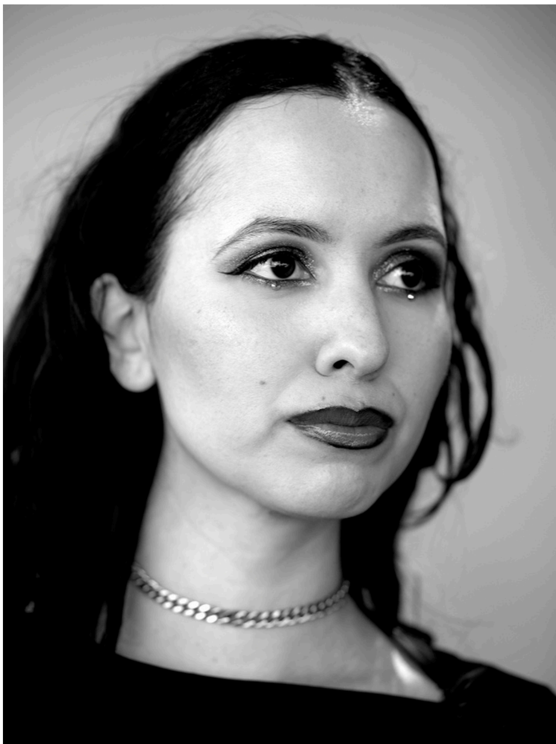
Portrait from DAWN/ECLIPSE OF A NEW ERA