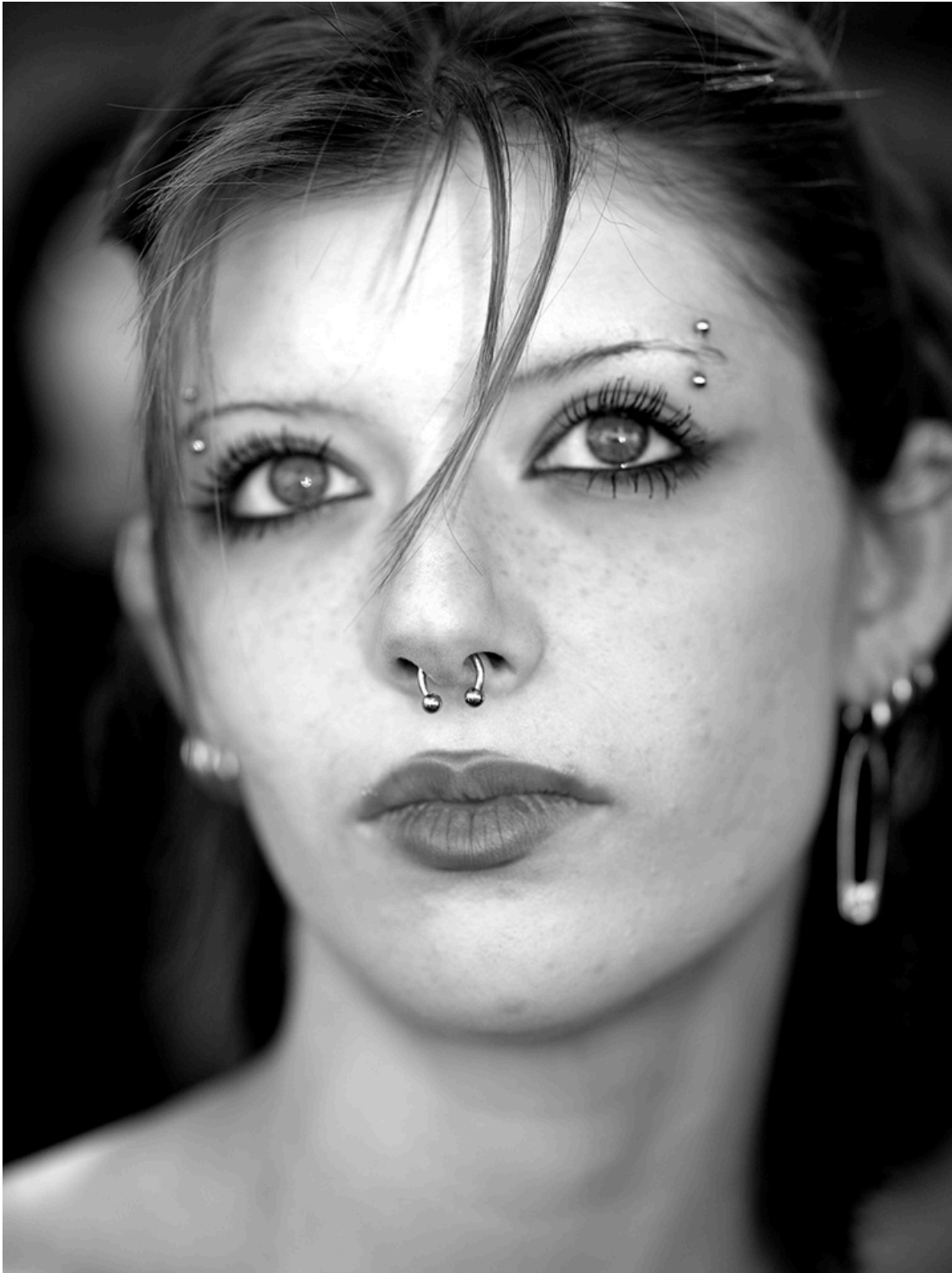
Portrait from DAWN/ECLIPSE OF A NEW ERA