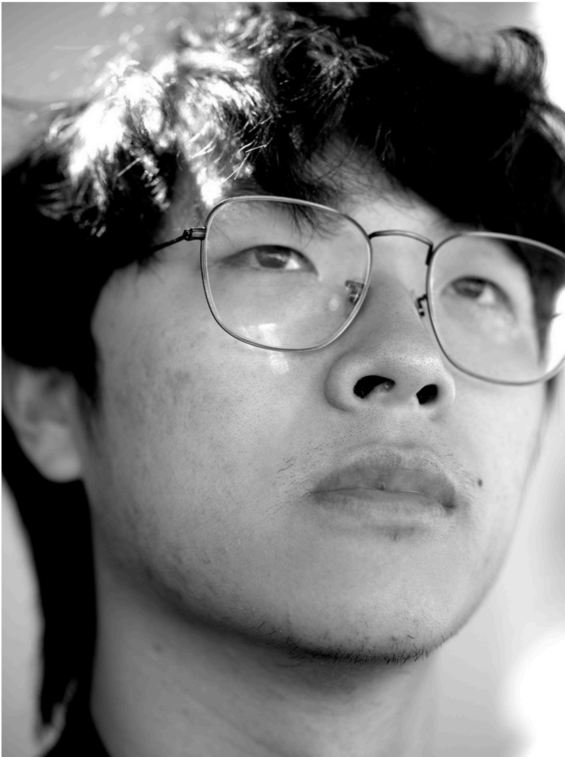
Portrait from DAWN/ECLIPSE OF A NEW ERA