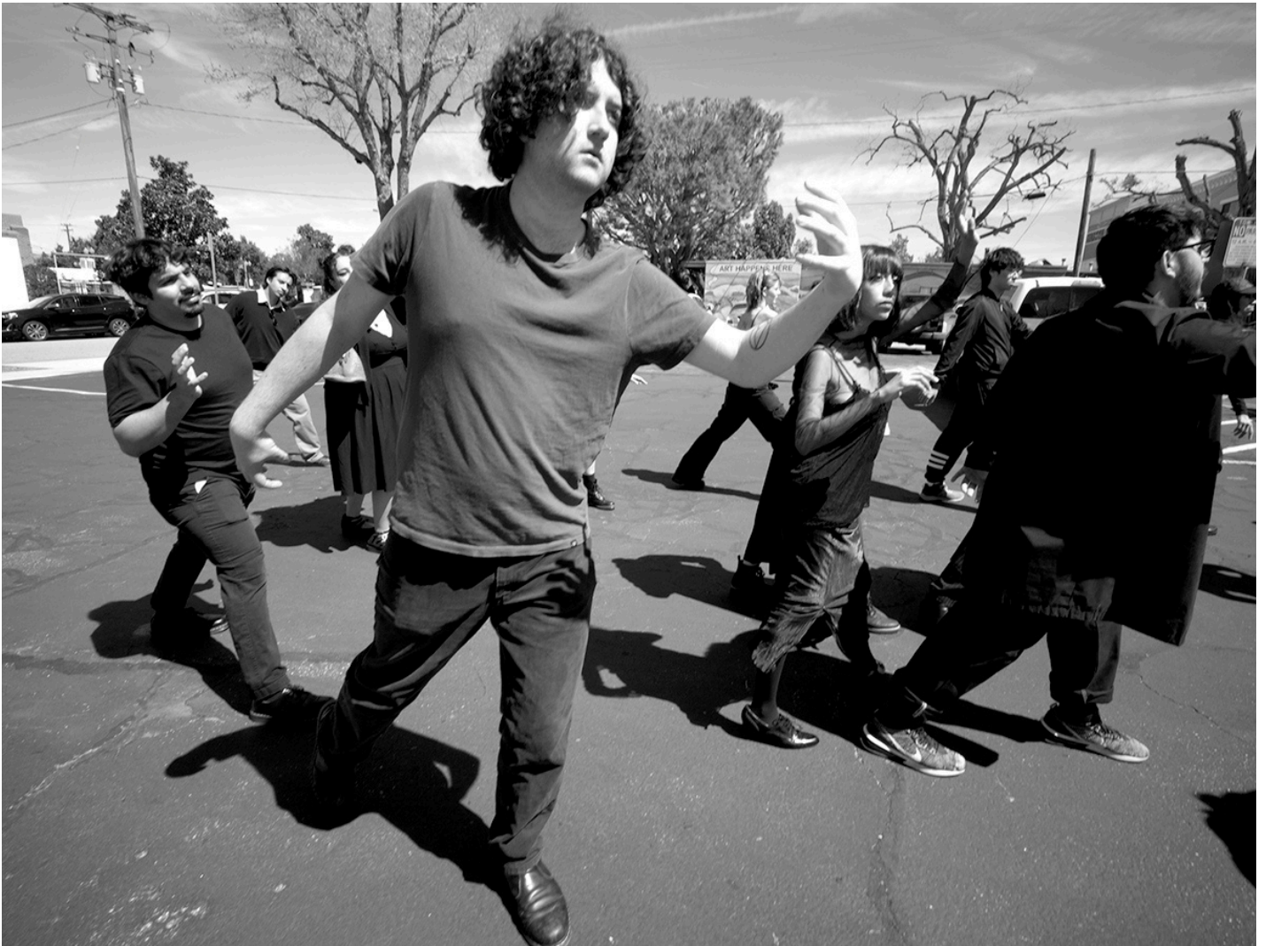
Portrait from DAWN/ECLIPSE OF A NEW ERA