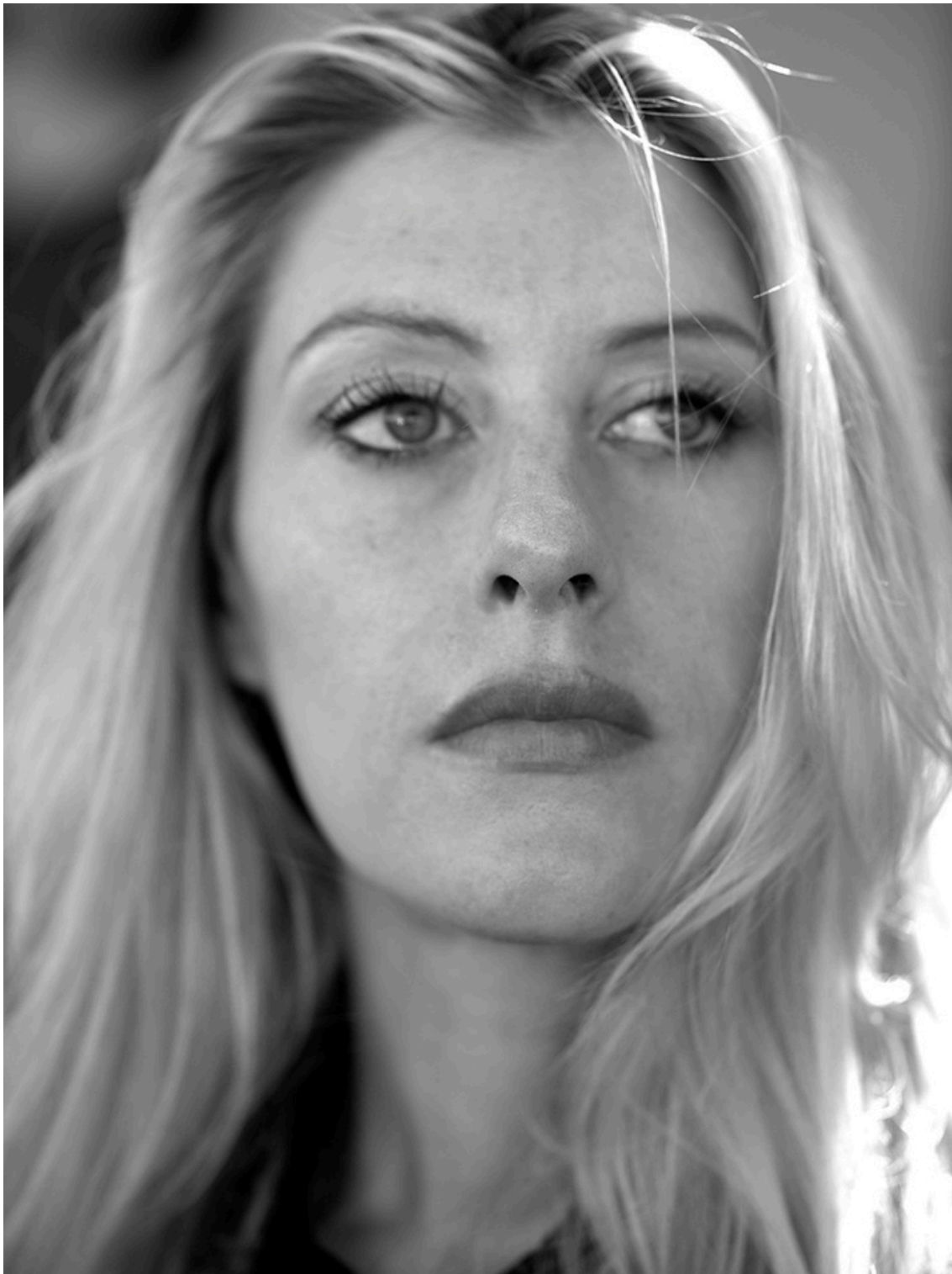
Portrait from DAWN/ECLIPSE OF A NEW ERA