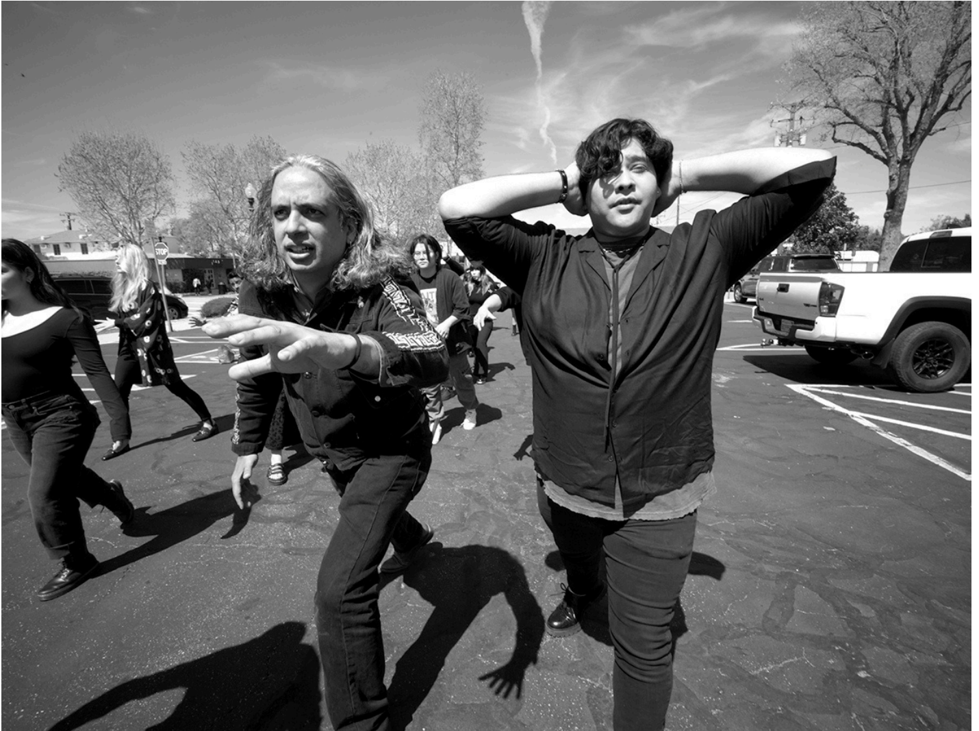
Portrait from DAWN/ECLIPSE OF A NEW ERA