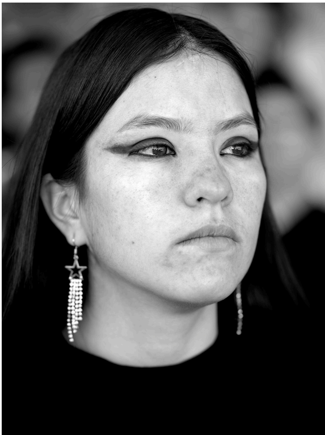
Portrait from DAWN/ECLIPSE OF A NEW ERA