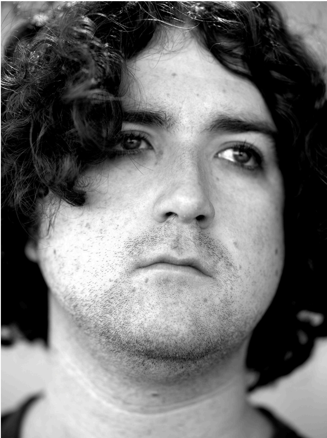
Portrait from DAWN/ECLIPSE OF A NEW ERA