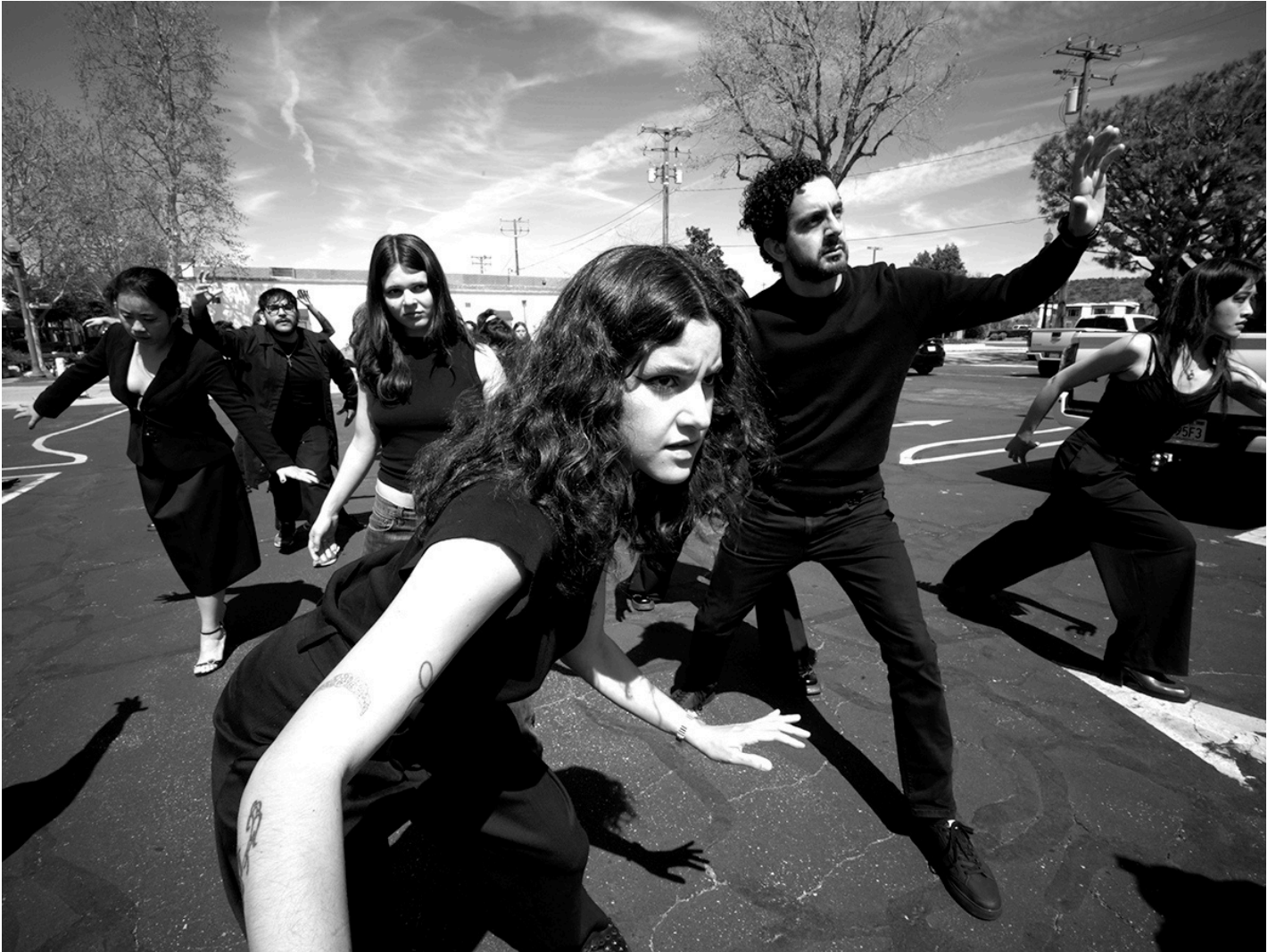
Portrait from DAWN/ECLIPSE OF A NEW ERA