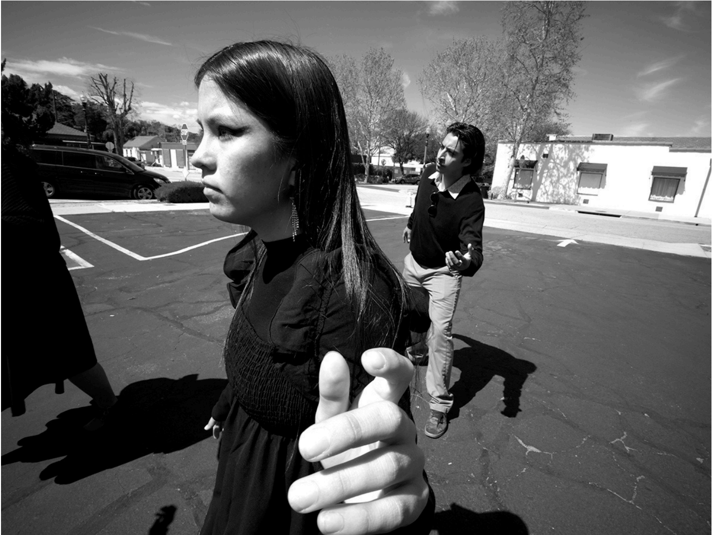
Portrait from DAWN/ECLIPSE OF A NEW ERA