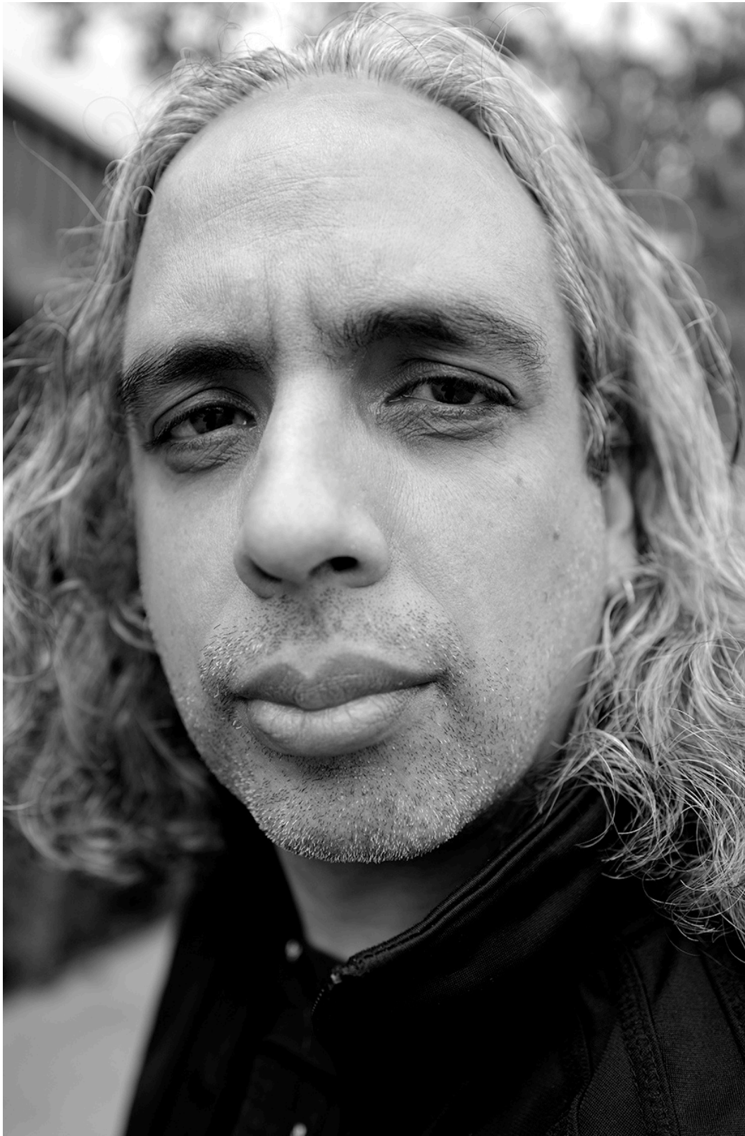
Portrait from DAWN/ECLIPSE OF A NEW ERA