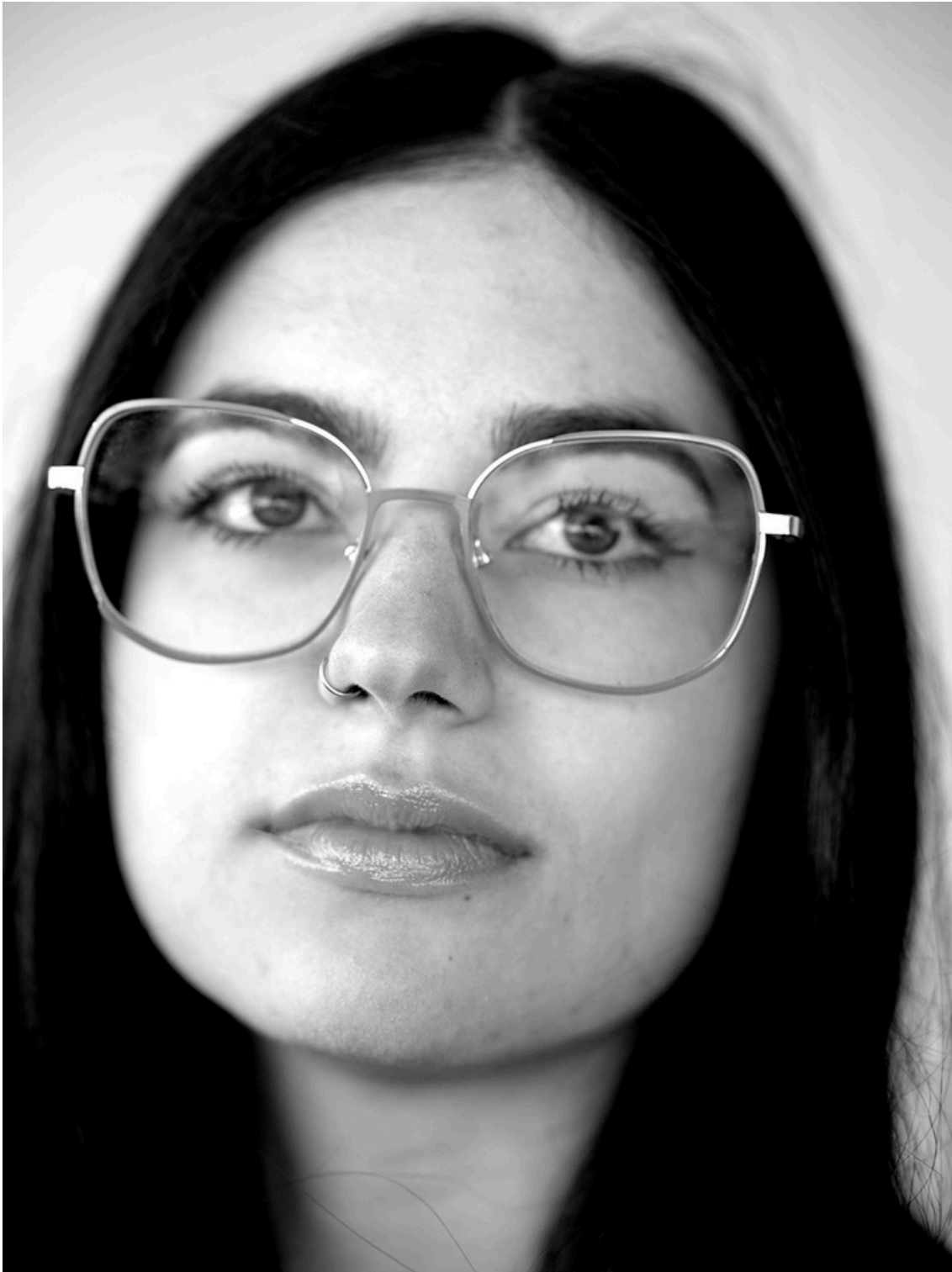
Portrait from DAWN/ECLIPSE OF A NEW ERA