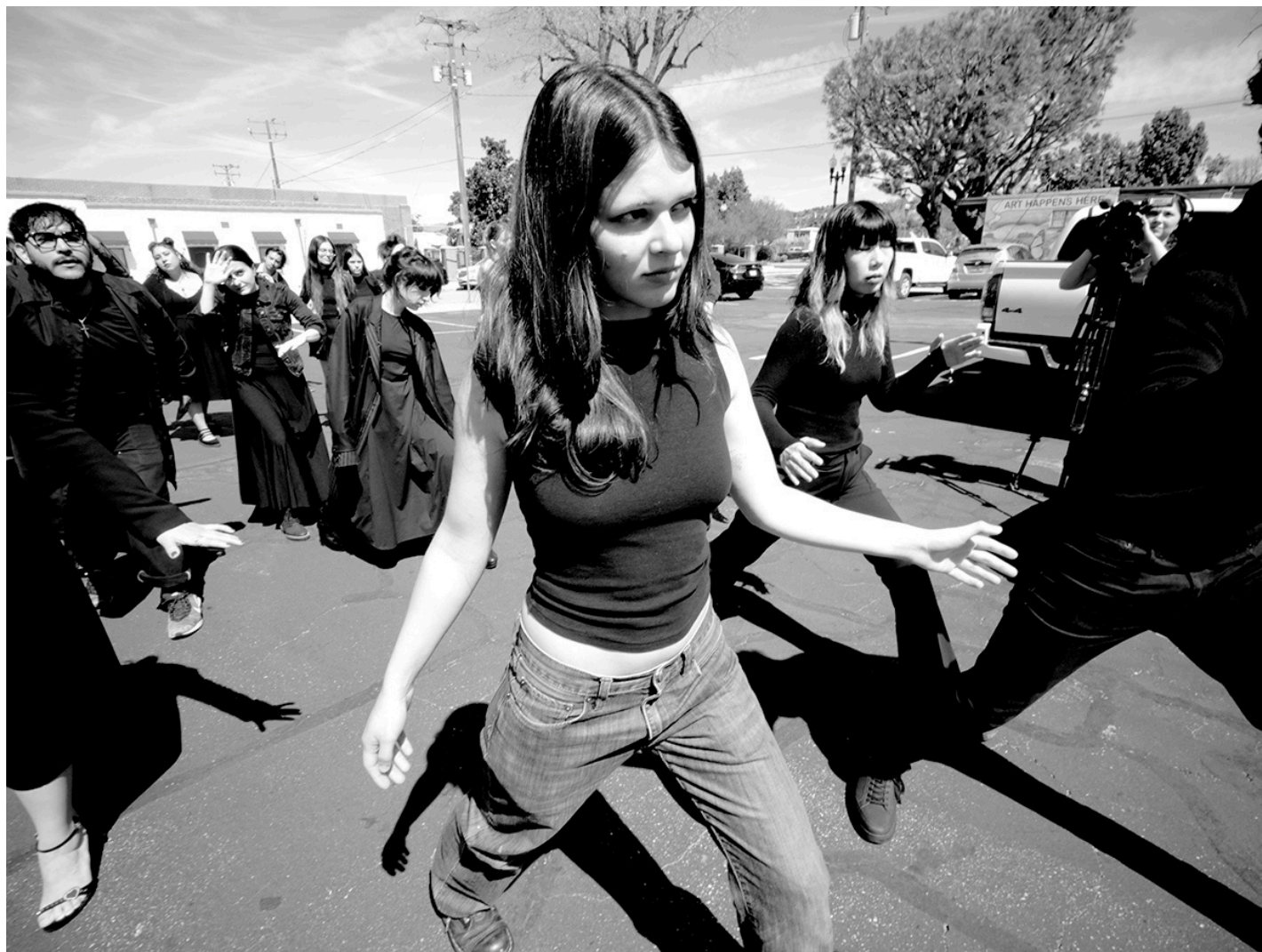
Portrait from DAWN/ECLIPSE OF A NEW ERA