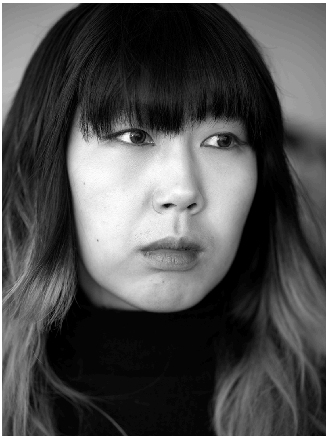
Portrait from DAWN/ECLIPSE OF A NEW ERA