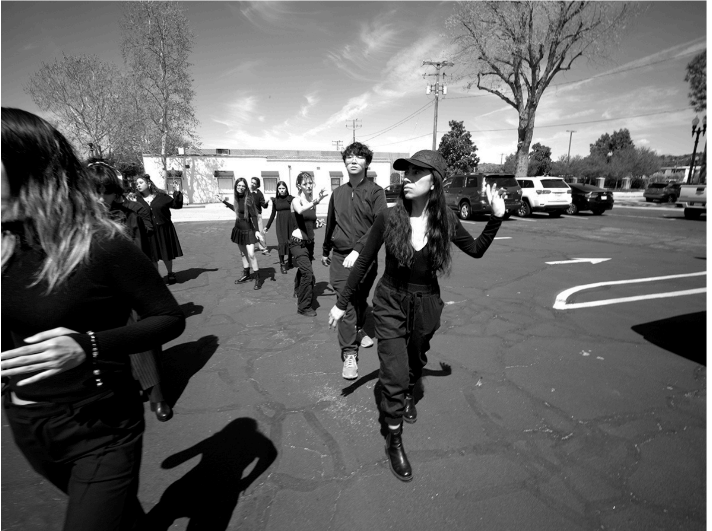
Portrait from DAWN/ECLIPSE OF A NEW ERA