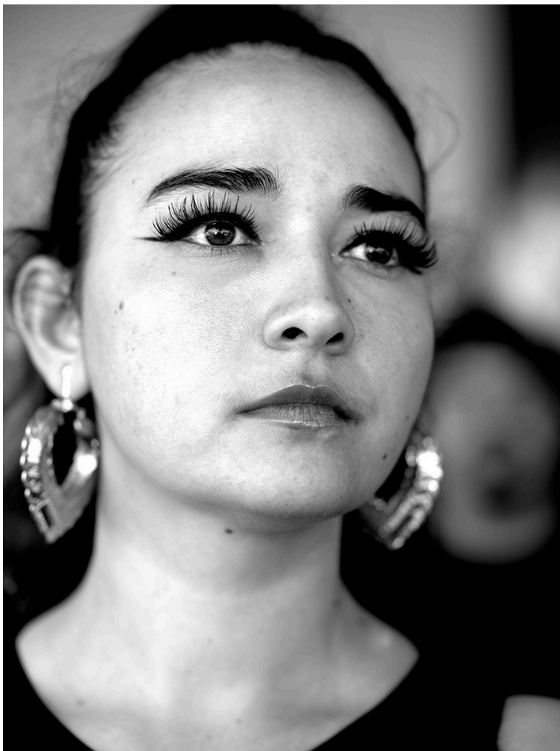
Portrait from DAWN/ECLIPSE OF A NEW ERA