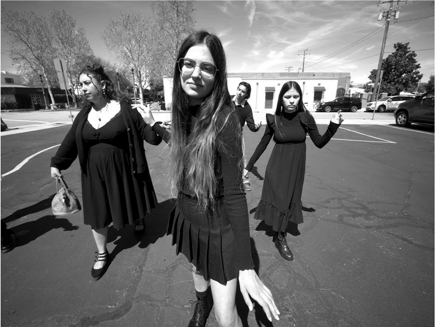
Portrait from DAWN/ECLIPSE OF A NEW ERA