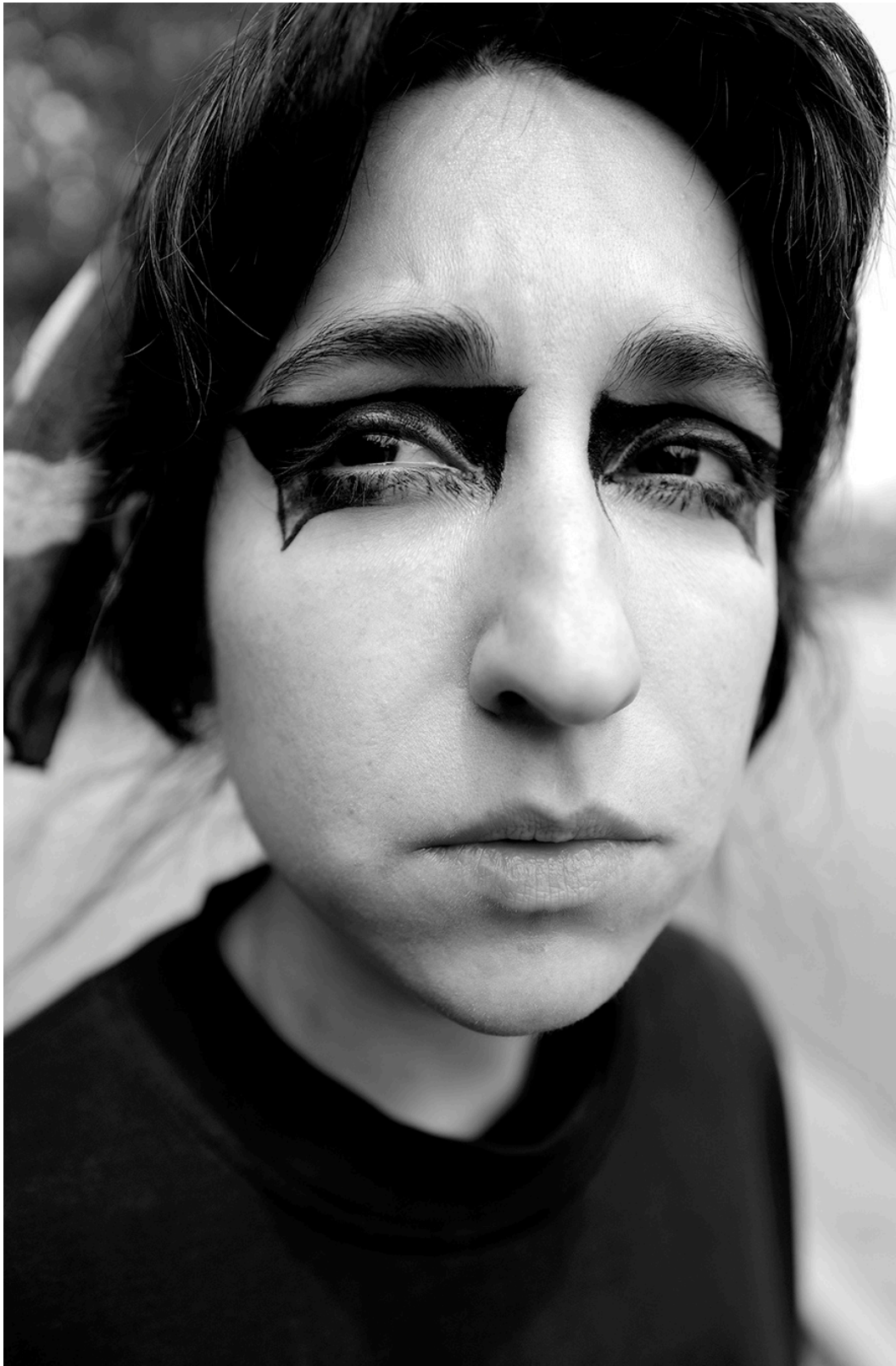
Portrait from DAWN/ECLIPSE OF A NEW ERA