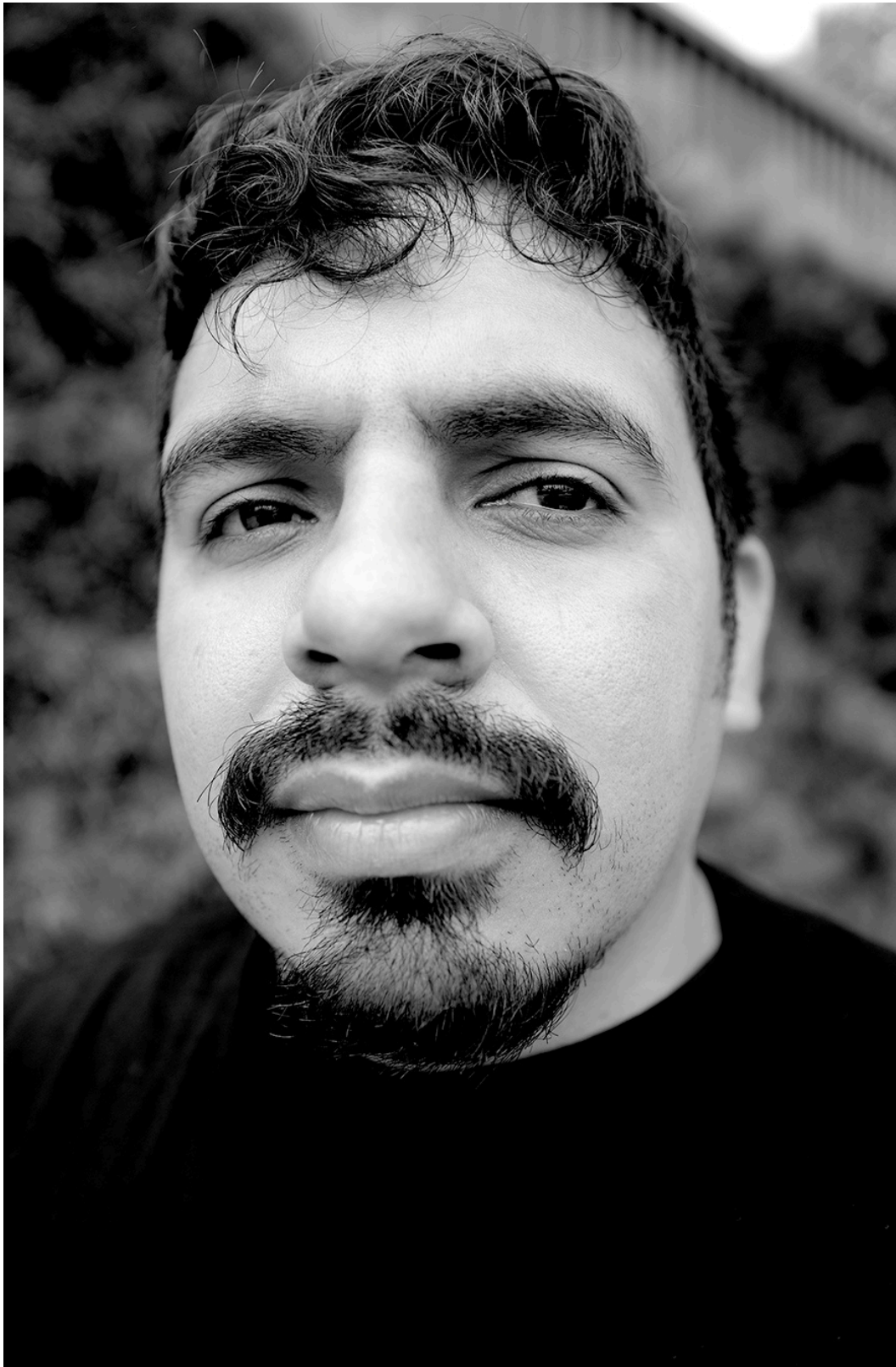
Portrait from DAWN/ECLIPSE OF A NEW ERA