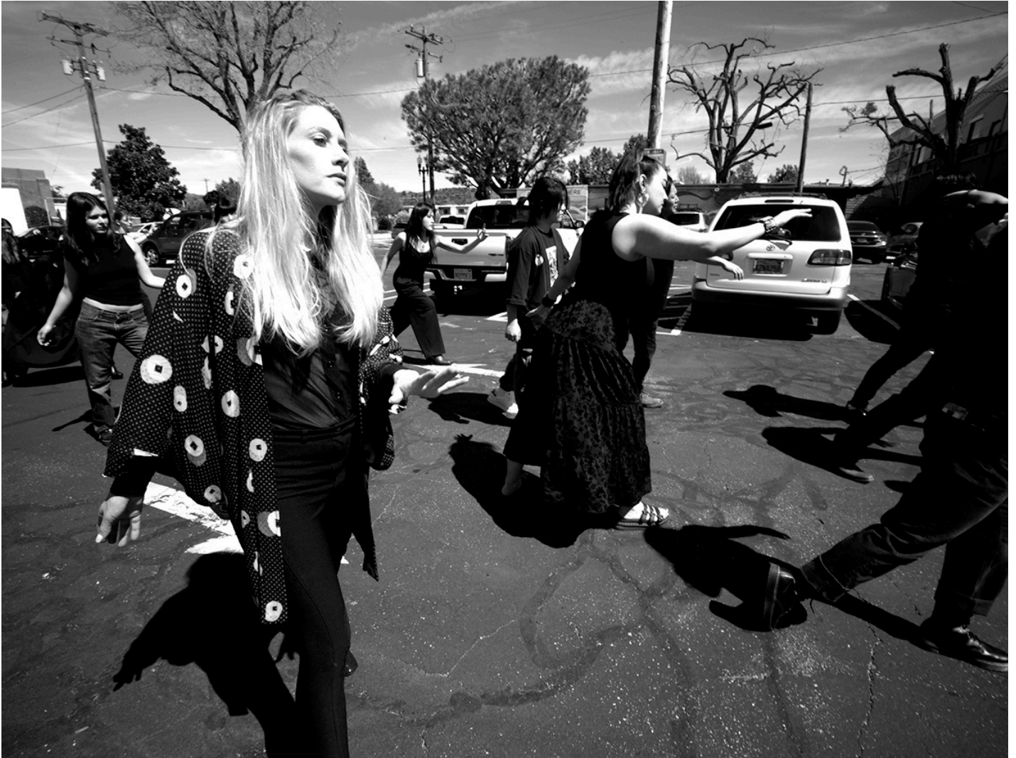
Portrait from DAWN/ECLIPSE OF A NEW ERA