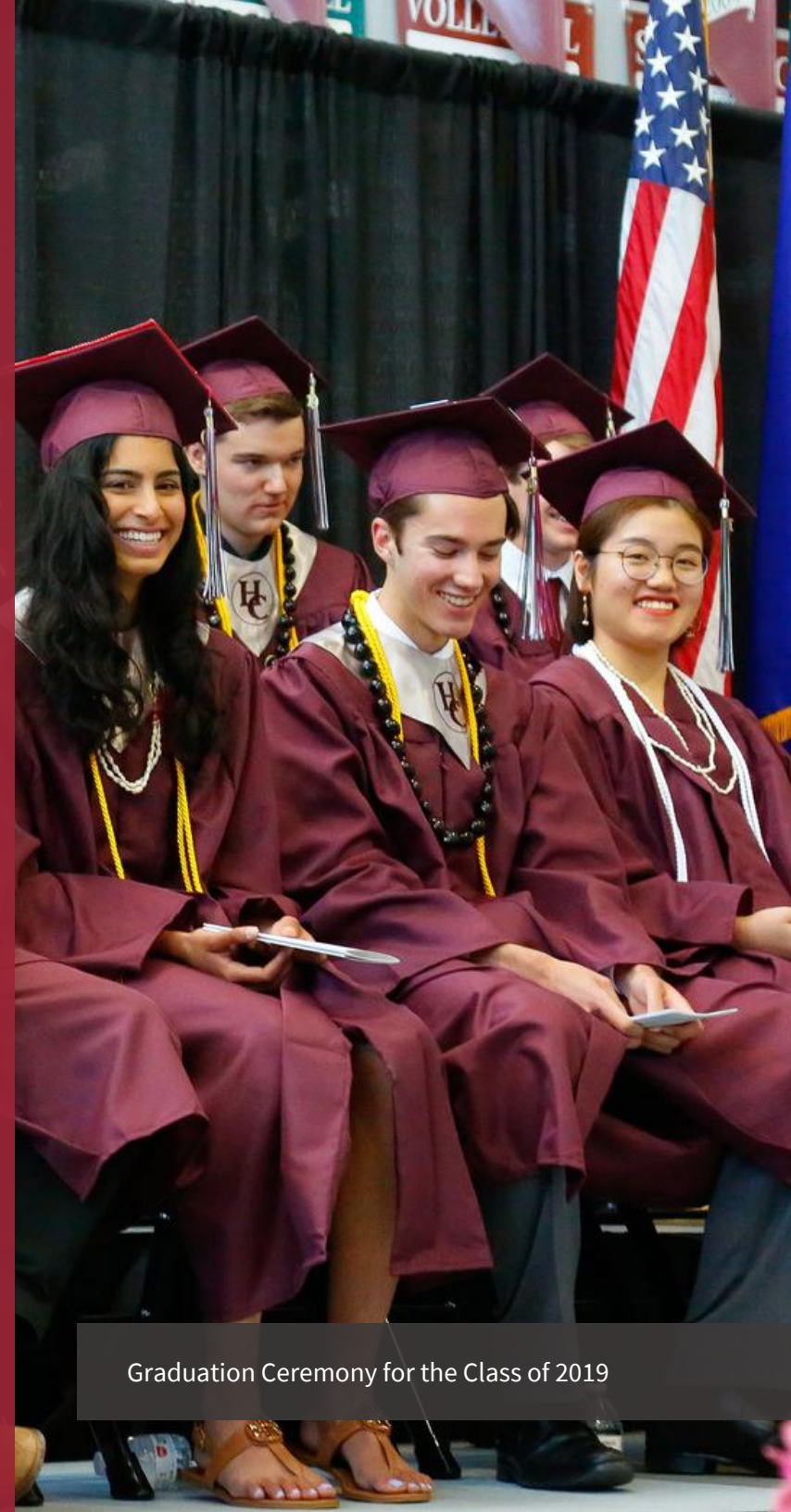
Graduation Ceremony for the Class of 2019