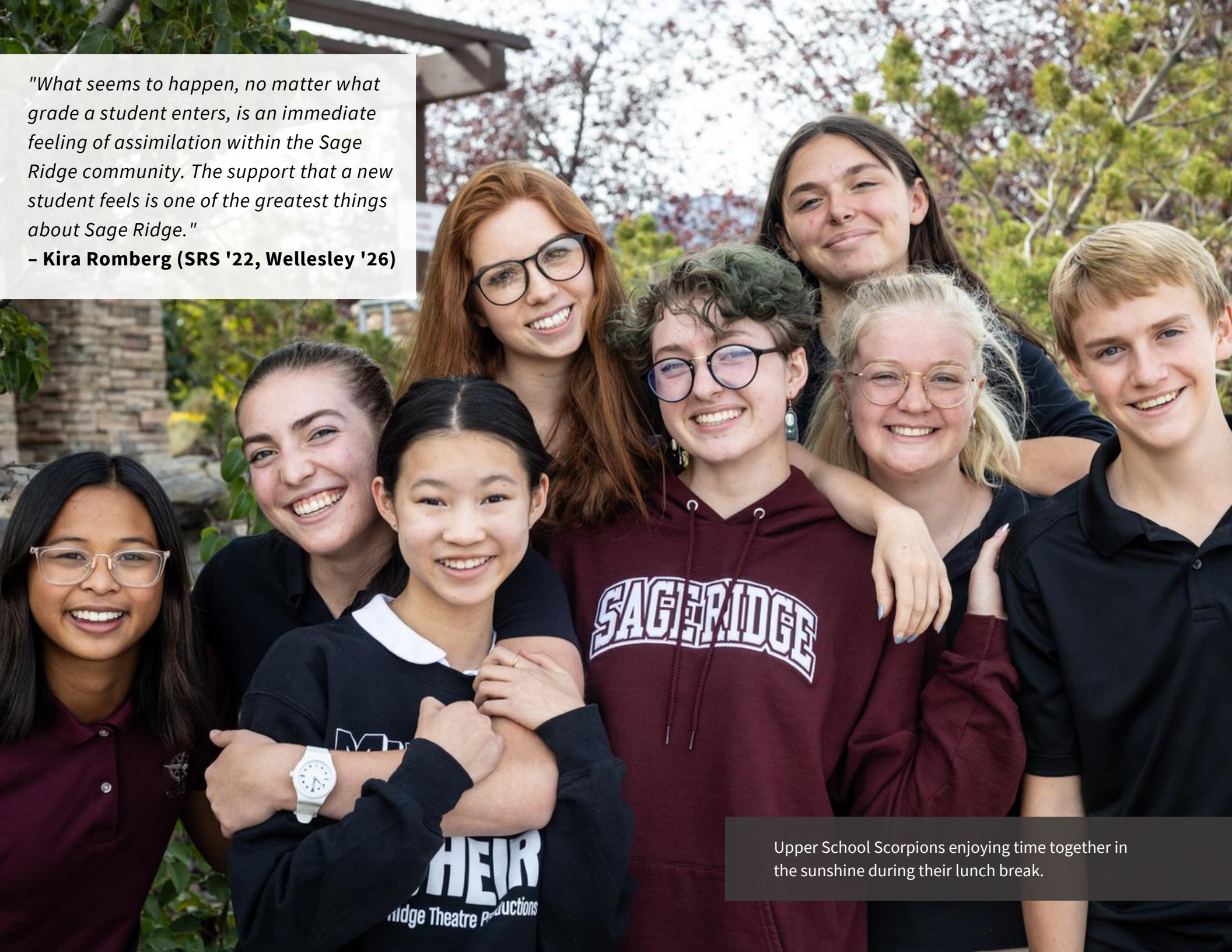
Upper School Scorpions enjoying time together in the sunshine during their lunch break.