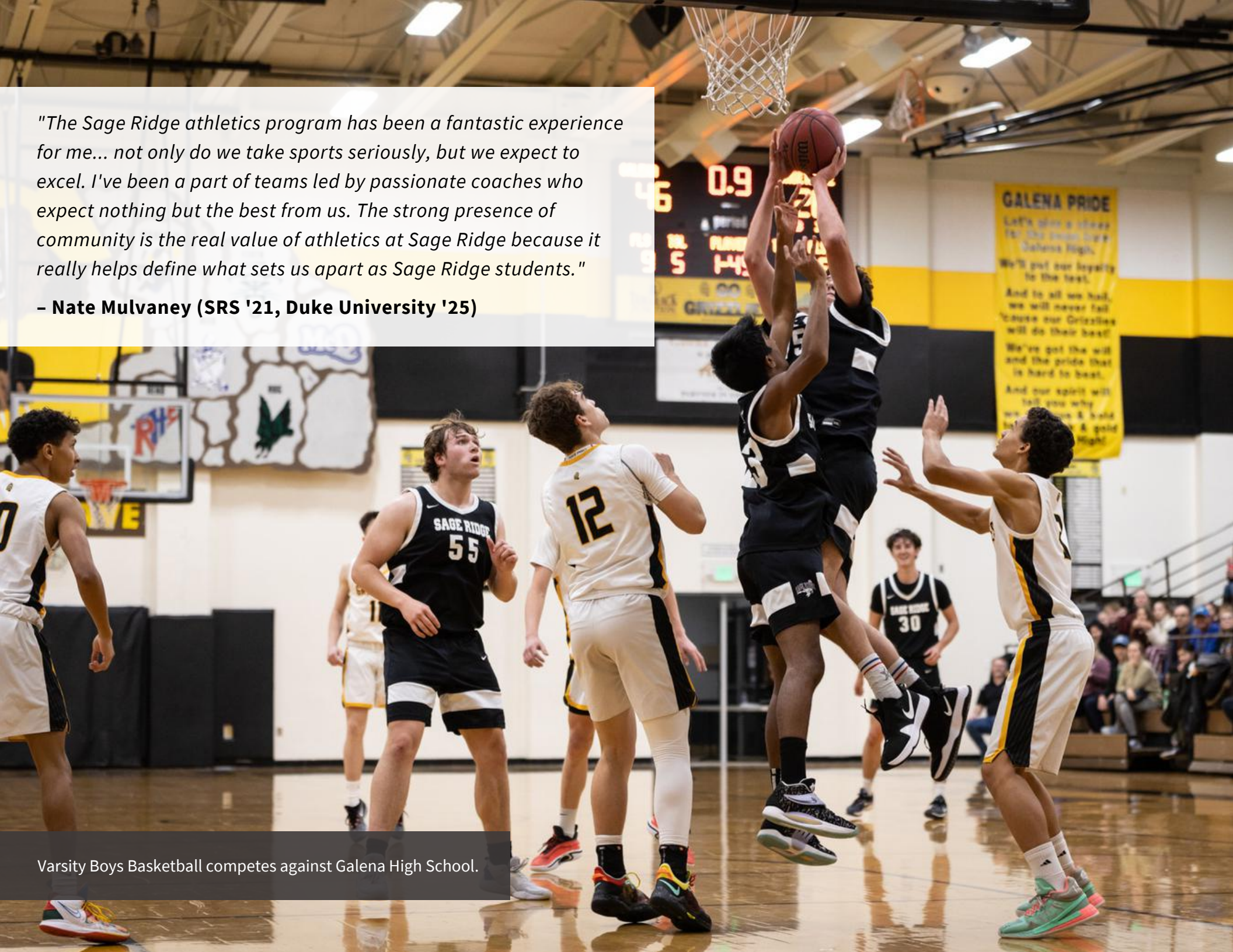
Varsity Boys Basketball competes against Galena High School.