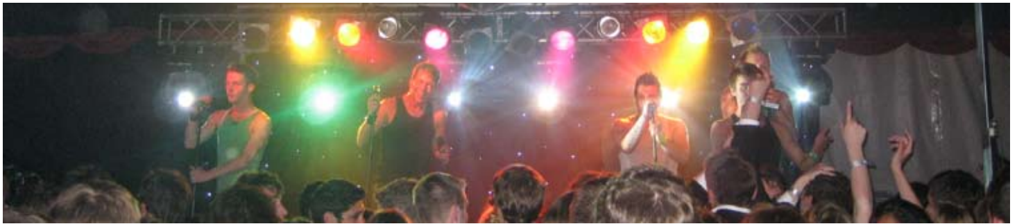
Fake That in performance