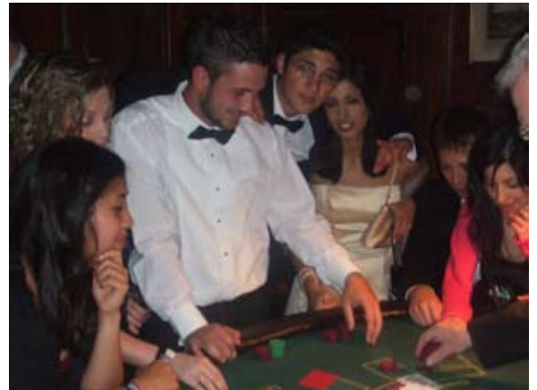
Students at the black-jack table

Pembroke's student ball was held on 11th May. For one night only, College was transformed into a recreation of the Crystal Maze. Despite the imperfect weather, all the guests thoroughly enjoyed the entertainments on offer, including the Crystal Dome, an appearance by Richard O'Brien, host of the original TV show, and a performance by Take That tribute-band Fake That.