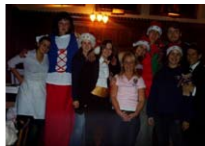
The Pantomime Cast