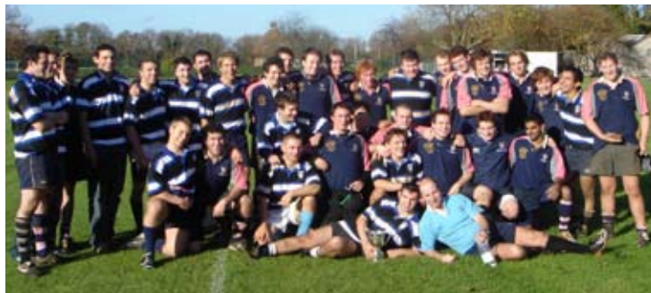
Both teams