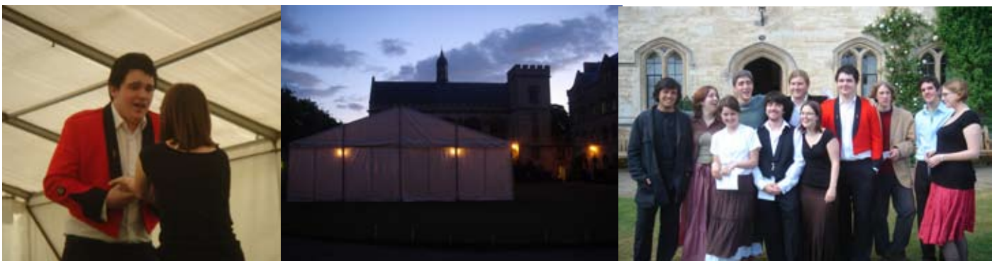
The Cast of "Translations", together and in action, with the Arts Week Marquee.

Arts Week also recruits performers from across the University as a whole and allows Pembroke students to try their hand at some of the arts. The line up included a poetry reading in the Fellows' garden, a short film expose, an art and photography competition and exhibition (held in the Emery Gallery and organised by JCR Art rep, Constance Usherwood), a performance from comedy group the Oxford Imps, a set by chart-topping Indie band "Seven Story Down", an arts workshop and strawberry picnic on the quad, gumboot dancing workshop, RnBollywood dancing, Capoeira, Salsa workshop, and an "A Cappella and Pimm's Afternoon" featuring performances from the Oxford Belles and "Out of the Blue". All of the events took place at Pembroke, most of them inside a marquee on Chapel Quad.