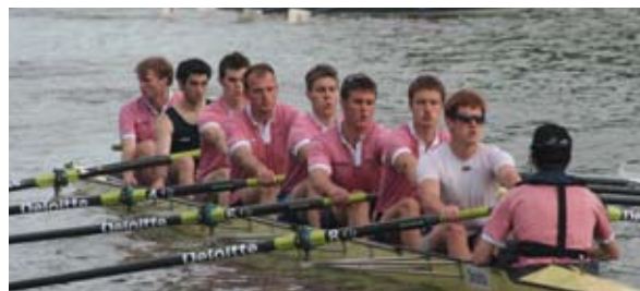
Men's 1st VIII

After an exciting and action-packed week, we are 2nd and 3rd on the river and remain the only College realistically capable of being Head of the River in both Men's and Women's rowing - despite some flagrant attempts by Christ Church to import a squad of internationals!