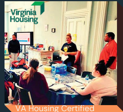
VA Housing Certified to facilitate Home Buyer Education