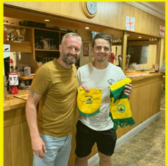
'A fantastic gesture from a fantastic club'