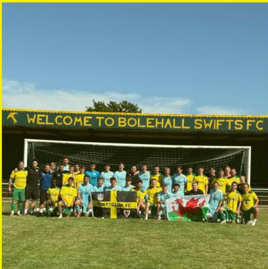
'What it's all about'