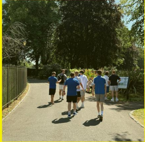
'The gaffer loves castles, it turns out'