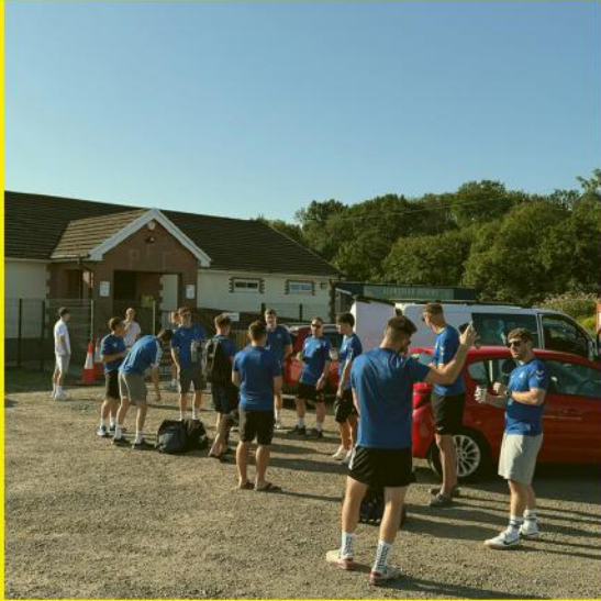
'The calm before the storm'