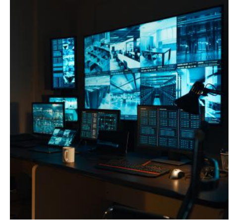
Monitoring & Control Room Equipment & Services