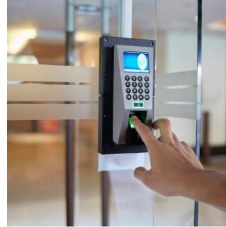
Locks, Safes & Hardware