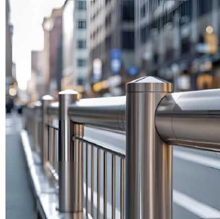
Barriers, Bollards & Perimeter Protection