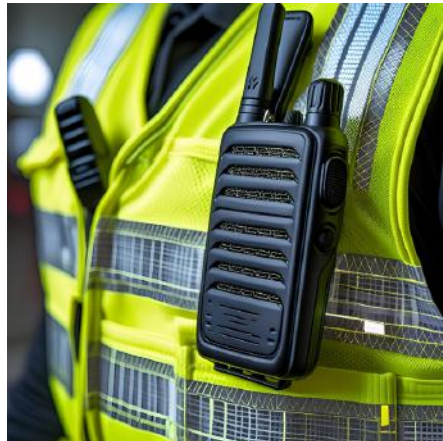
Clothing, Equipment & Personnel