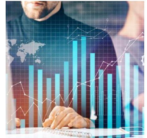
Finance and Information & Communication Technologies