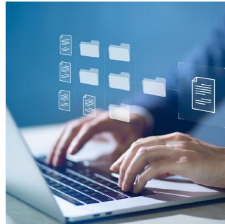
Cyber & Information Security