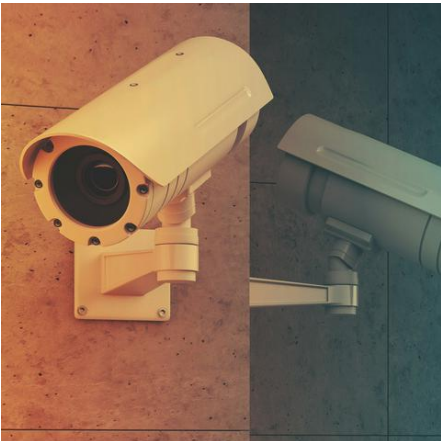
CCTV & Surveillance