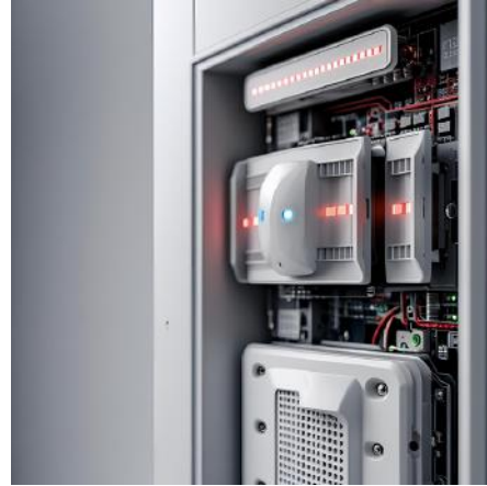
Intruder Alarms & Fire Safety