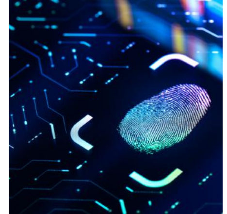
Biometrics & Identification