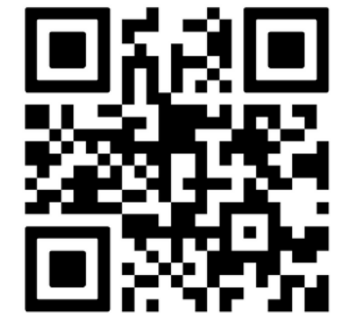
View Product Directory