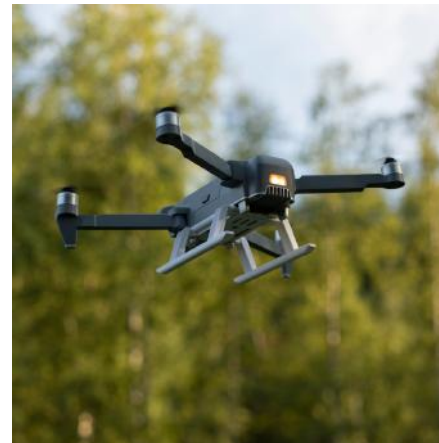
Unmanned Aerial Vehicles & Robotics