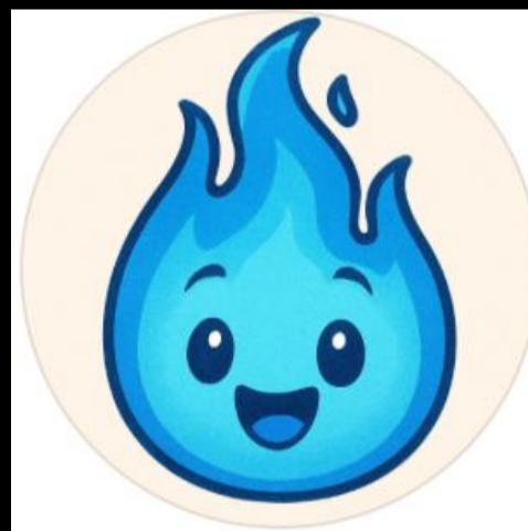
Progressive Voter Network