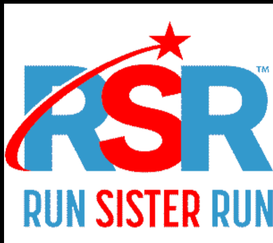
Run Sister Run Harris County