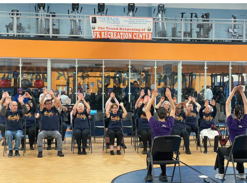
Top: AileyCamp New York, 2025. Bottom: AileyDance for Active Aging.

Additional residencies and special workshops included free Revelations Celebration Community workshops in New York City at BAM and as part of the BAAND Together Dance Festival; Boston, and Charlotte; Revelations Master Class Workshops in Atlanta and Detroit; participation in the Naples International Dance Festival in Florida; and special programming in Atlanta including the SCAD-FASH Costume and Fashion event and a screening of Portrait of Ailey .