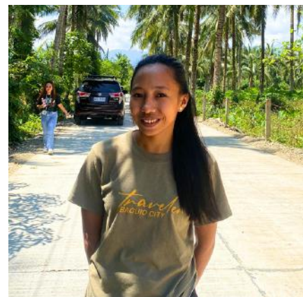
Maria Aurora – Brgy. Bagtu