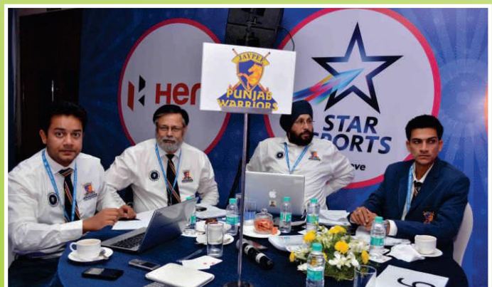
Jaypee Punjab Warriors team management during the HHIL Closed Bid