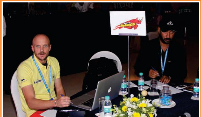
Ranchi Rhinos team management during the HHIL Closed Bid