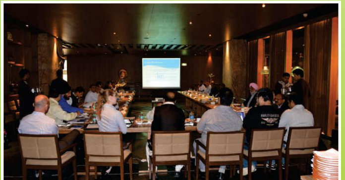
HHIL Franchise Workshop in progress