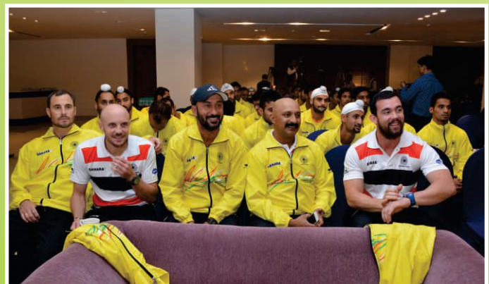
Players and Support Staff of Indian Junior Men Hockey Team during team announcement event.