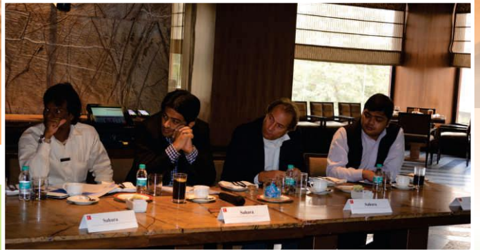
Uttar Pradesh Wizards team management during the HHIL Franchise Workshop