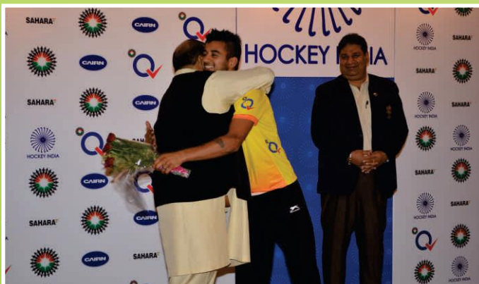
Dr. Narinder Batra, Secretary General Hockey India wishing good luck to Captain Manpreet Singh