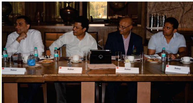
Dabur Mumbai Magicians team management during the HHIL Franchise Workshop