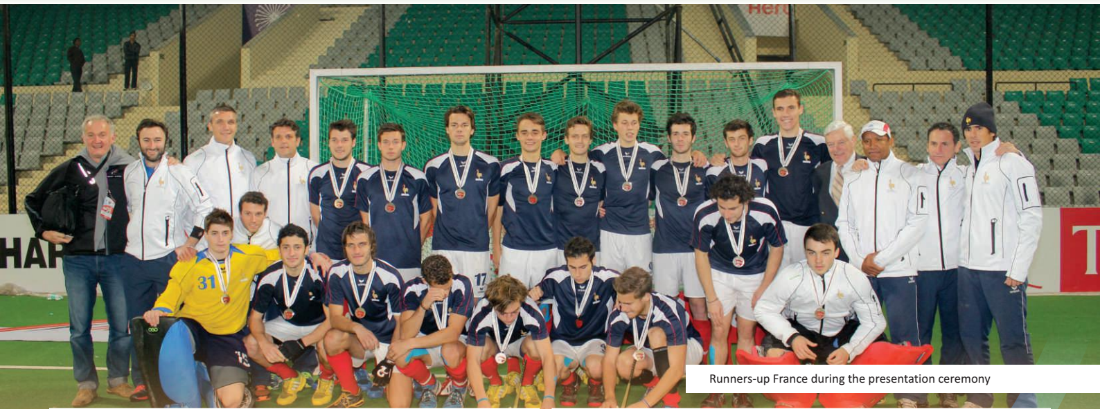
Runners-up France during the presentation ceremony