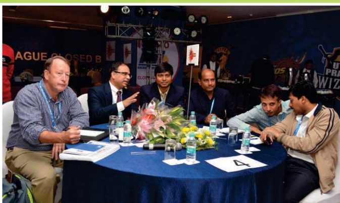
Kalinga Lancers team management during the HHIL Closed Bid