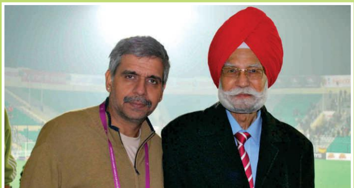
Mr. Sandeep Dikshit, Member Parliament Lok Sabha with Olympian Mr. Balbir Singh Senior