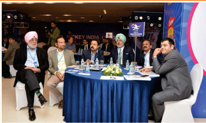
Delhi Waveriders team management during the HHIL Closed Bid