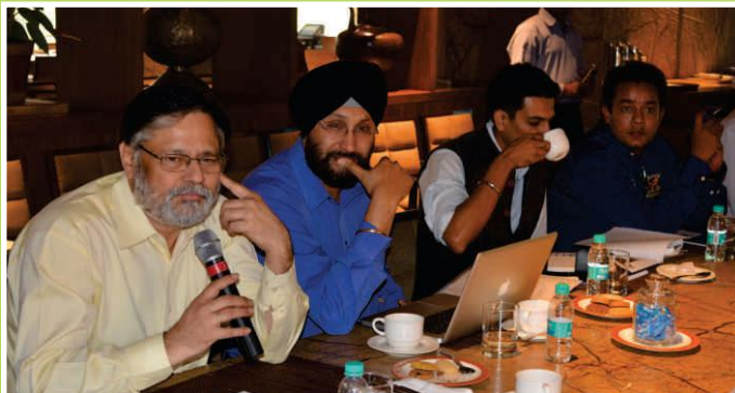
Japyeer Punjab Warriors team management during the HHIL Franchise Workshop