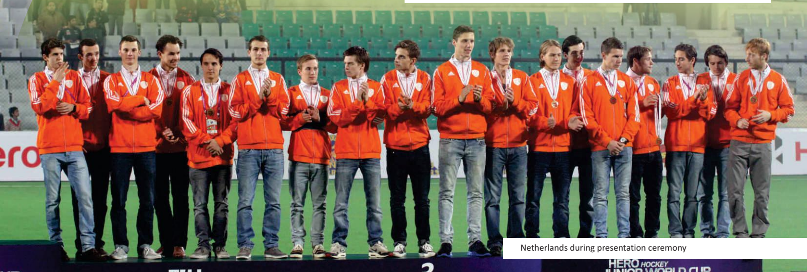
Netherlands during presentation ceremony