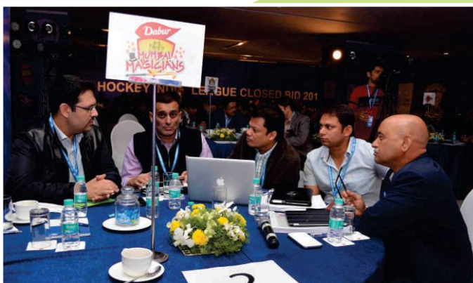
Dabur Mumbai Magicians team management during the HHIL Closed Bid