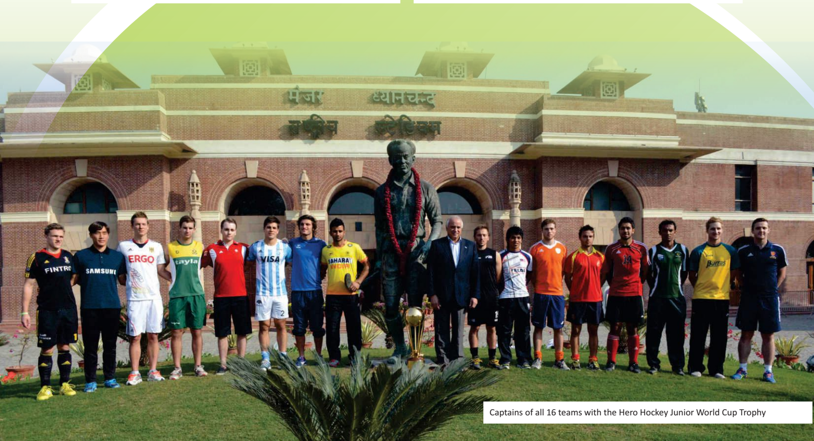
Captains of all 16 teams with the Hero Hockey Junior World Cup Trophy