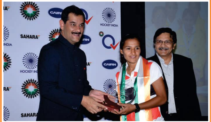
Mr. Jitendra Singh, Minister of State for Youth Affairs and Sports (Independent Charge) presenting a memento to Rani for completing 100 international caps