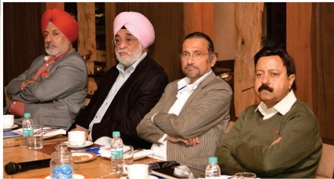
Delhi Waveriders team management during the HHIL Franchise Workshop