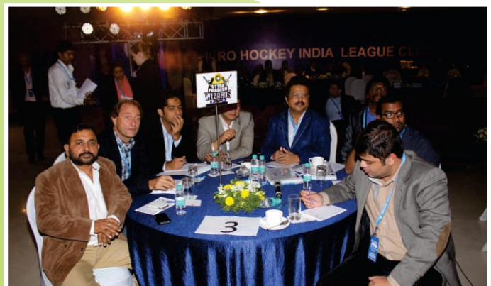
Uttar Pradesh Wizards team management during the HHIL Closed Bid