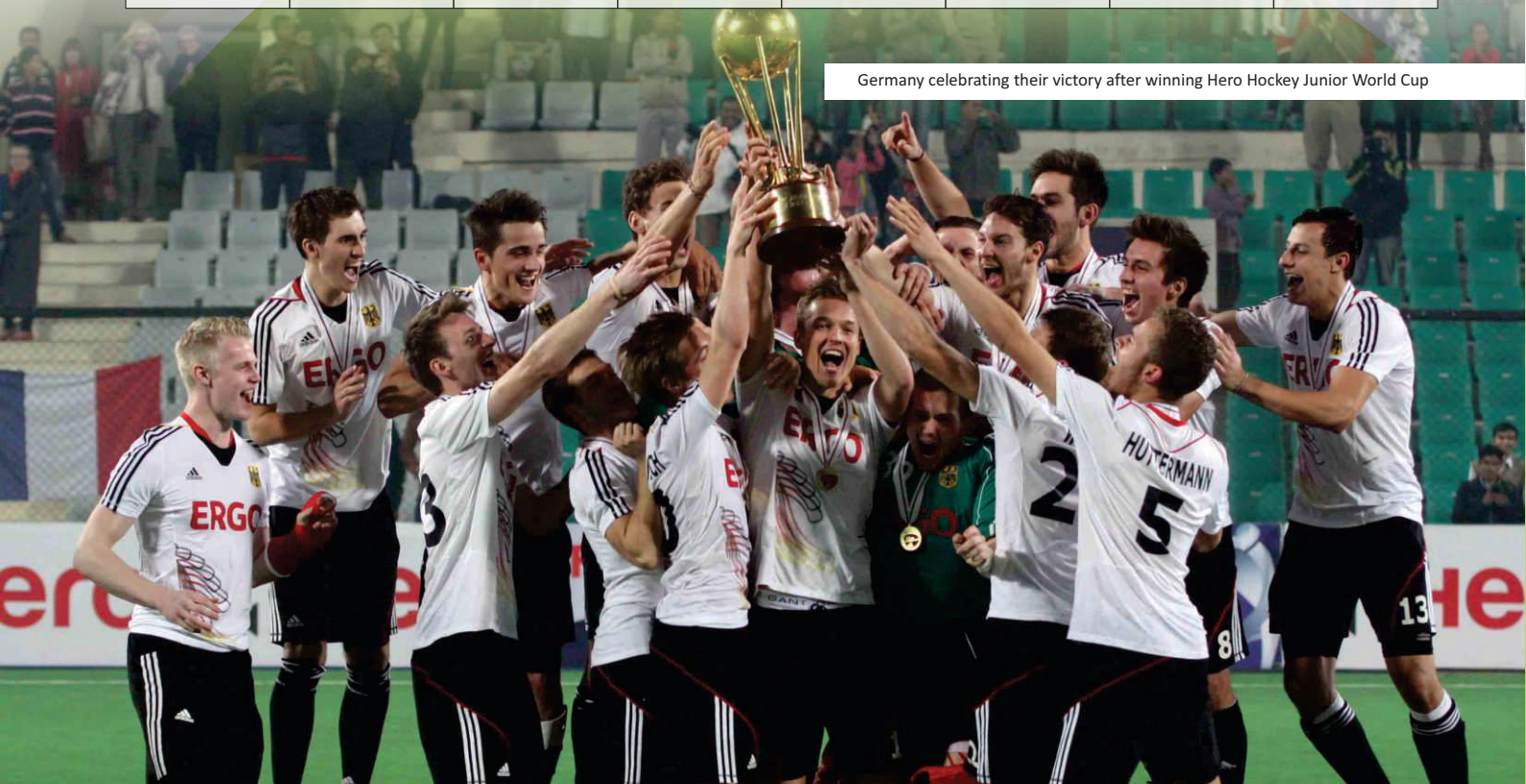
Germany celebrating their victory after winning Hero Hockey Junior World Cup