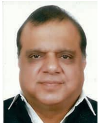
Message from Dr. Narinder Batra, Secretary General - Hockey India & Chairman-Hero Hockey India League

I would like to convey my sincere thanks to International Hockey Federation (FIH) for reposing their faith in us to host the Senior Men Hockey World Cup in 2018 and awarding many other major events during the period 2015-2018.