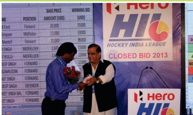
Dr. Narinder Batra, Chairman Hero HIL presenting flower bunch to Mr. Dhanraj Pillay, Technical Director Uttar Pradesh Wizards