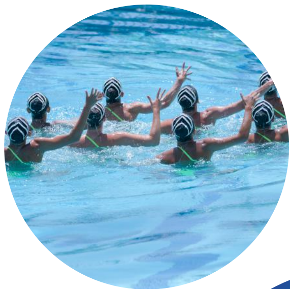
USA Artistic Swimming

Aquatics also implemented WatchTower, a new web-based reporting software platform that allows lake and pool lifeguards to track daily activity, local park trends, rescues and incidents in real time. Improved reporting will better inform programming and operations.