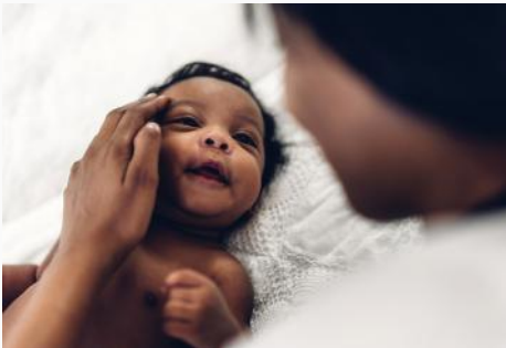
Postpartum & Infant Care