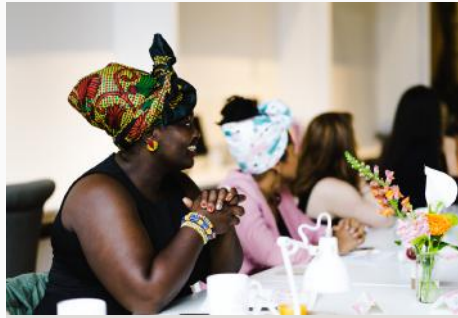
Community Advocacy & Education