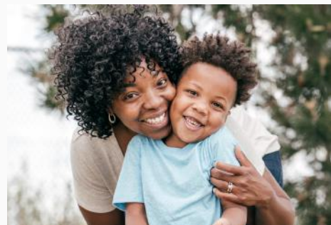
Parenting & Life Skills Development