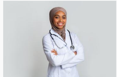
Cultural Competency & Health Equity