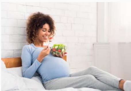
Nutrition & Wellness