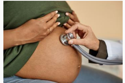
Prenatal Care & Medical Services