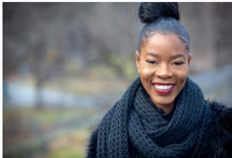
Financial & Emergency Assistance