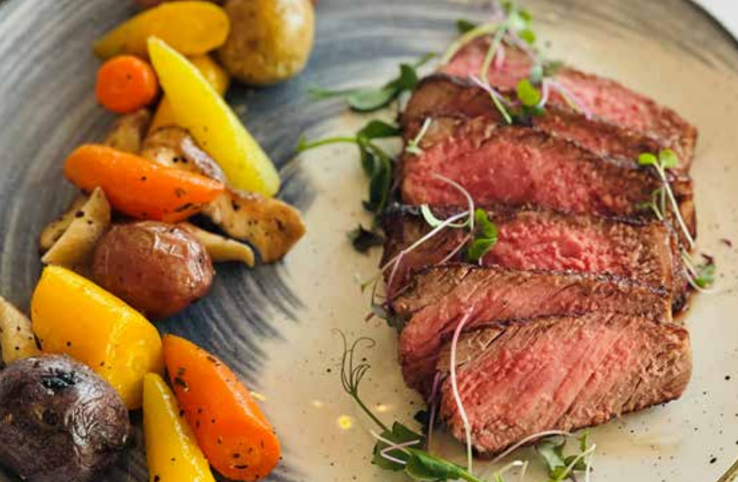
NEW YORK STRIP WITH SEASONAL VEGETABLES