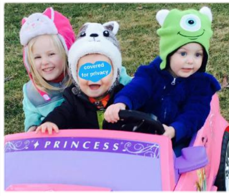
* Foster child's face has been covered for his privacy.

9-1/2 months ago, I put my kids to bed, hopped in the car and drove to pick up a 3-week-old baby boy with a semi-scary medical past. I found out just the day before that he needed a home for about 30 days. We didn't even have our foster license yet. Things obviously took a little turn. He has been hard. He's cool now, we're good, and I'm totally crazy about him. I hear very often, "I could never do it. Won't it be hard if you have to give him back?" You underestimate yourself. You can do it. It will be mega-hard to watch him go if/when that day comes. Seeing my kids lose a little brother will be harder. Not knowing how his transition home and home-life in general will be the hardest.