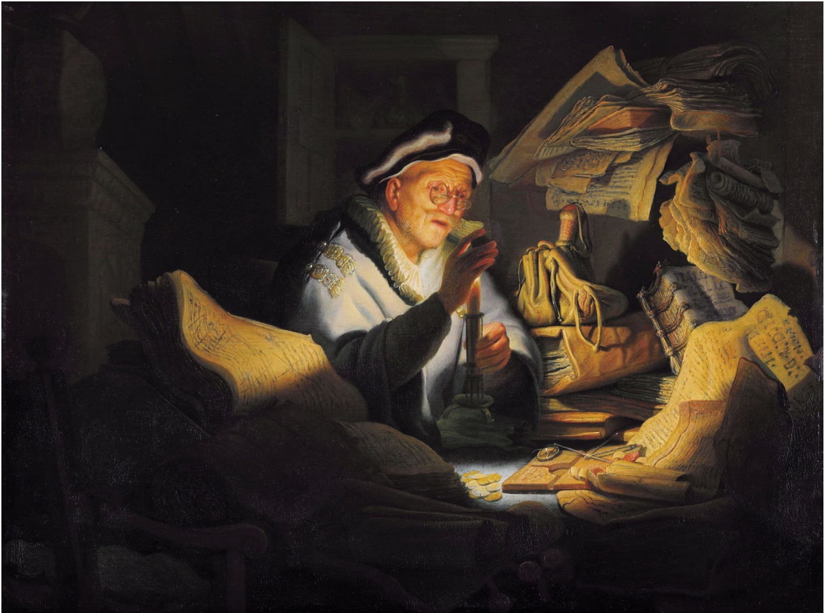
The Parable of the Rich Fool (1627 AD) Rembrandt van Rijn (1606–1669 AD)

Rembrandt lived in the Dutch golden age—an age of exceptional wealth acquired through burgeoning global trade. In a critique of his contemporaries, he shows a well-dressed man surrounded by his account books, counting his money late into the night—not knowing that this night will be his last, and that he can't take it with him.