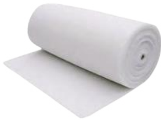
Pre-Filter G3 or G4