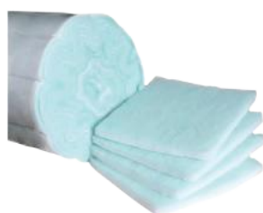
Progressive Fiber Filter