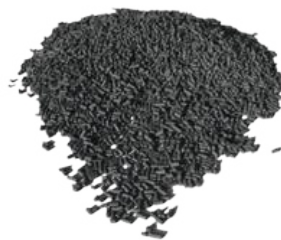
Activated Carbon Filter