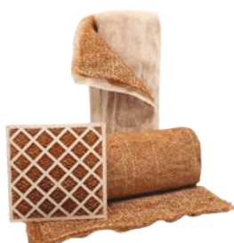
Multilayer Paper - Honeycomb