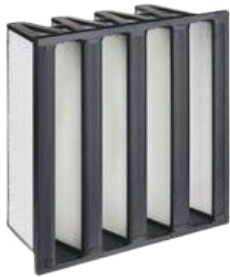
Multi-Diagonal compact Filters - Rigid Pocket