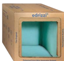
Edrizzi Cube in Cube