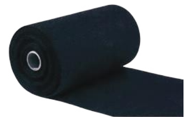
Roll of Activated Carbon Filter