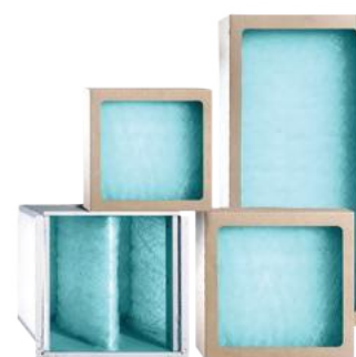
Edrizzi Secondary filter