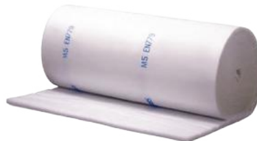
Roll of Ceiling Filter M5 (Plenum)