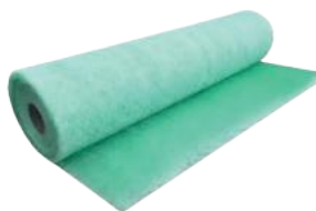
Fiberglass - Paintstop