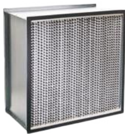
Absolute Filter EPA HEPA ULPA