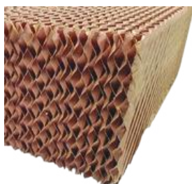
Evaporative Cooling Pad