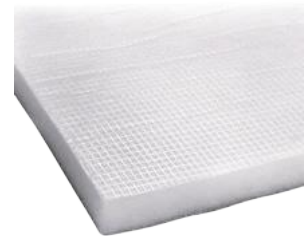
Cut out Ceiling Filter M5 (Plenum)