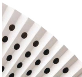
Concertina Filter - Pleated Cardboard Filter - White