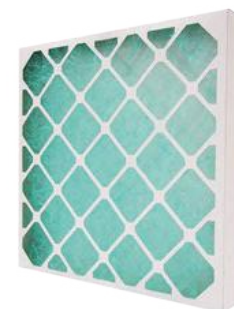
Fiberglass - Cardboard Frame