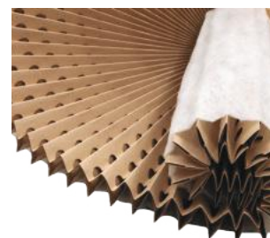
Concertina Filter - Pleated Cardboard Filter with Media