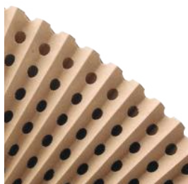
Concertina Filter - Pleated Cardboard Filter - Brown