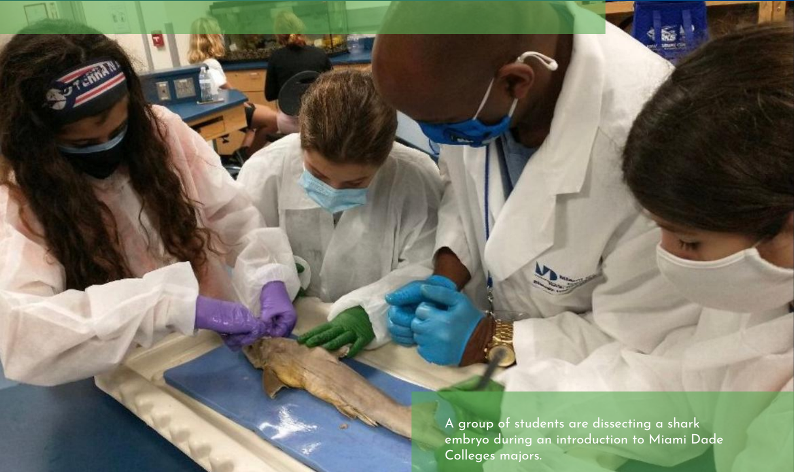
A group of students are dissecting a shark embryo during an introduction to Miami Dade Colleges majors.

If our model sounds like a fit for your family, let's explore further.