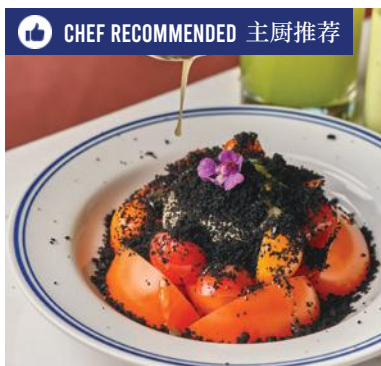
TOMATO SALAD 380 番茄沙拉 Mix heirloom tomatoes, Stracciatella cheese, cucumber gazpacho, honey lemon dressing and black olives 混合原种番茄，布拉塔芝士，黄瓜西班牙凉菜汤，蜂蜜柠檬酱和黑橄榄