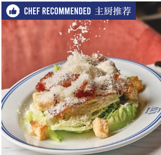
BABY ROMAINE CAESAR SALAD 320 婴儿长叶莴苣凯撒沙拉

Baby cos lettuce, bacon, croutons, onsen egg, and parmesan cheese 嫩罗马生菜、培根、面包丁、温泉蛋和帕玛森奶酪