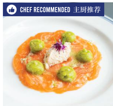
CURED SALMON 620 腌三文鱼 Avocado guacamole, crab and cucumber dressing 牛油果酱，蟹肉和黄瓜