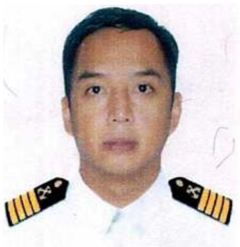
COFF ORBILLE SICAD AQUASALWADOR