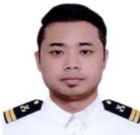
AB GERALD KIER RAGOS STAR APHRODITE