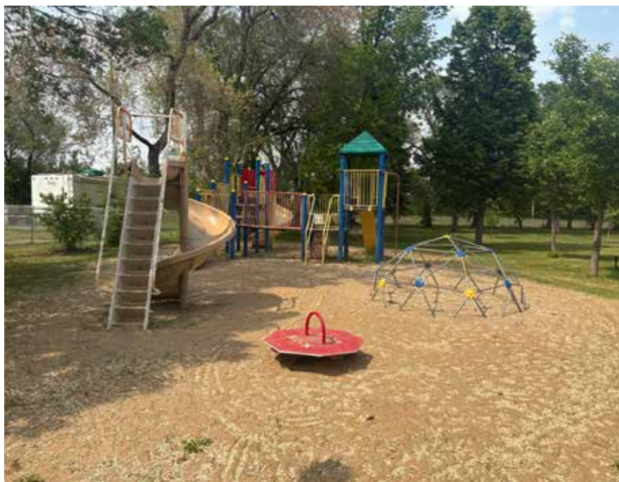
A three-year capital playground renewal program, starting in 2025, lists the McKay Avenue Park rebuild/renewal as one of the first projects identified as a priority.

When the City of Portage la Prairie began looking at revitalizing local playgrounds, they knew they'd need some help from consultants. And in planning the McKay Avenue Playground, they got feedback from a one-of-a-kind group with a special interest in the project.