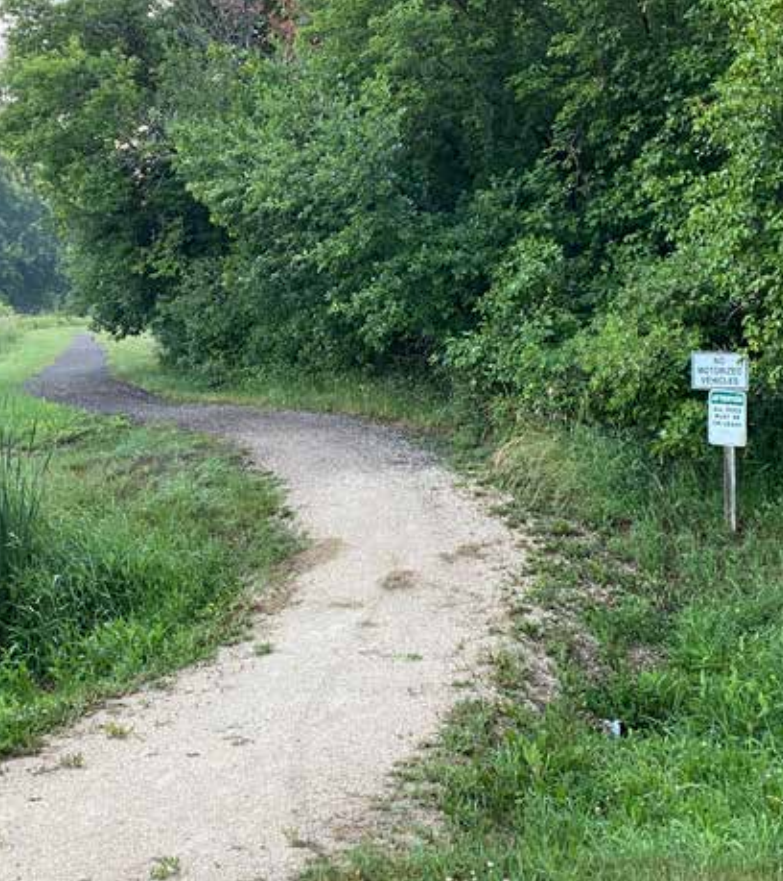
Construction is set to begin this fall on the Garrioch Creek Trail.