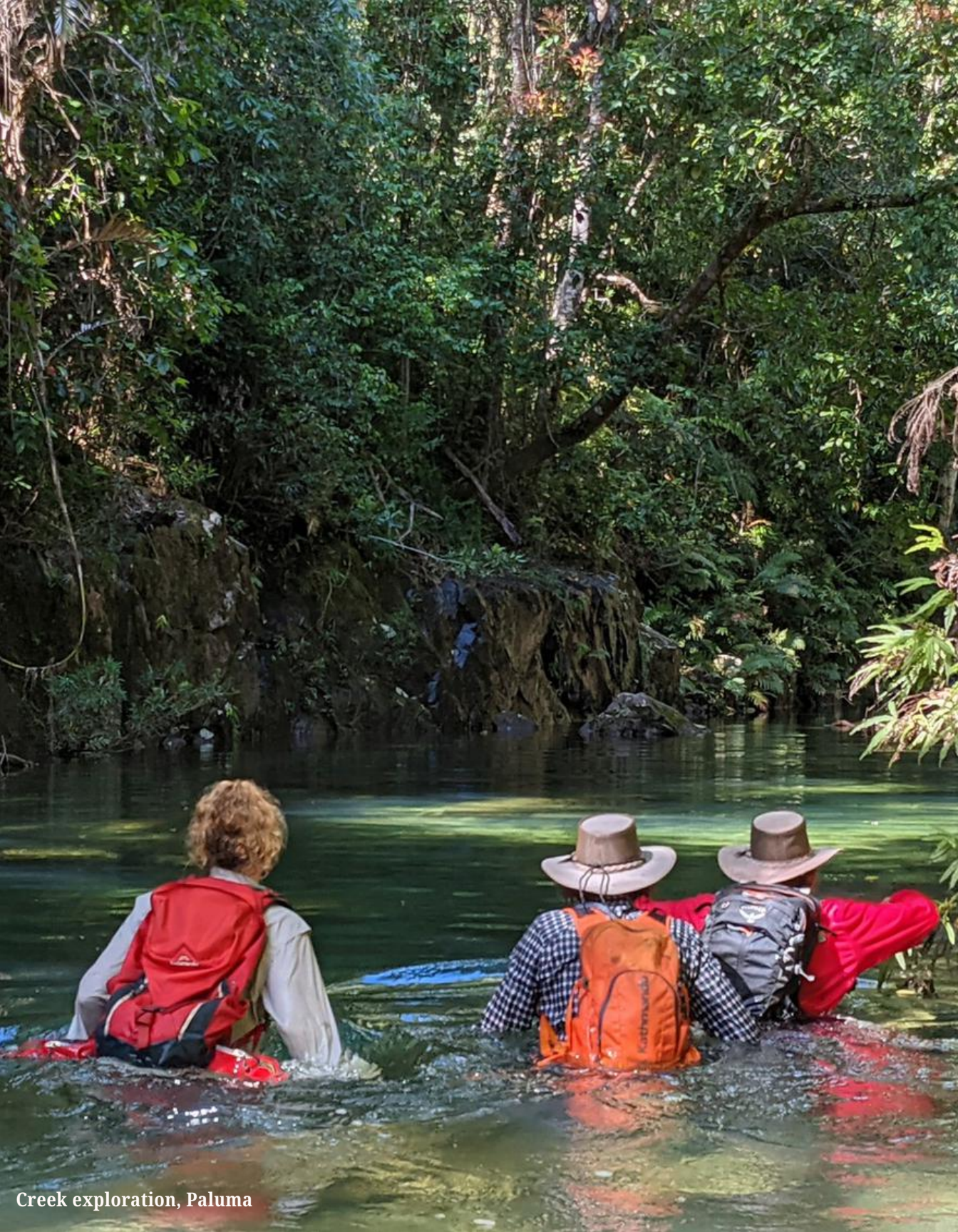
Creek exploration, Paluma