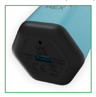
Be Rechargeable It must have a charging port.

What Makes a Vape Compliant? To be legal from 1st June 2025, a vape must: