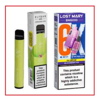
Single-use vapes no charging, no refilling, no coil changes