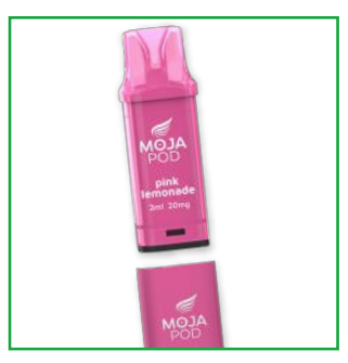
Have Replacement Coils The e-liquid can be topped up Coils must be available to buy & easy to replace. On its own or integrated in a prefilled replacement pod.