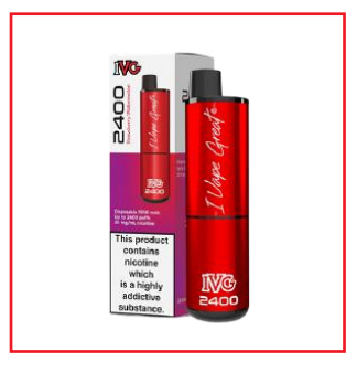
Non-rechargeable pod kits