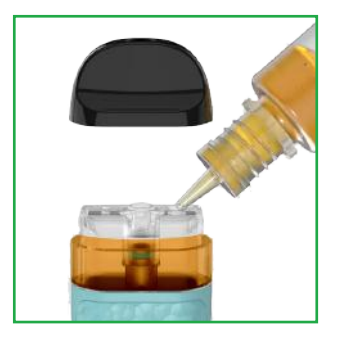
Be Refillable or changed using pods or bottles.