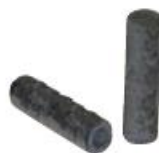
MonoTrap RGPS TD

Product name: MonoTrap RGPS TD Cat.No.:1050-74202