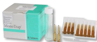
MonoTrap Trial Kit for TD

GL Sciences disclaims any and all responsibility for any injury or damage which may be caused by this data directly or indirectly. We reserve the right to amend this information or data at any time and without any prior announcement.