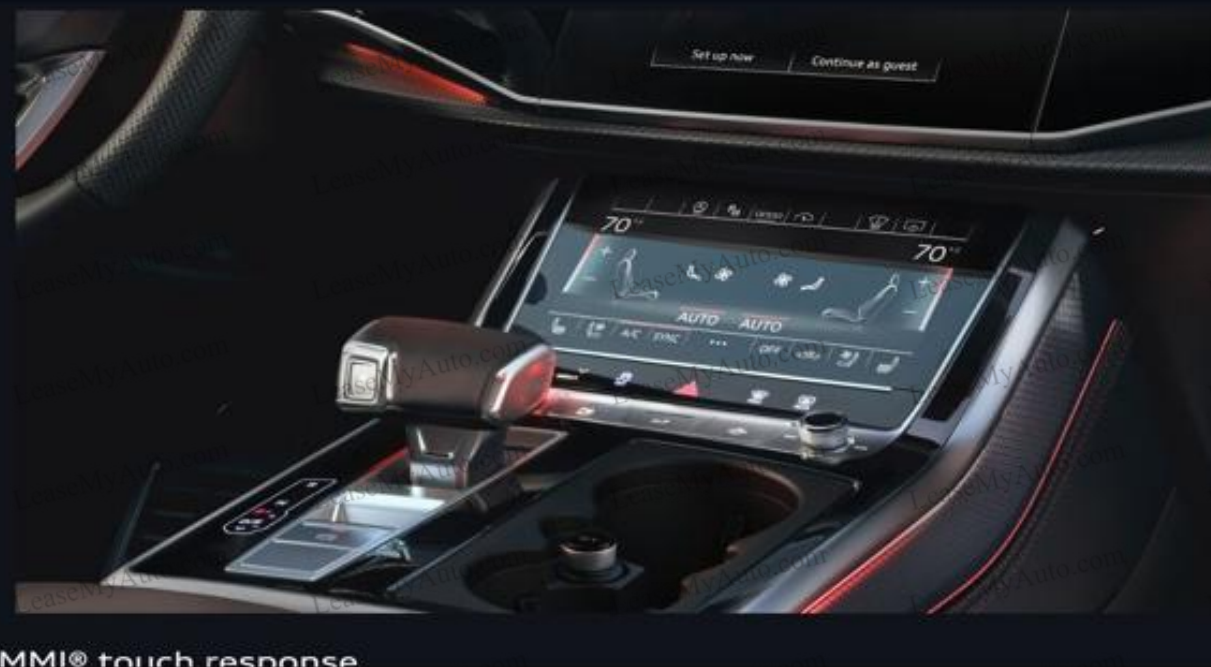
MMI® touch response