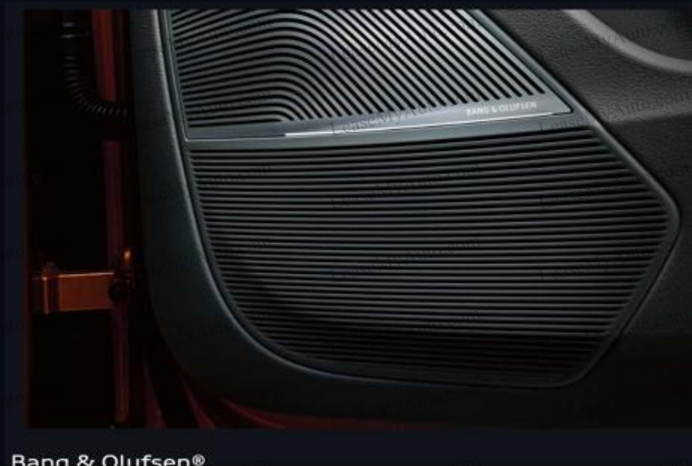
Bang & Olufsen®