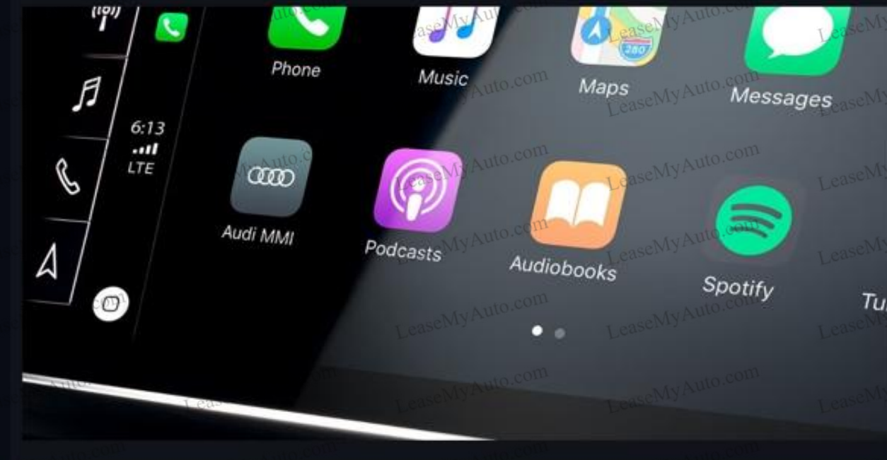
Wireless Apple CarPlay