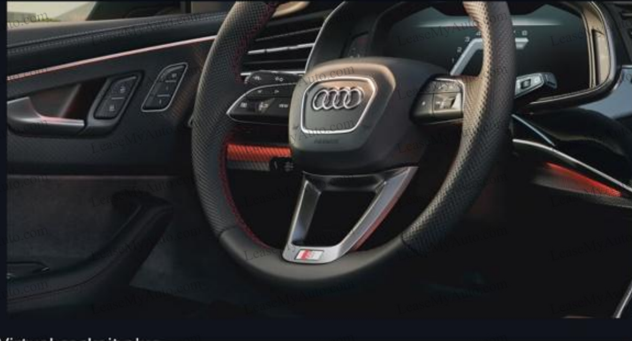
Virtual Cockpit Plus