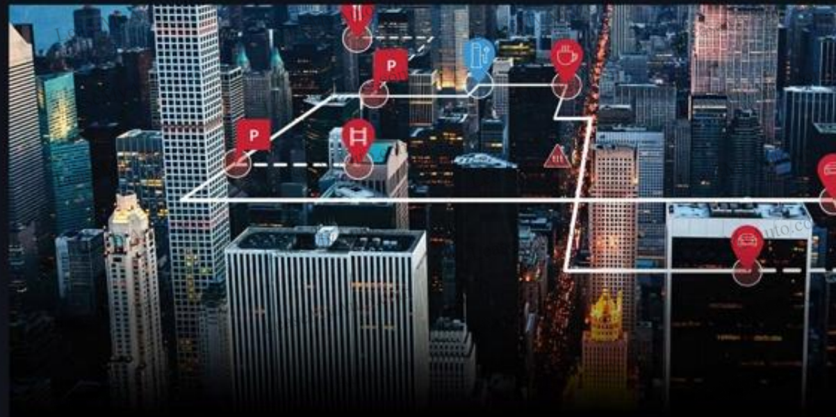
Audi connect CARE® with remote start *