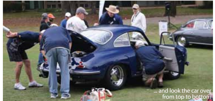
... and look the car over from top to bottom

bug swarms while driving up 95, just to try to keep the car a bit cleaner. Once there I wasn't rushing to clean the car, I just had to find the Corral parking and leave it. Wow, this was shaping up to be a fun event.