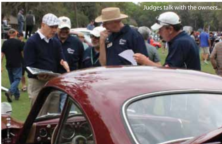
Judges talk with the owners...

Walking from the Corral parking to Judged parking, we watched the beautiful cars rolling by the sand traps onto #2 fairway to take their spot and owners of already parked cars cleaning and primping at their designated places. At the judges meeting my mindset was this is serious business. My analytical mind wanted to understand all the criteria involved to make a fair assessment. After all, there is some tradition to uphold, right? After a quick hello and brief explanation, we were told to go have fun! But wait, there were questions from both new and experienced judges. The extent of how different the paradigm was to be, sunk in when we were assigned classes. For example, I sent in my qualification letter stating I had owned 951, 964, 996, 981, and 991 series cars so I would be very comfortable judging them. At the end of the judges meeting, the class I drew? 356! Well, I've never even ridden in a 356. Yes, this will be a starting from a blank sheet!