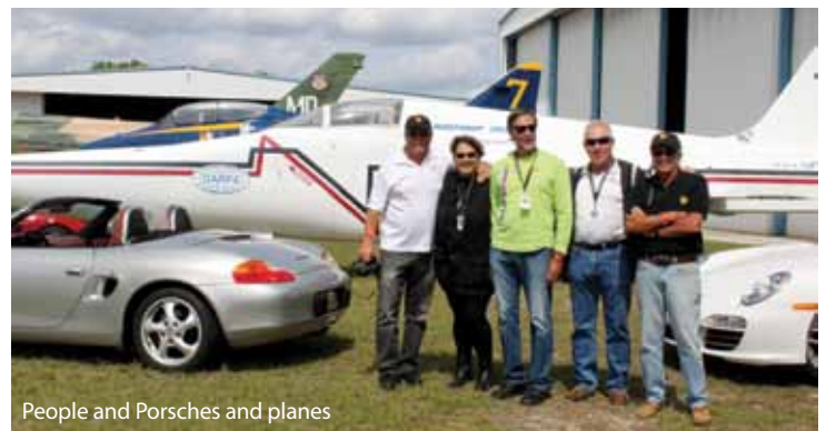
People and Porsches and planes