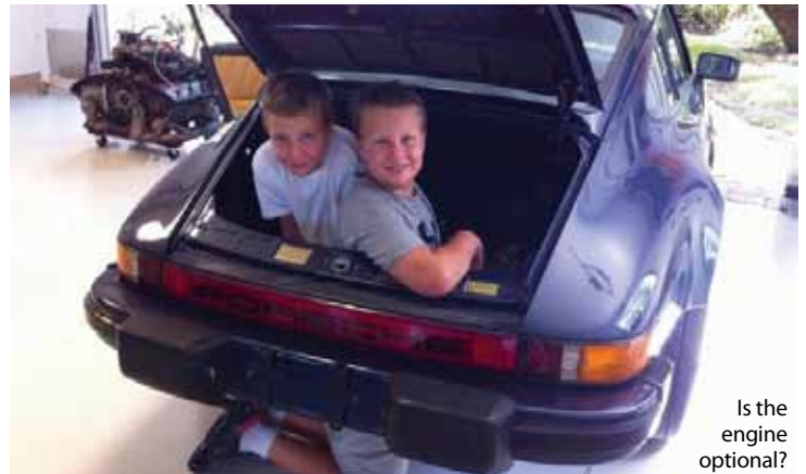
Is the engine optional?