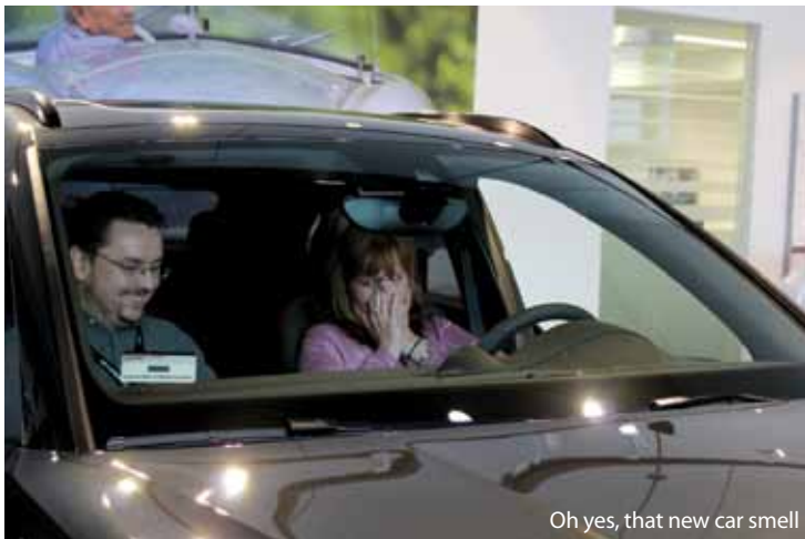
Oh yes, that new car smell

After our tour, we walked into a special section downstairs that is just for deliveries. It's like a lounge at a very nice hotel but with your Porsche waiting for you. Once we got some paperwork done we moved into the delivery room where two covered cars were waiting. Again, an amazing room with a sitting area with chocolates and fruit waiting for us. They really know how to make you feel like a VIP!