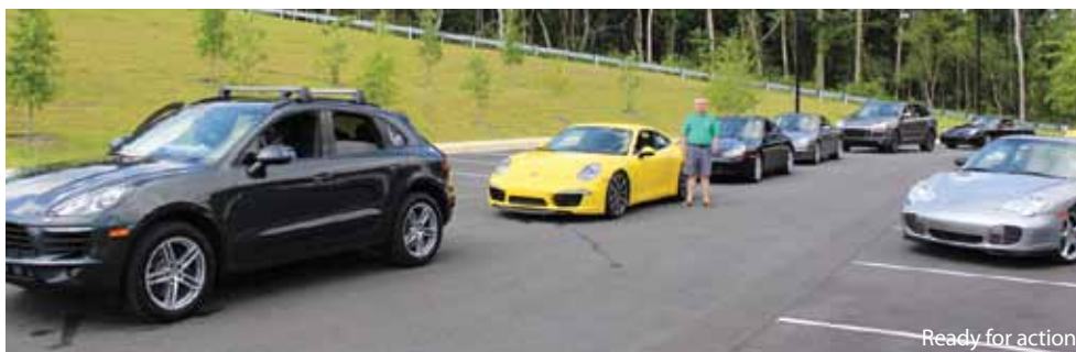
Ready for action