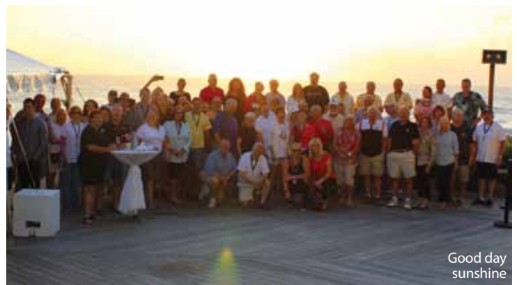
Good day sunshine