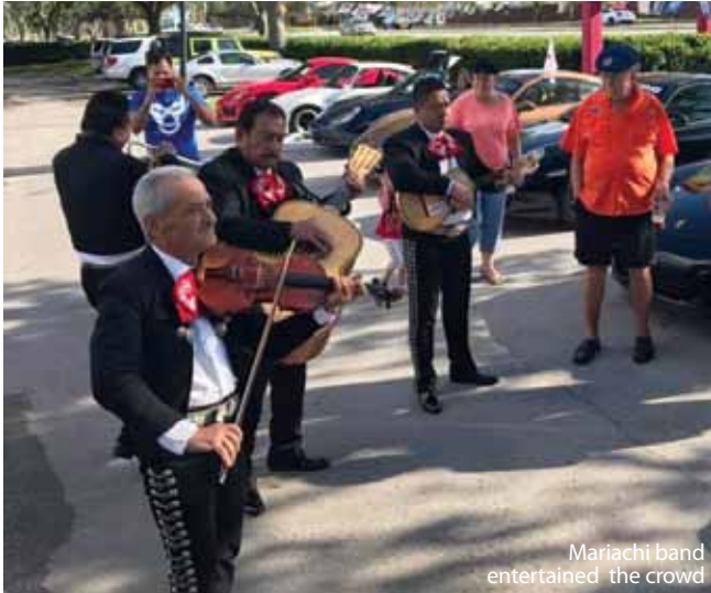
Mariachi band entertained the crowd