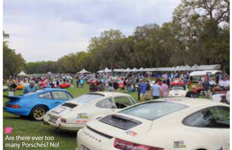
Are there ever too many Porsches? No!

If you like events with nothing but Porsches as far as you can see, with great people who share a love of Porsches, and every Porsche supplier of products you can imagine in attendance, then this has to be a must attend event every year. The grounds were first class, the weather was perfect and the memories will last forever. I would put this just slightly behind Rennsport as the premier Porsche event. The best part is this one is planned to be held every year. When registration opens later this year, sign up early and book your hotel immediately, as that is the only challenge of the event. I promise you will not be disappointed!