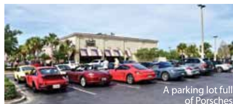
A parking lot full of Porsches

The Northern Division continues to have mostly good participation at our KKs. A couple of our KKs this quarter did have somewhat lower turnouts due to competition with other Porsche activities. Some of these other activities included DEs, auto crosses, and the Sunrise to Sunset Rally (where the Space Coast Region triumphed).