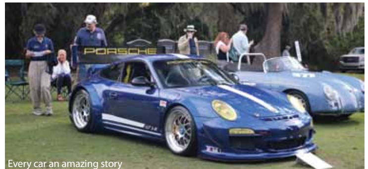
Every car an amazing story

Walking from the Corral parking to Judged parking, we watched the beautiful cars rolling by the sand traps onto #2 fairway to take their spot and owners of already parked cars cleaning and primping at their designated places. At the judges meeting my mindset was this is serious business. My analytical mind wanted to understand all the criteria involved to make a fair assessment. After all, there is some tradition to uphold, right? After a quick hello and brief explanation, we were told to go have fun! But wait, there were questions from both new and experienced judges. The extent of how different the paradigm was to be, sunk in when we were assigned classes. For example, I sent in my qualification letter stating I had owned 951, 964, 996, 981, and 991 series cars so I would be very comfortable judging them. At the end of the judges meeting, the class I drew? 356! Well, I've never even ridden in a 356. Yes, this will be a starting from a blank sheet!