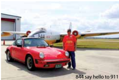
844 say hello to 911

If you missed this great event this year then I am sure there will be even a bigger and better one next year. Stay tuned.