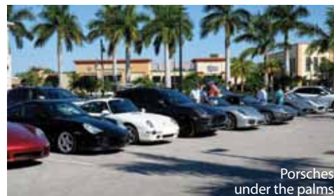
Porsches under the palms

Our Vero Beach Kaffeeklatsch is getting very popular with some new members and also PCA members driving here from further away like the Melbourne area. Why? Because we have a great crowd of Porsche enthusiasts and a fantastic venue. You can have breakfast at Panera and park in our very own parking lot to show off your ride. Having this low key event is very beneficial to us Porsche owners. We can exchange interesting stories and learn from each other like car care tips,