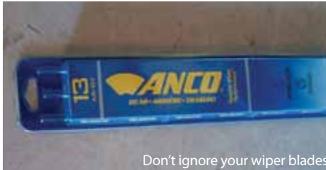
Don't ignore your wiper blades

The windshield wipers are quite easy to change, sliding on and off a pin on the wiper arm. Don't let a bare wiper arm snap onto the windshield, it could crack the windshield. I use the Porsche wipers along with Porsche windshield washer fluid to help reduce chatter. I recently replaced the rear wiper blade, it snaps into the arm.