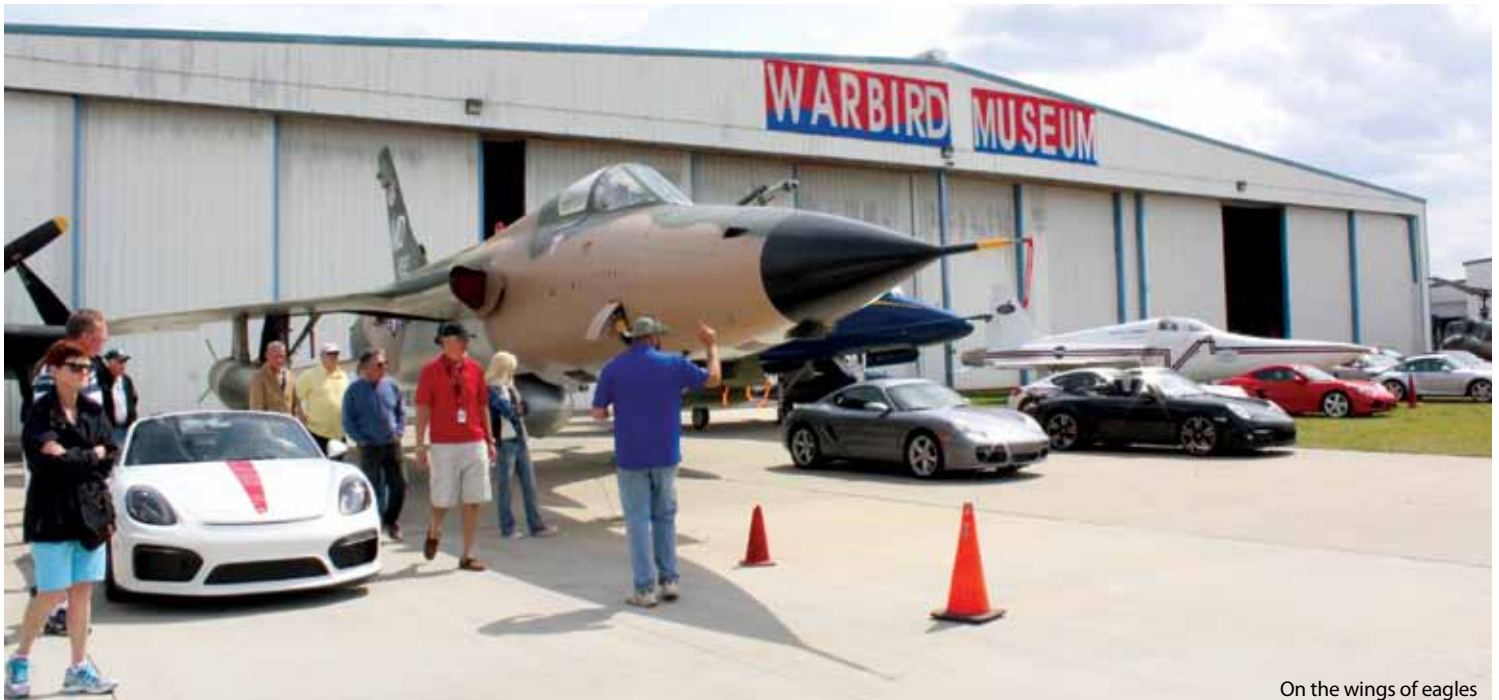
On the wings of eagles