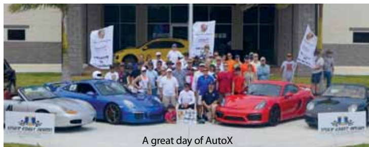
A great day of AutoX