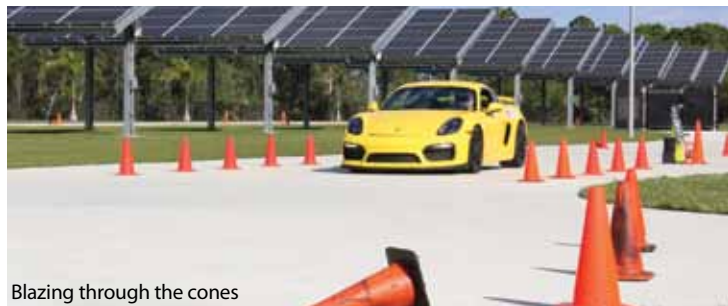
Blazing through the cones