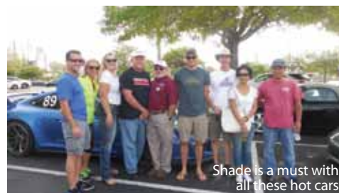
Shade is a must with all these hot cars

attendance levels higher than it has ever been in the past. At one point we had so many attendees, it was difficult to find an open table. Thank you to everyone who came out, and we look forward to seeing you all next quarter.