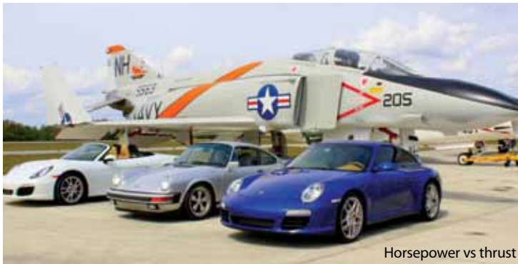
Horsepower vs thrust

Well OK, our Porsche Club did not see any trains (we did cross some RR tracks) as we drove to the Warbird Museum in Titusville. We sure did see plenty of Porsche's (45) and Planes (60) and all up close and personal. It was quite an experience! The weekend before the Tyco Air Show this past March, our club was invited to preview the many historic planes that would be on display at the air show from the Warbird Museum.