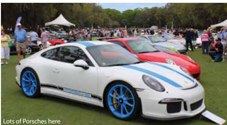
Lots of Porsches here

If you like events with nothing but Porsches as far as you can see, with great people who share a love of Porsches, and every Porsche supplier of products you can imagine in attendance, then this has to be a must attend event every year. The grounds were first class, the weather was perfect and the memories will last forever. I would put this just slightly behind Rennsport as the premier Porsche event. The best part is this one is planned to be held every year. When registration opens later this year, sign up early and book your hotel immediately, as that is the only challenge of the event. I promise you will not be disappointed!