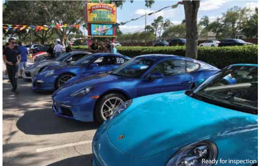
Ready for inspection