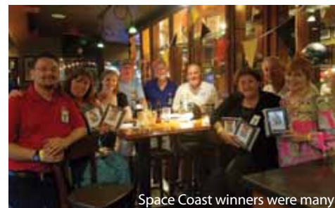
Space Coast winners were many

won at Zonefest! Twelve trophies were brought home in total, not to mention the certificate for a Free DE and custom 911 purse that we won in door prizes.