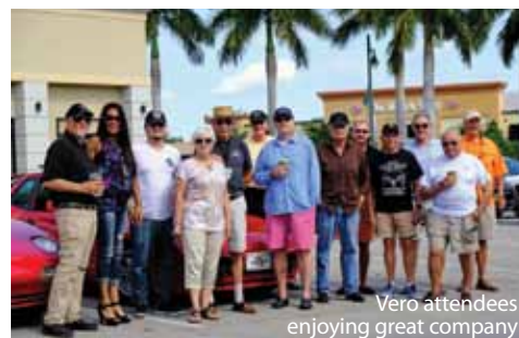
Vero attendees enjoying great company