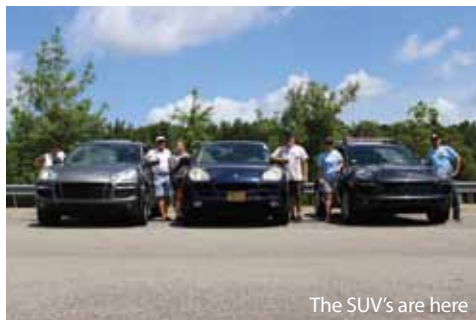
The SUV's are here

What a weekend! Zonefest was held over Memorial Weekend in Tallahassee. We had 9 "SpaceCoasters" make the trek to the annual multi-regional 3 day event. Of those Space Coasters participating, 1 Cayman, 1 Boxster, 2 Cayenne's and one Macan were in attendance.