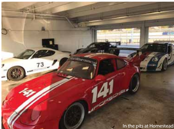
In the pits at Homestead

On Sunday morning I was promoted into the red group. Now, as an advanced solo driver, I would be allowed to drive on the banks. Instead of diving back into the infield just before NASCAR turn 3, the course now continued down the back straight into the banked turns of NASCAR turns 3 and 4. When approaching NASCAR turn 1, I dove back into the infield for that part of the road course as before.