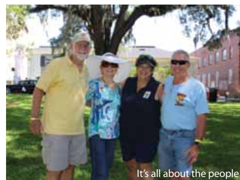
It's all about the people

We would like to offer a big THANK YOU to the North Florida Region for hosting a wonderful Zone Fest this year! In addition to being gracious hosts, they made sure we had fun events, and plenty to keep us busy, not to mention providing outstanding weather. All in all, a perfect weekend spending time with friends and playing with cars!