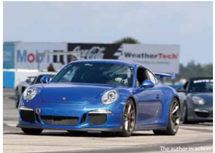
The author in action

Participants include both students and instructors. Students are grouped according to their ability and experience, with "Green Novice Group" students being the least experienced, «Blue Advanced Intermediate Group» being more experienced. There are three solo groups, "White Solo" is the lowest level not requiring an instructor ride along. The remaining two "Advanced Solo Groups" are comprised of advanced solo drivers and instructors being the most experienced. Advancement to higher levels including becoming an Instructor is solely dependent on the student's demonstrated ability and desire to improve. "Seat time" or time on track will is the best learning tool