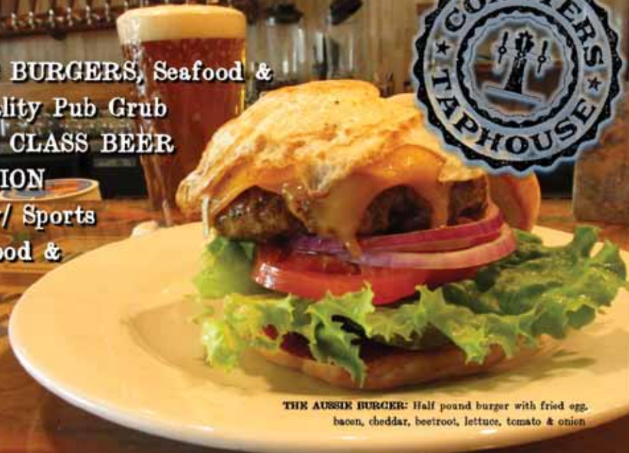
THE AUSSIE BURGER: Half pound burger with fried egg, bacon, cheddar, beetroot, lettuce, tomato & onion

COASTERS TAPHOUSE - 5675 North Atlantic Ave #122 - Cocoa Beach, FL 32931 (321)613-3041 -- Facebook.com/CoastersTaphouse