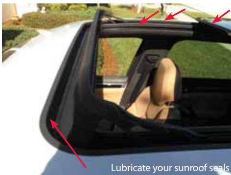
Lubricate your sunroof seals

I fully open the sunroof, spray some silicon lubricant on a paper towel and rub that on all the sunroof rubber gaskets shown by red arrows in the photo below. DO NOT use regular WD40 on the seals.