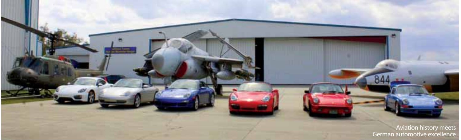
Aviation history meets German automotive excellence

museum volunteers, for helping make this a very special experience for us and to be able to park our special cars in and around such special airplanes.