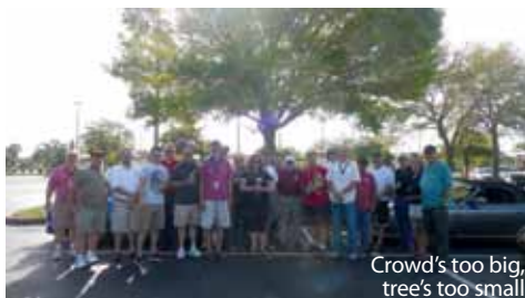
Crowd's too big, tree's too small