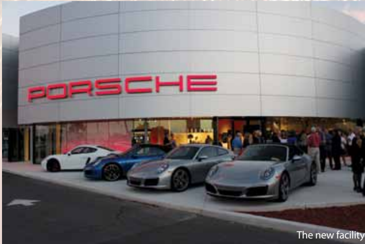
The new facility

Porsche of Melbourne recently had the opportunity to showcase the all new 2017 Porsche Panamera at our brand new Porsche Center. The Panamera sure has come a long way, and now rightfully carries the torch as our premier flagship car. Porsche not only redesigned the Panamera to showcase the latest in advanced technology, but refined every aspect to solidify it's position as the world's greatest 4-door sports car.