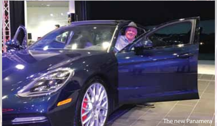
The new Panamera

We invited legendary sports car driver Derek Bell, five time winner of the 24 Hours of Le Mans. We were also joined by tennis great Ivan Lendl. Both stayed for photo opportunities and are always a pleasure