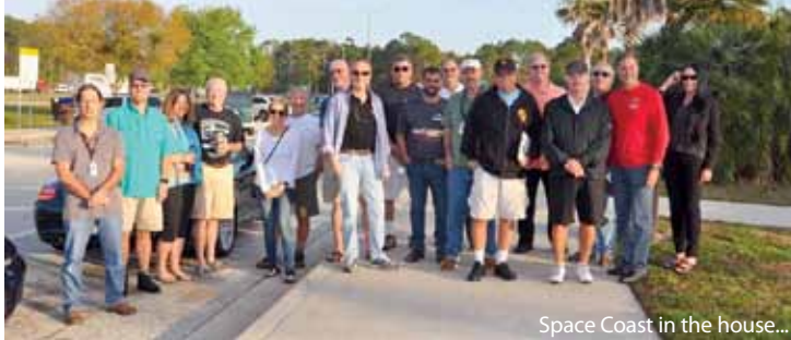
Space Coast in the house...

When Werks Reunion Monterey was created by the PCA in 2014 as an event to celebrate both the Porsche marque as well as the camaraderie of being an enthusiast, those of us on the East Coast felt a little bit jealous. This year we finally got a Werks Reunion we could call our own at Amelia Island. Registrations officially sold out over two weeks prior to the event with over 670 Porsche vehicles on display, 160 of which appeared in the judged competition. The general event parking was filled with Porsches as well. The goal was to take what was learned in Monterey and bring this great event to the East Coast to allow club members and Porsche fans on the other side of the country to participate as well. Attendance was free for spectators.