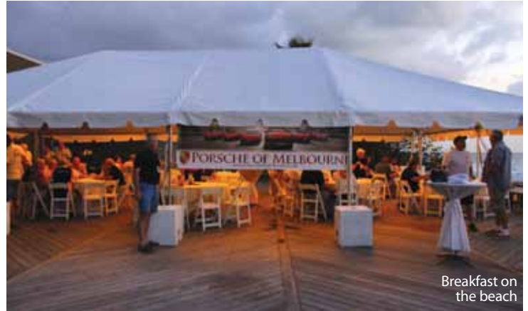
Breakfast on the beach

It was easy pointing out the answers to the clues as I had seen them twice before. Sadly, my navigational skills still went sideways when we got to talking and we drove an hour in the wrong direction while watching for the "Right at T" instruction! I blame the Rally Master!