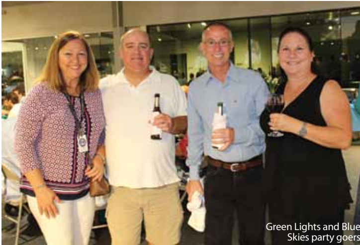
Green Lights and Blue Skies party goers

Saturday morning we arrived at 6:30AM and were treated to a huge breakfast while watching a beautiful sunrise from the deck of the Crowne Plaza Hotel in Melbourne Beach. As the Rally Master's wife, I was unable to participate in the rally competition, so I rode as navigator with our friend Roger McGehee who was new to the whole Gimmick Rally concept.