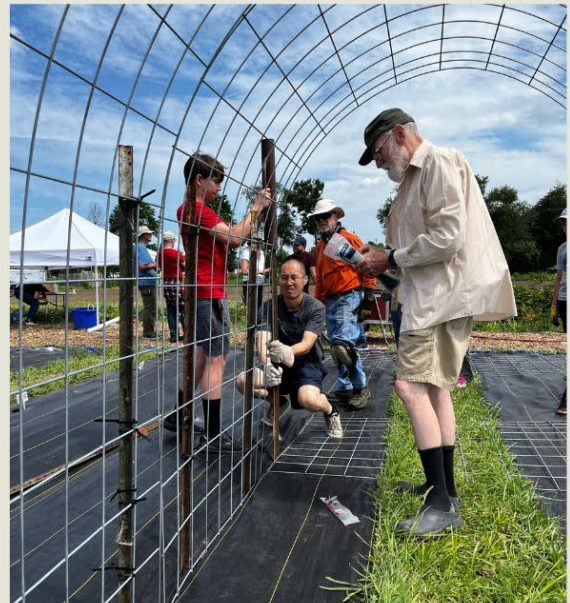
Volunteering at Sola Gratia Farm Part 2