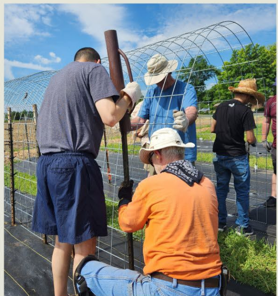
Volunteering at Sola Gratia Farm Part 1