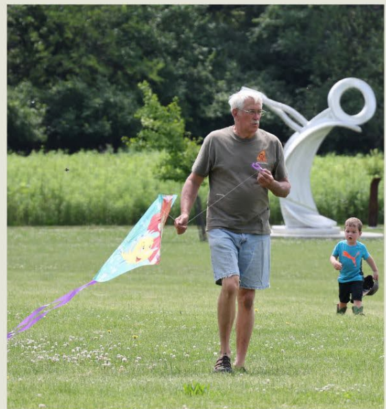
Kite Flying at Meadowbrook Park June 19, 2024