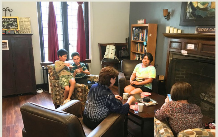
ESL & International Coffeehouse