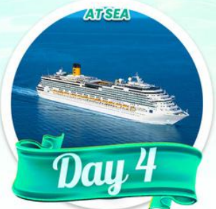
Breakfast + Lunch + Dinner

•Embark from Hakata Port •Enjoy Welcome Dinner Buffet at Cruise Restaurant