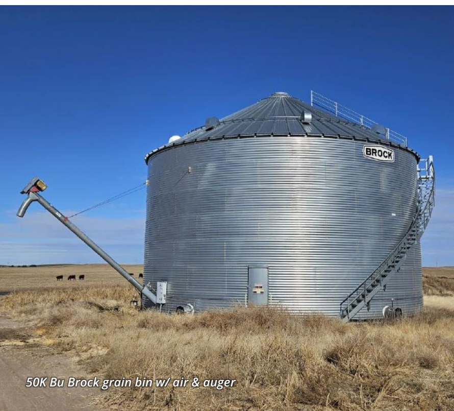
50K Bu Brock grain bin w/ air & auger