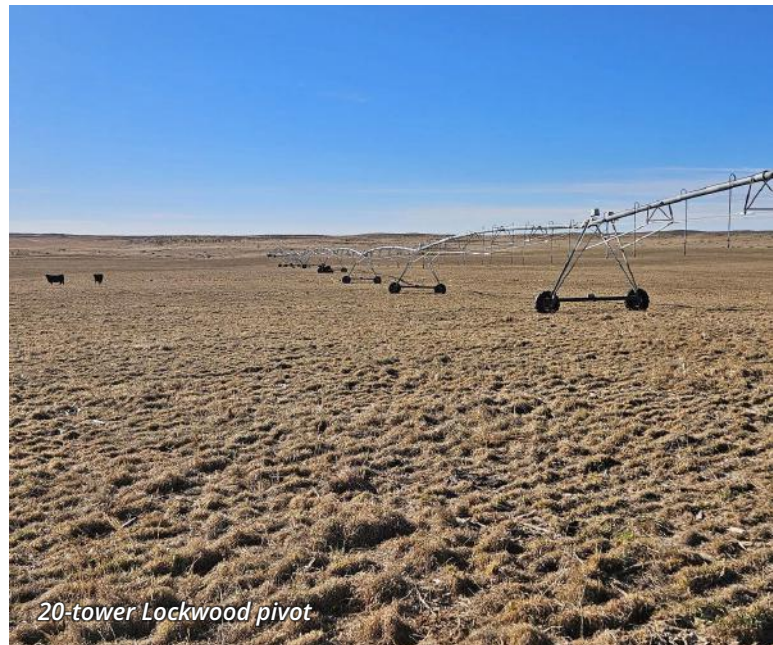
20-tower Lockwood pivot