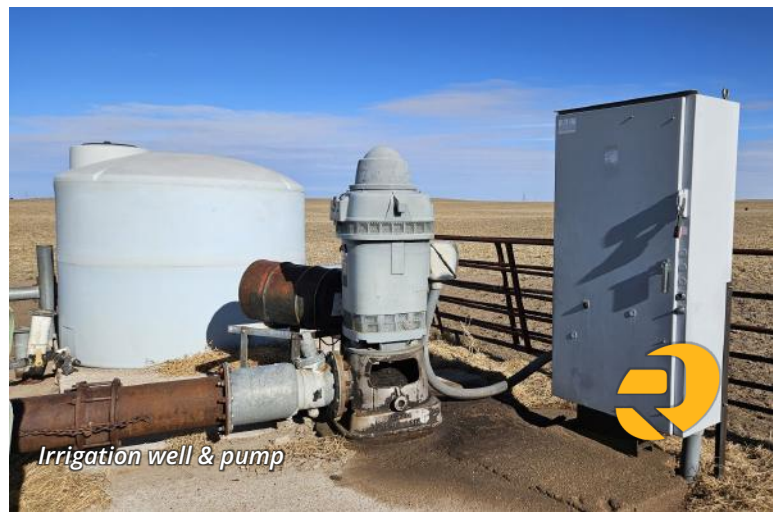
Irrigation well & pump