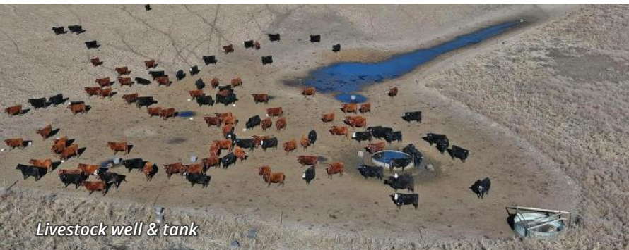
Livestock well & tank

The reserve/opening bid set at $2.3M, meaning that the reserve will be met after the first bid is placed.