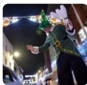
Hinckley & Bosworth Borough Council

Hinckley & Bosworth Borough Council and the United Reformed Church invite local disabled and elderly residents to come into Hinckley to see the Christmas lights. Castle Street will be opened to traffic from 6pm to 8pm. Anyone is welcome to come and drive at your leisure to view the Christmas lights and then exit onto Regent Street.