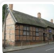
Hinckley & Bosworth Borough Council

A celebration of Hinckley's heritage with Hinckley Museum, the Atkins Building and others opening their doors to the public, as well as a display by Hinckley District Past and Present in the town centre, and other heritage activities.