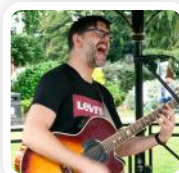
Hinckley & Bosworth Borough Council