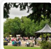
Hinckley & Bosworth Borough Council