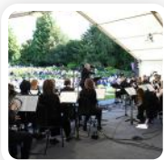
Hinckley & Bosworth Borough Council