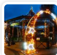
Hinckley & Bosworth Borough Council

'Lights in the Mead' - thousands of twinkling fairy lights in hues of green, blue and pink around the trees, pathways and bandstand. The 'Lights in the Mead' will be turned on in zones on the night of Hinckley's Christmas Lights Switch On. 'Lights in the Mead' will then be on daily, every evening thereafter (Saturday 22 November 2025 until Monday 5 January 2026).