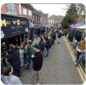
Hinckley & Bosworth Borough Council