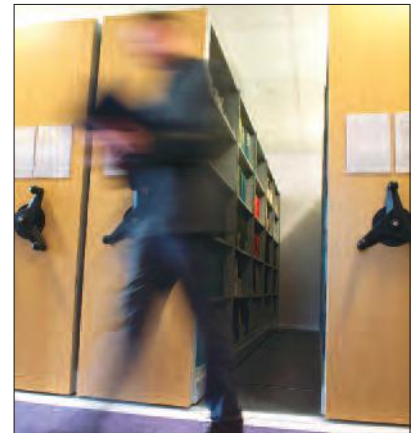
Mobile shelving offers a high density storage solution, making ideal for offices where space is at a premium.

Design + Supply + Installation by : STORAGE DESIGN LIMITED Primrose Hill, Cowbridge South Wales, CF71 7DU Tel: 01446 772614 Fax: 01446 774770 web: www.storage-design.ltd.uk email: info@storage-design.ltd.uk