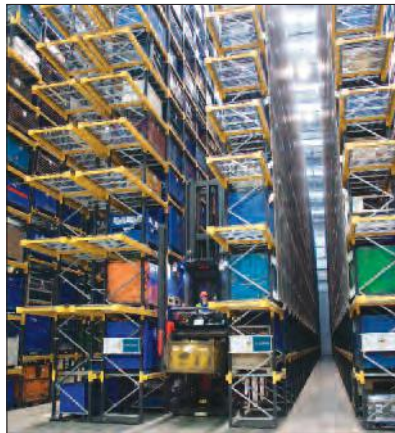
We have a wide range of pallet racking solutions to meet your operational needs, whatever your warehouse size.