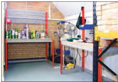
A range of packing and maintenance benches for use throughout production and warehousing operations.

Whatever your needs, contact us today on 0800 169 5151 and we will help solving your storage problems a lot easier!