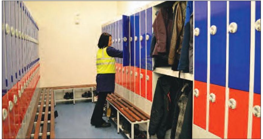
Our steel lockers are available in a wide range of sizes, door configurations, locking options, colours and finishes ensuring staff belongings are safe and secure.