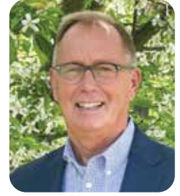
Dean Bourdages Commissioner