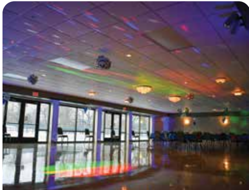
THE TERRACE ROOM Hopkins Park Community Center