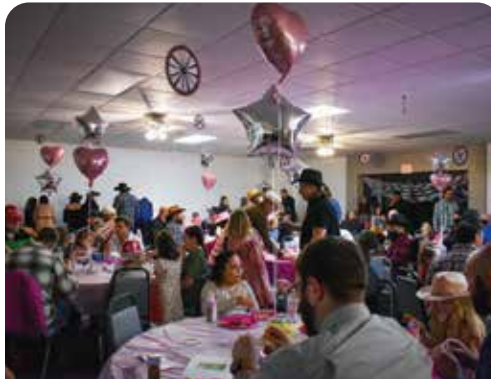
HOPKINS LOWER LEVEL Hopkins Park Community Center