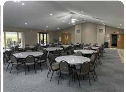
THE CLUBHOUSE River Heights Golf Course