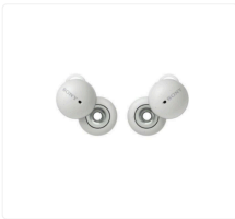
SONY - Linkbuds True Wireless Earbuds