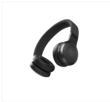
JBL - Tune 760 BT Over Ear Noise Canceling Headphones