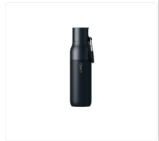
LARQ - Self Cleaning Water Bottle