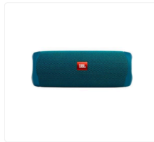
JBL - Flip 5 Speaker