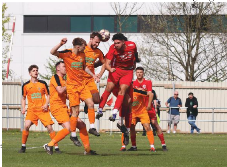
Wombell Town beat Athersley Recreation 4-1.

There is one game outstanding in Division One, Shelley's abandoned home clash with Nostell Miners Welfare last month is still going