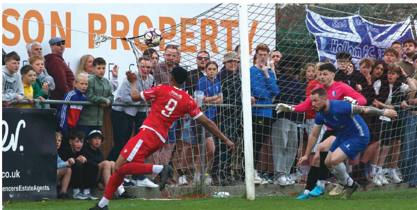
A frantic last few minutes as Hallam clung on against Thackley