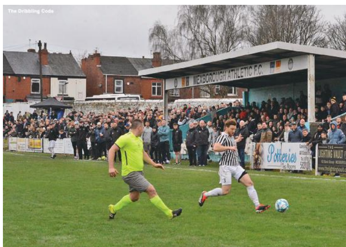
Action from last years final