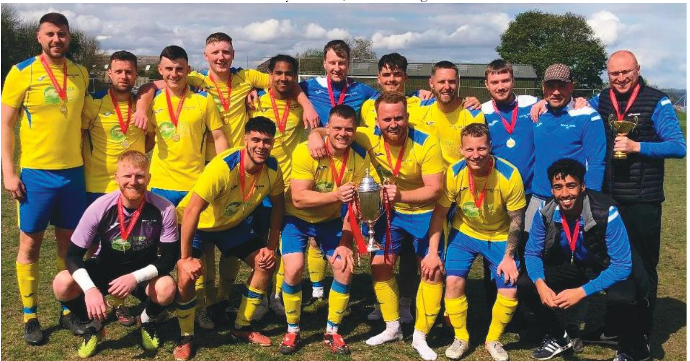
Royal Earl FC - Blades Super Draw Sunday Sports League Champions 2024-25