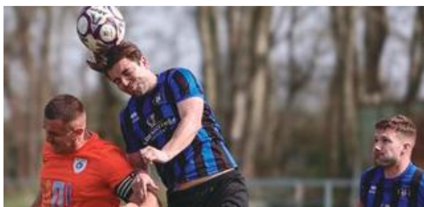
South Yorkshire derby action between Club Thorne Colliery and Swallownest