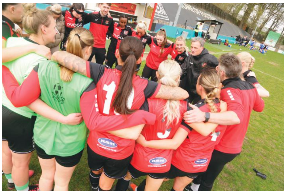
All together. Sheffield FC in huddle after their title clinching victory.

Barnsley Women were pegged back by a late equaliser in their home game against Worcester City in